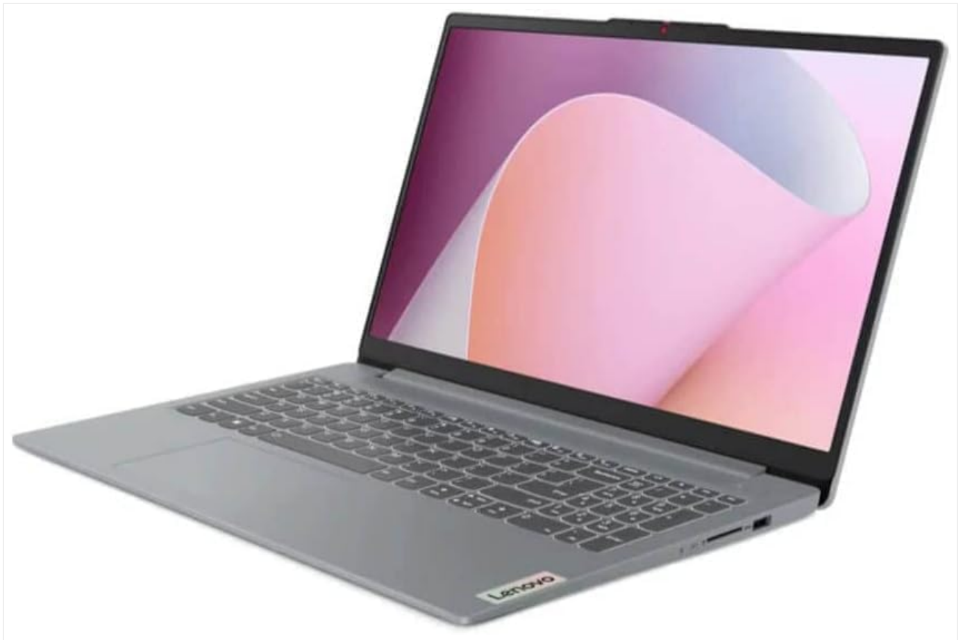
Figure 4.1: Angled View of Laptop (Right Side)

This image provides an angled view of the Lenovo IdeaPad Slim 3 laptop from the right side, showcasing its slim profile and the right-side ports, including a USB Type-A port and an SD card reader.