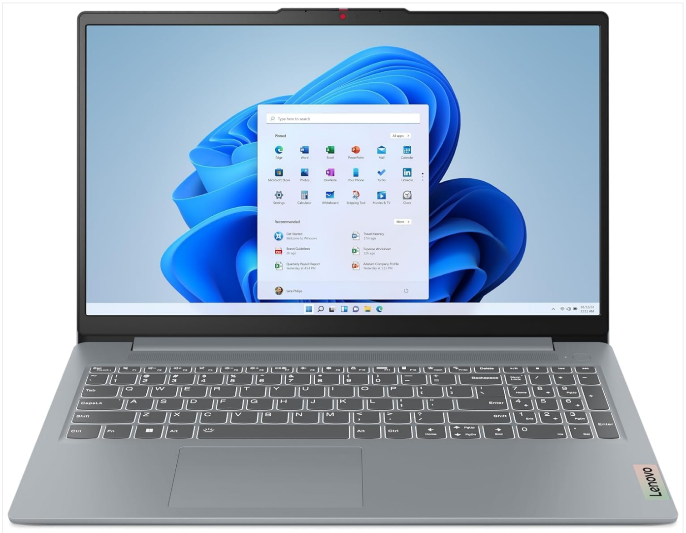
Figure 1.1: Lenovo IdeaPad Slim 3 15ABR8 Laptop (Front View)

This image shows the Lenovo IdeaPad Slim 3 laptop with its lid open, displaying the Windows 11 operating system desktop. The keyboard and touchpad are visible below the screen.