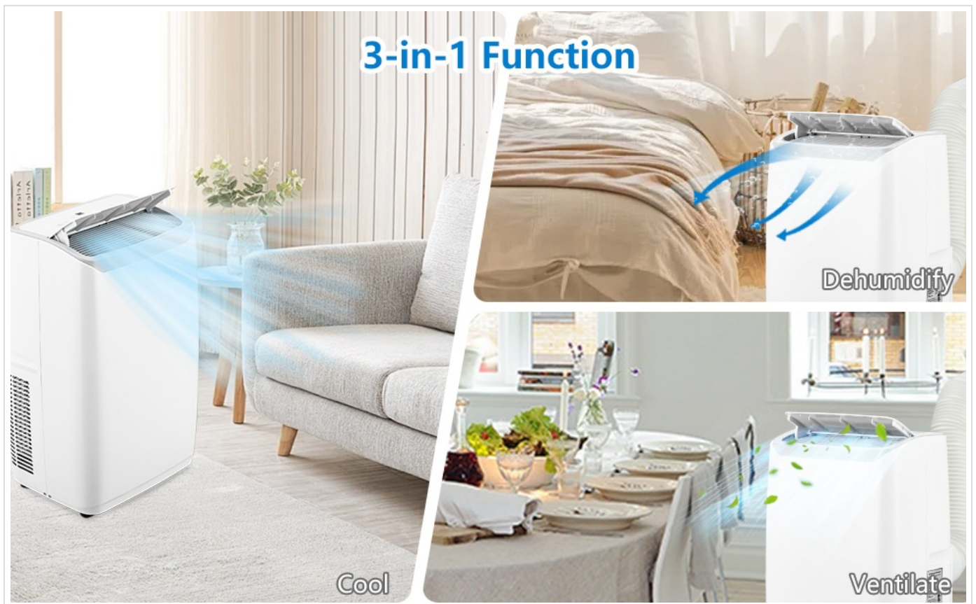
Figure 3: 3-in-1 Functionality

This image illustrates the three primary functions of the portable air conditioner: cooling, dehumidifying, and ventilating, demonstrating its versatility for different environmental needs.