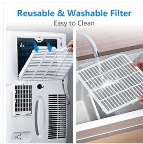
Figure 9: Reusable and Washable Filter

This image illustrates the process of removing the air filter from the unit and cleaning it under running water, emphasizing its reusability.