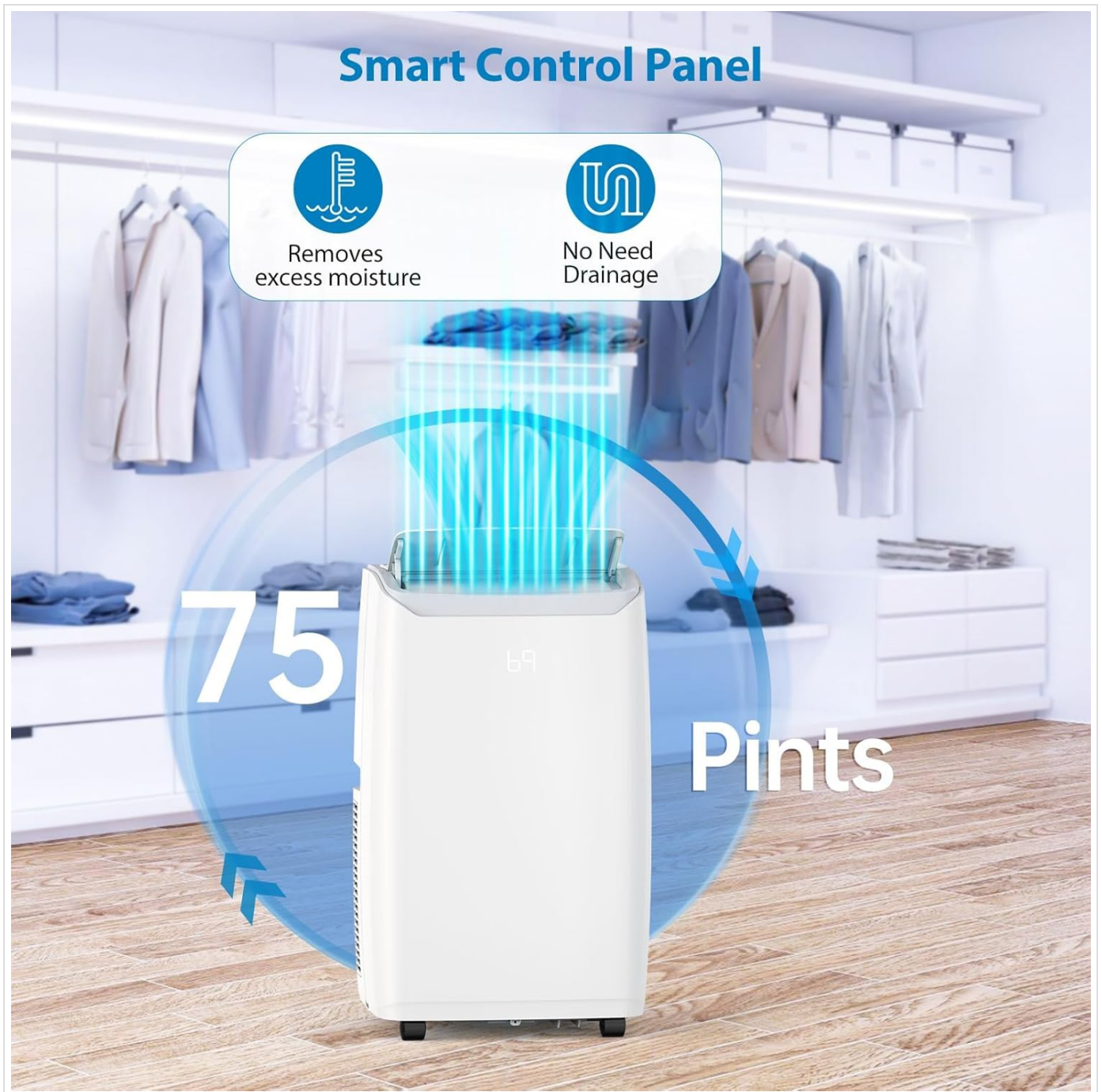
Figure 10: Dehumidification Capacity

This image highlights the unit's ability to remove excess moisture, with a capacity of up to 75 pints per day, contributing to a more comfortable environment.