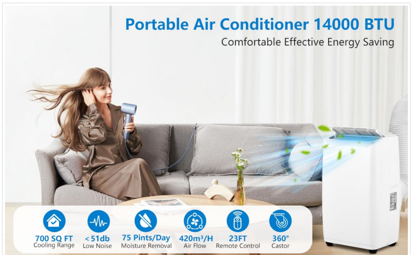
Figure 2: Key Performance Indicators

This diagram highlights the unit's powerful cooling capacity of 14,000 BTU, its ability to cool rooms up to 750 sq. ft., and a maximum air flow of 400m 3 /h.