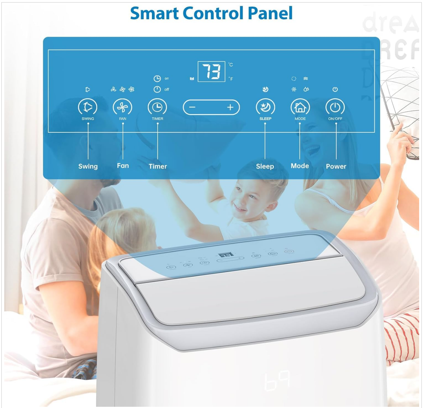
Figure 7: Smart Control Panel Overview

This image provides a detailed view of the unit's control panel, labeling buttons for Swing, Fan, Timer, Temperature adjustment (+/-), Sleep, Mode, and Power (On/Off).