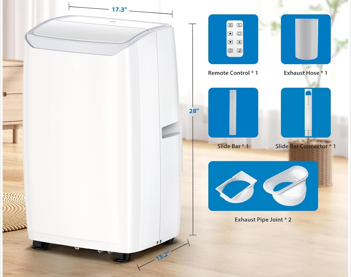
Figure 4: Included Accessories and Unit Dimensions

This image displays the portable air conditioner unit with its dimensions (17.3" x 13.2" x 28") and all included accessories: remote control, exhaust hose, slide bar, slide bar connector, and two exhaust pipe joints.