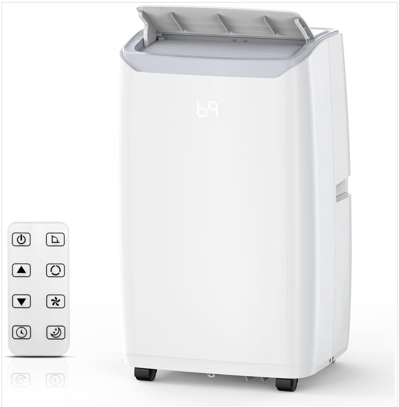
Figure 1: KOKEBREN 14000 BTU Portable Air Conditioner and Remote Control

This image displays the main unit of the KOKEBREN portable air conditioner in white, alongside its remote control. The unit features a digital display on top and is equipped with wheels for easy mobility.