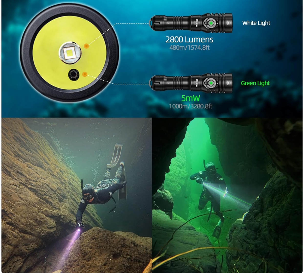
Image: Wurkkos DL03 Dive Light demonstrating its 2-in-1 white light and green laser functions underwater.