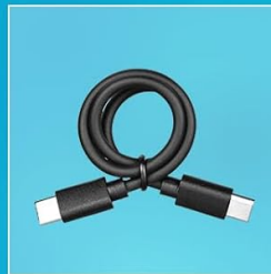
Type-C Charging Cable *1