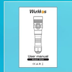
User Manual * 1

Image: Wurkkos DL03 Dive Light package contents.