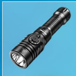
DL03 Dive Light * 1