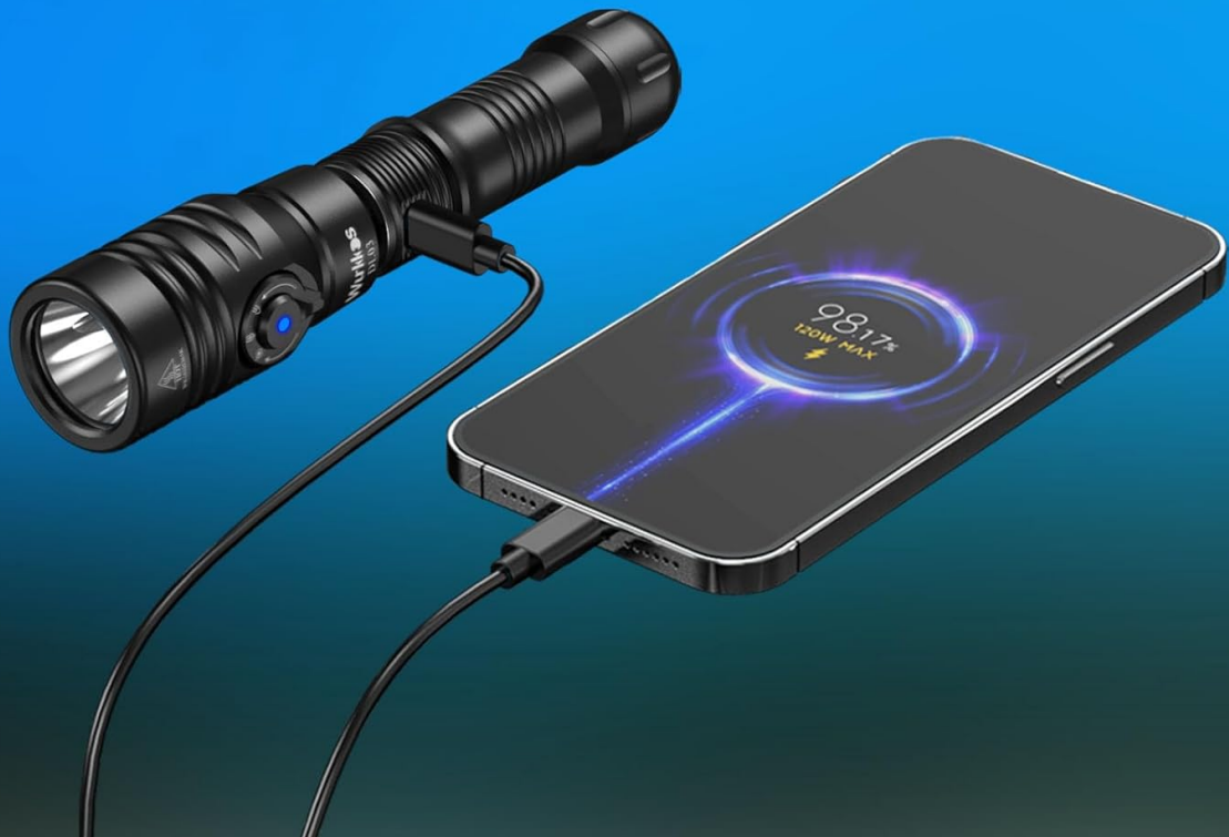
Image: USB-C charging port and reverse charging function.

Full Charged= Green Charging=Flash Green