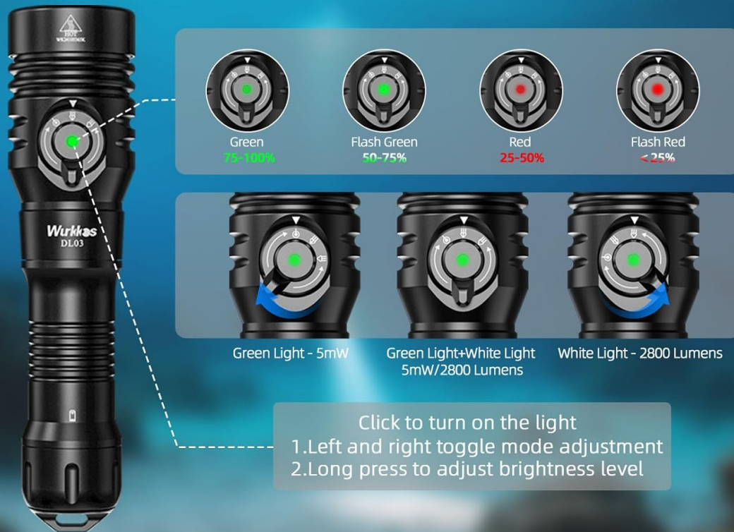
Image: Power Indicator and Dual Switch Design.

The remaining power indicator built into the side switch lets you know the real-time battery power level.