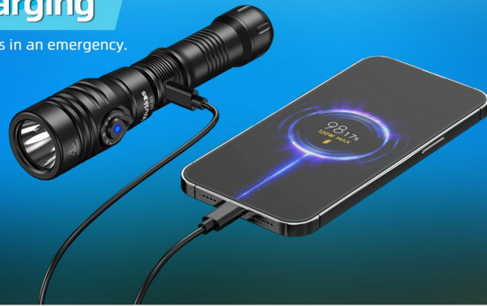
Image: USB-C Reverse Charging feature.

It takes about 2 hours to fully charge using Type-c.