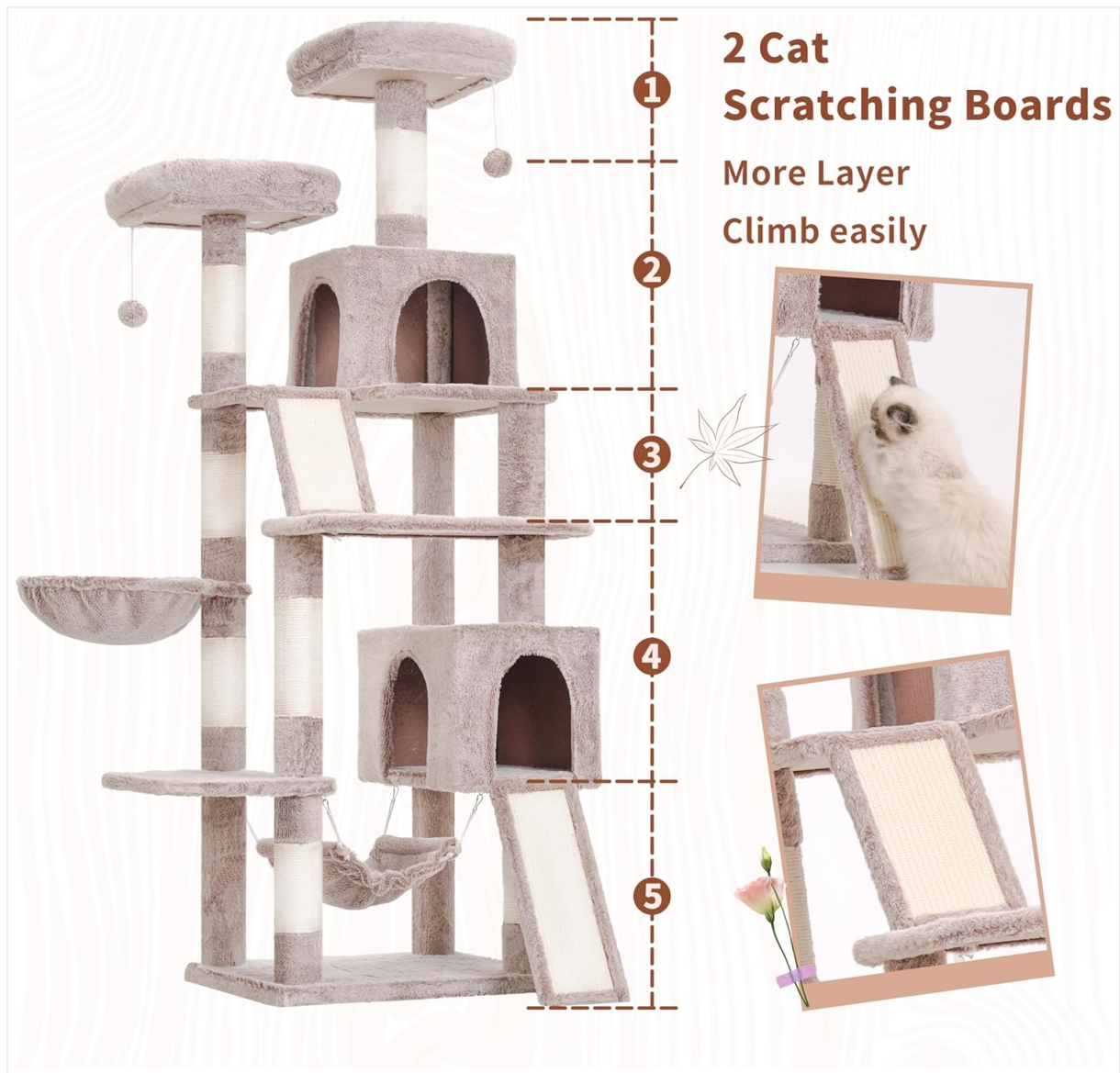
Figure 2.1: Overview of Cat Tree Components

The package includes various posts, platforms, two cat condos, two plush perches, a hammock, a hanging basket, two scratching boards, and all necessary hardware (screws, bolts, Allen wrench) for assembly.