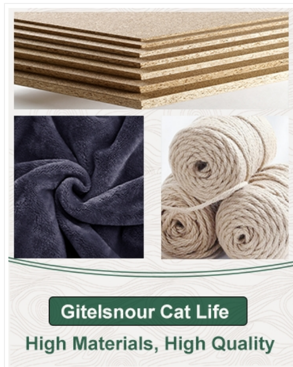
Figure 7.1: Primary Materials Used