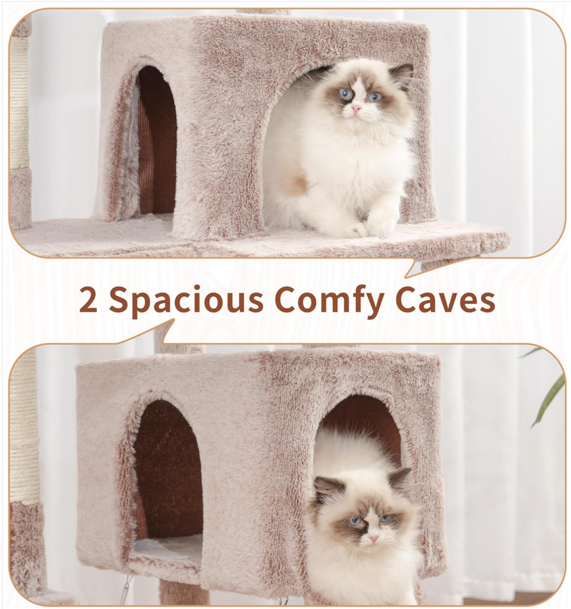
Figure 4.2: Plush Cat Condos