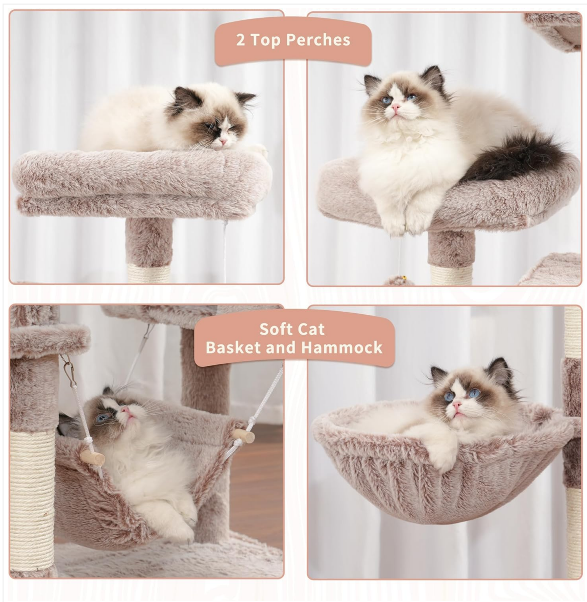
Figure 4.3: Top Perches, Hammock, and Basket