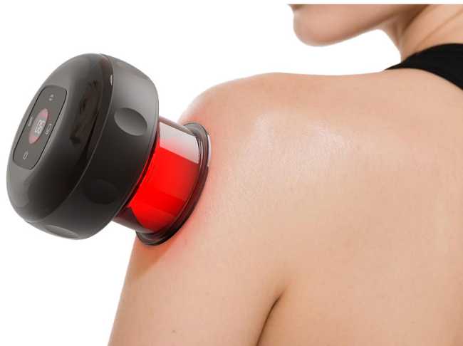
Figure 1: Comparison of the Smart Cupping Massager with a Traditional Cupping Massager, highlighting ease of use and integrated features.

Relieves pain and inflammation, speeding up skin and muscle tissue recovery for ultimate relaxation.