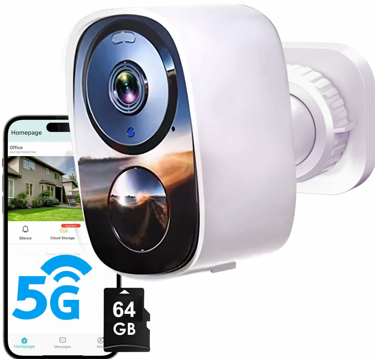
Figure 8: The camera is 100% wireless and IP66 weatherproof, suitable for all seasons.