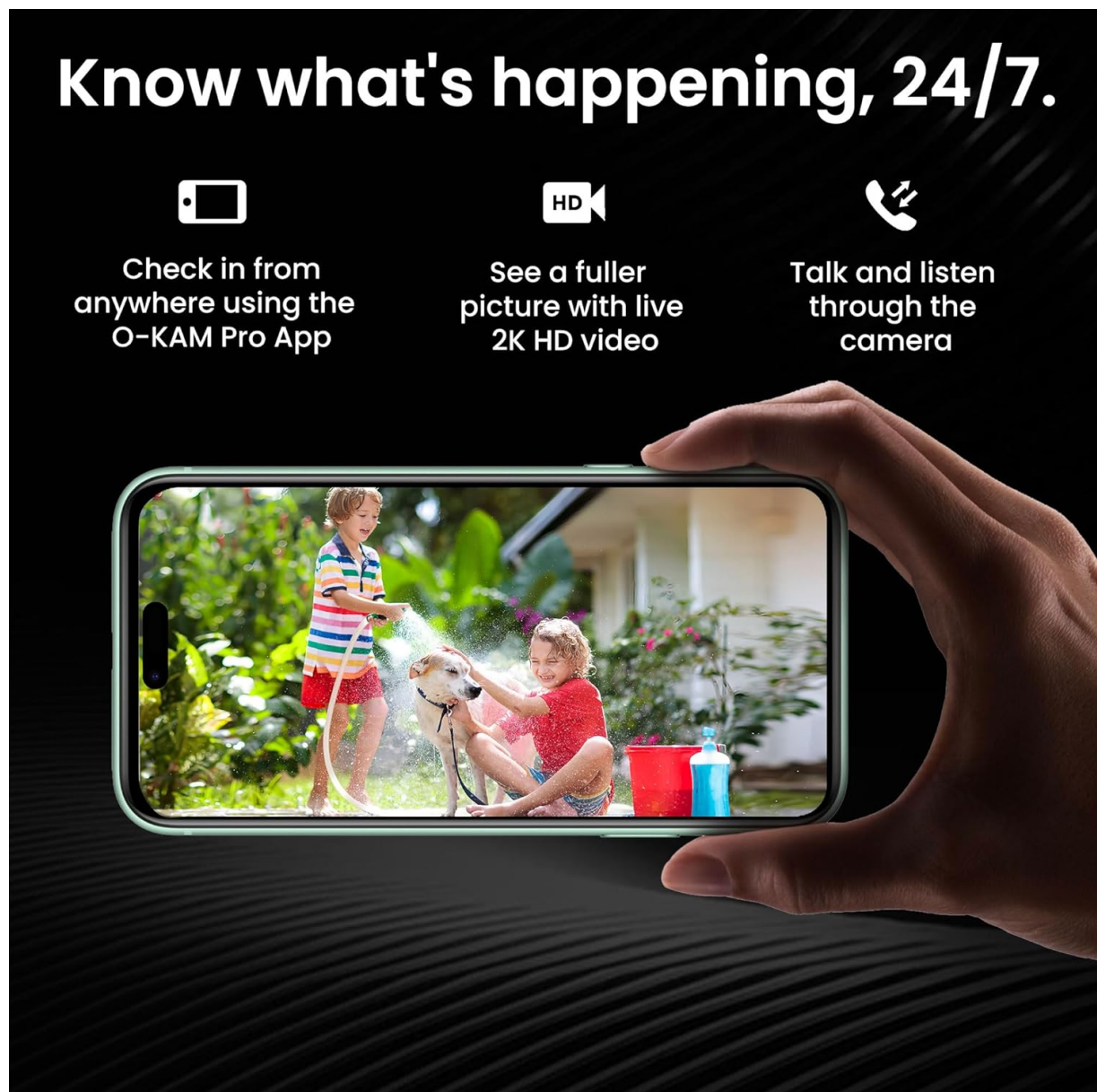
Figure 2: The O-KAM Pro App interface, showing live camera feed and control options.