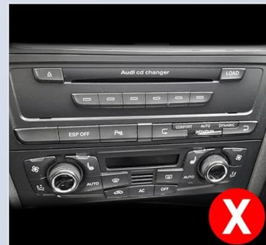
Audi cd changer