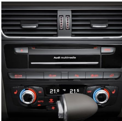
Original CD Player