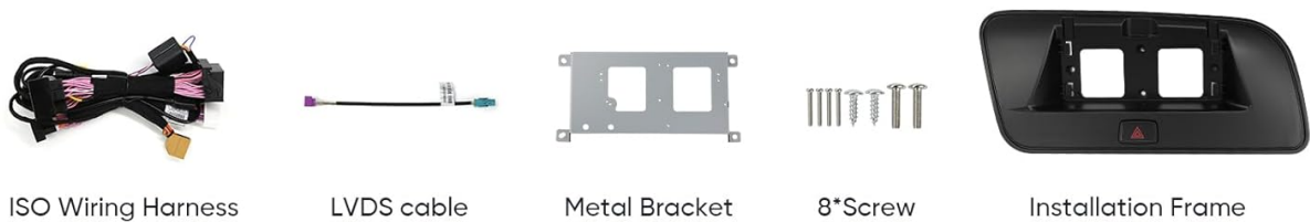
Figure 8: Visual representation of the product dimensions and the accessories included in the box.