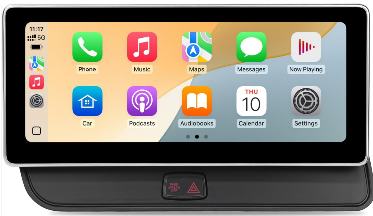
Figure 1: AINAVI 10.25 inch Touch Screen for Audi Q5 Multimedia.