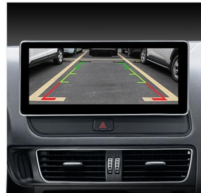
Original Backup Camera