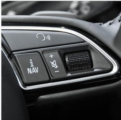
Steering Wheel Control