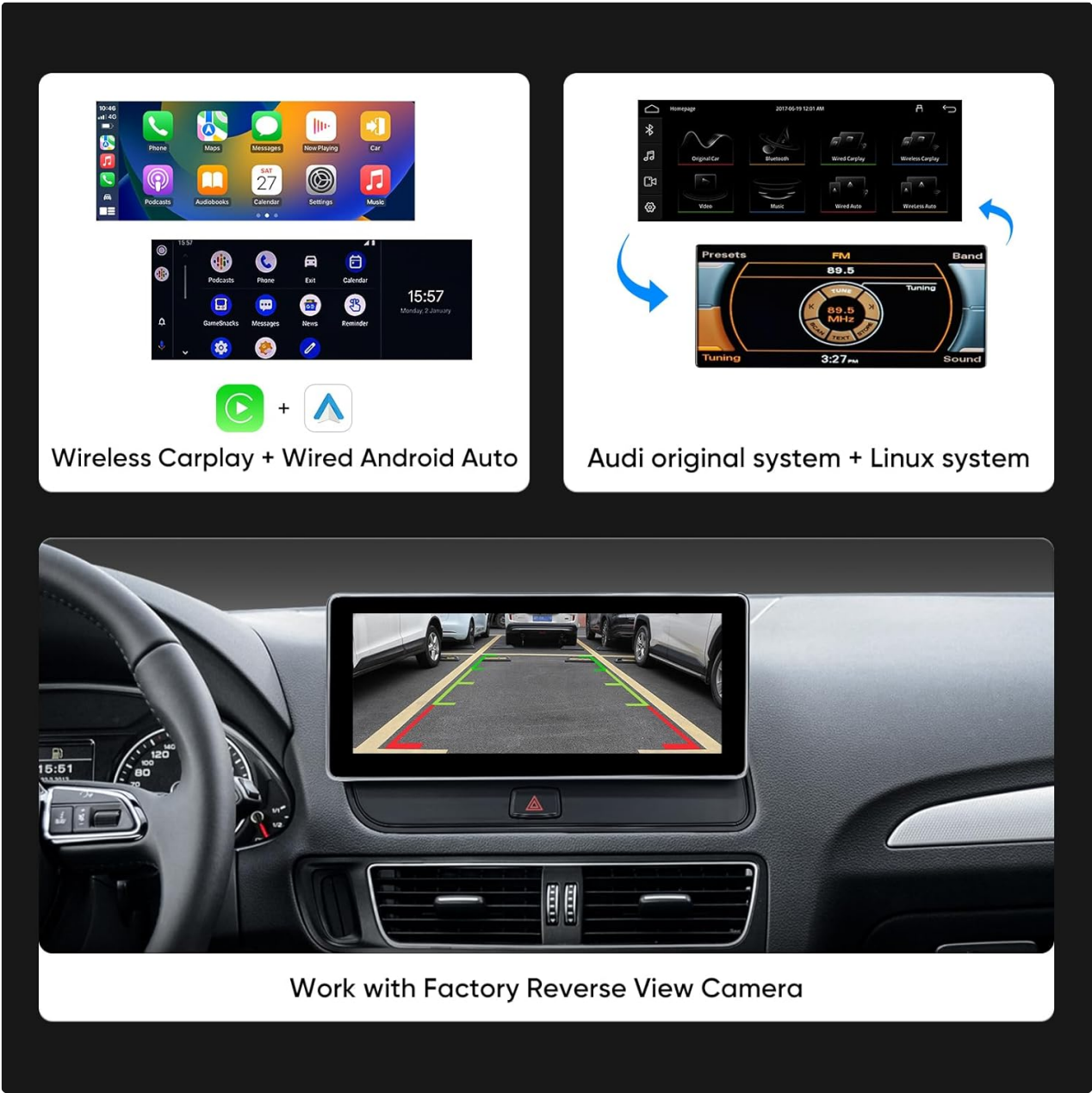
Figure 6: The user interface displaying options for Wireless CarPlay and Wired Android Auto, alongside the original Audi system.