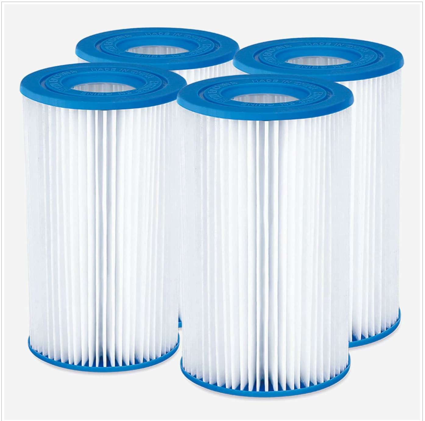
Image: Funsicle Type A/C Filter Cartridge 4-Pack packaging, showing four individual cartridges.