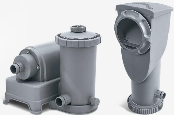
CP2000 SFX1000 & SFX1500