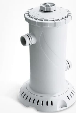
RX1000 & RX1500

Image: Visual representation of Funsicle CP2000, SFX1000 & SFX1500, and RX1000 & RX1500 pump models, indicating compatibility with Type A/C filters.