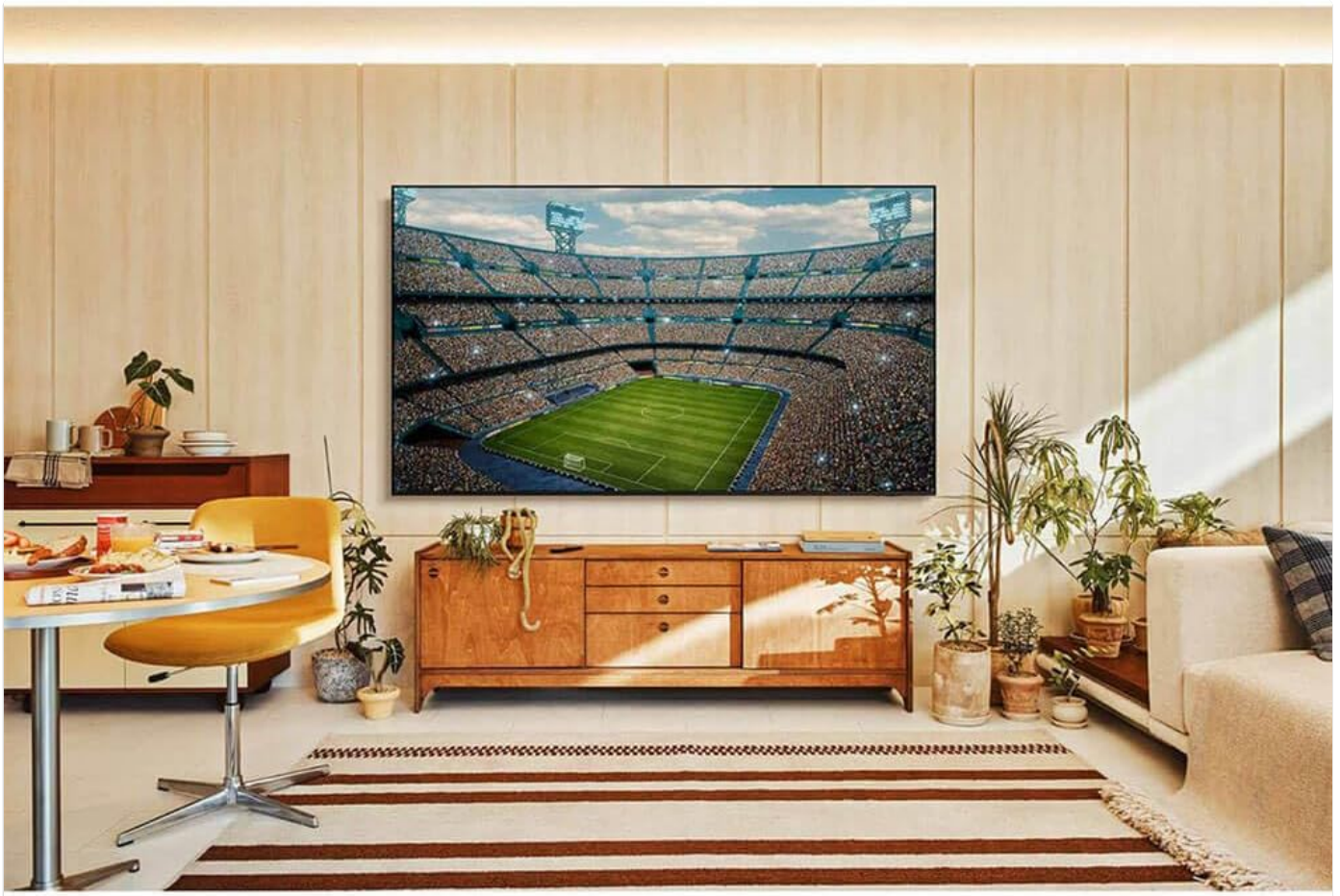
Figure 4.2: The Crystal Processor 4K, responsible for powering 3D color mapping and upscaling for clear picture quality.