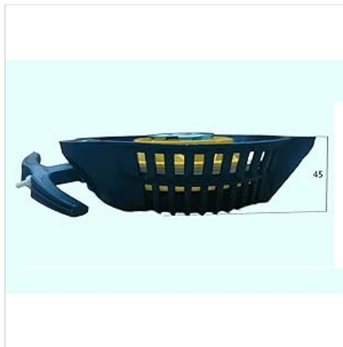
Figure 3: Side view of the recoil starter, highlighting its profile and overall height dimension of 45mm.