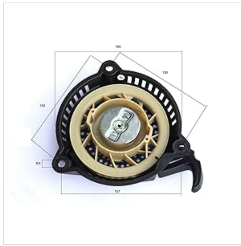
Figure 2: Technical diagram illustrating various views and key dimensions of the recoil starter mechanism, including the black plastic housing and internal beige components. Dimensions are provided in millimeters.