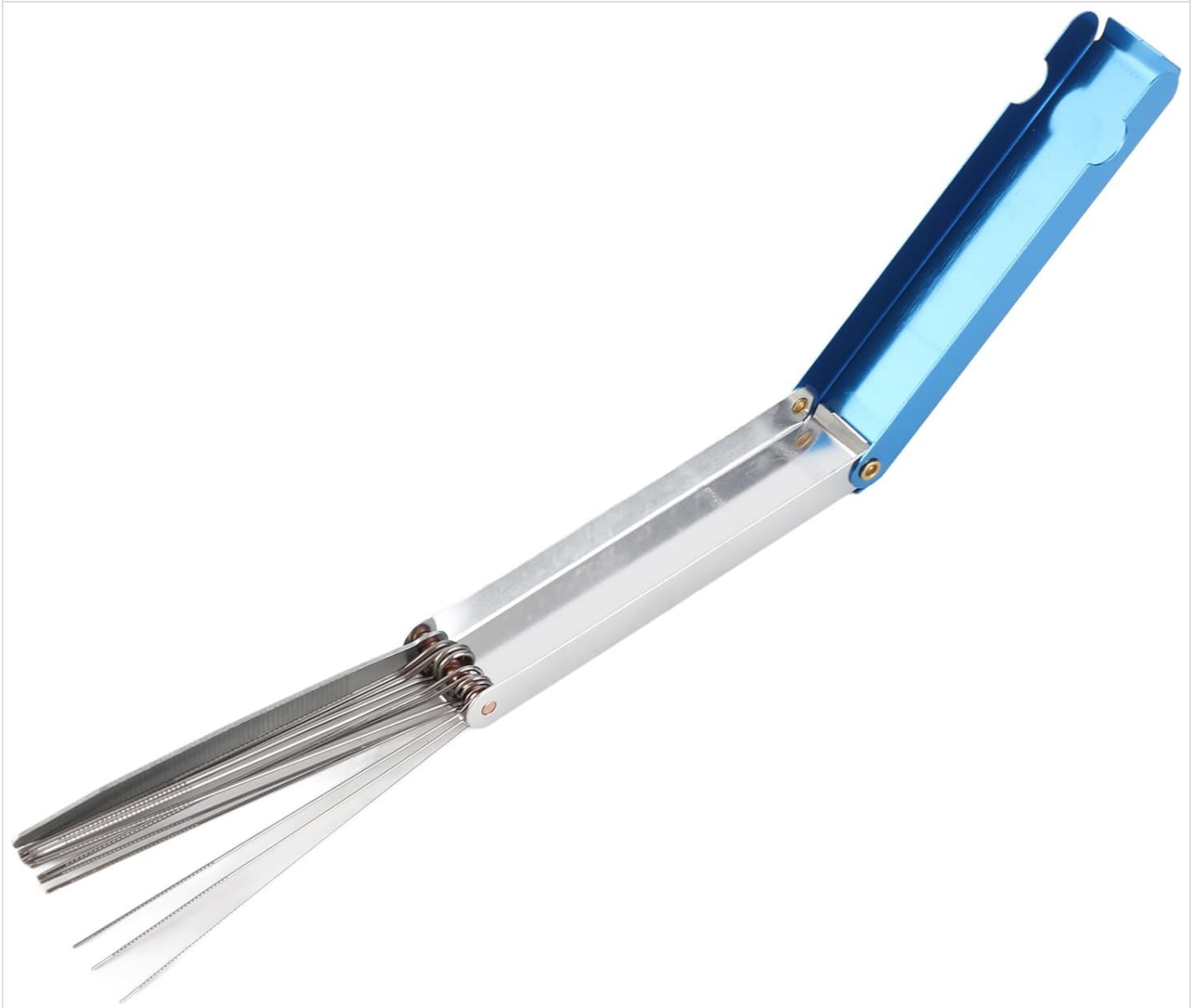
Image: The Generic Nozzle Cleaning Needle Set with its various stainless steel needles fanned out, illustrating the different sizes available for cleaning.