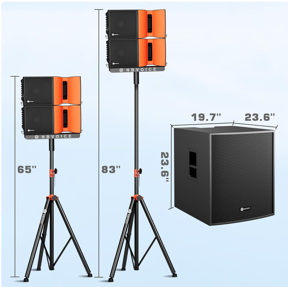
Figure 4.1: This diagram illustrates the physical dimensions of the subwoofer (19.7" W x 23.6" D x 23.6" H) and the adjustable height of the line array speakers on their tripods (65" to 83").