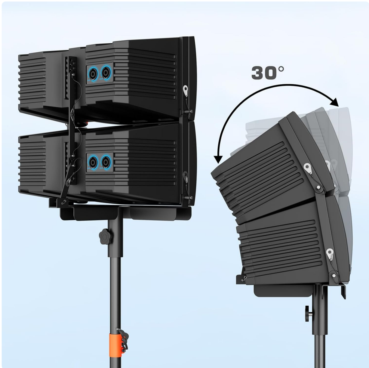
Figure 5.1: The line array speakers can be adjusted up to 30 degrees on their tripods, allowing for optimal sound dispersion in various environments.

Your browser does not support the video tag.