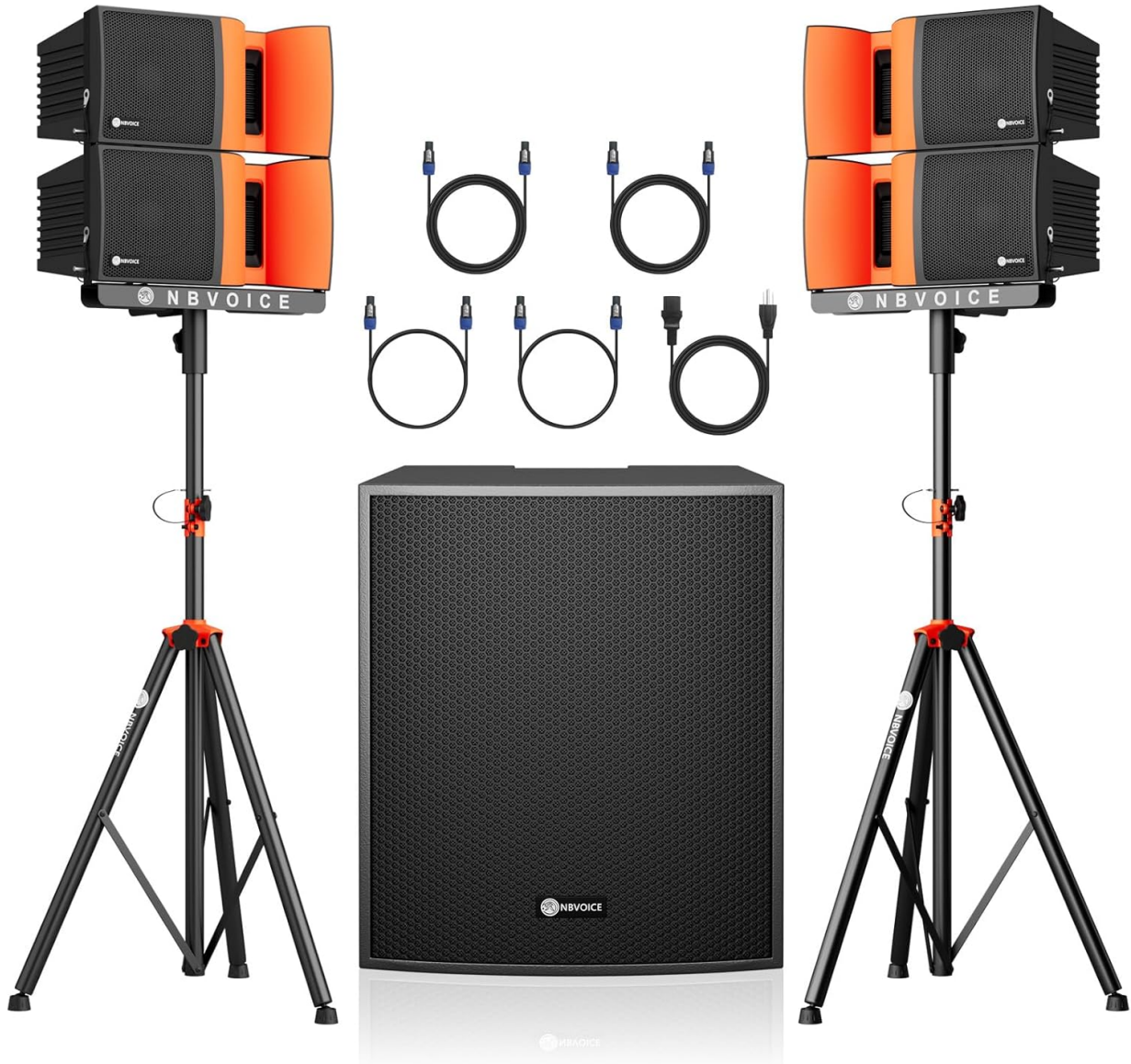
Figure 3.1: An overview of the NBVOICE NBVXA218 PA system, showcasing the active subwoofer, four line array speakers, and two adjustable tripods.