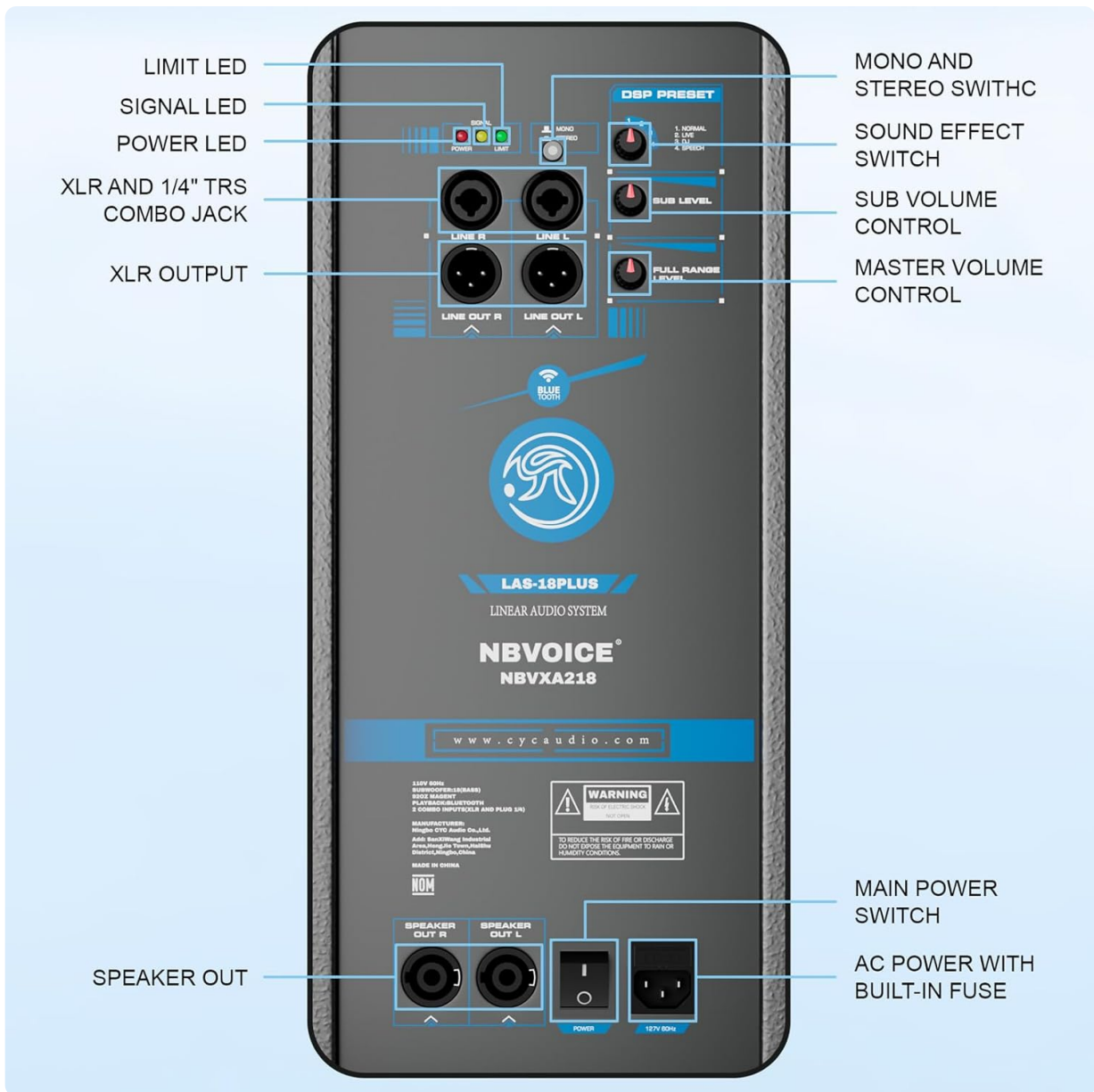
Figure 6.2: The rear panel of the subwoofer includes XLR and 1/4" TRS combo jacks for line inputs, XLR outputs, a mono/stereo switch, DSP preset selector, subwoofer level control, full range level control, main power switch, and AC power input with built-in fuse.