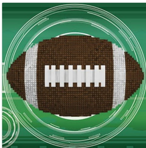
Image 4: Front view of the completed football model, showcasing the intricate detail of the micro-blocks.