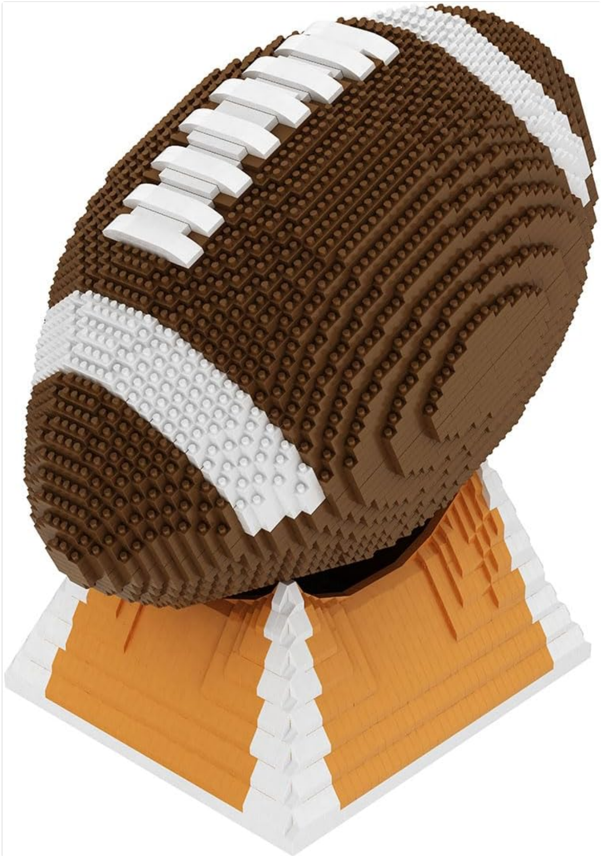
Image 5: The complete BDYDT American Football Micro Building Blocks Set, ready for display.