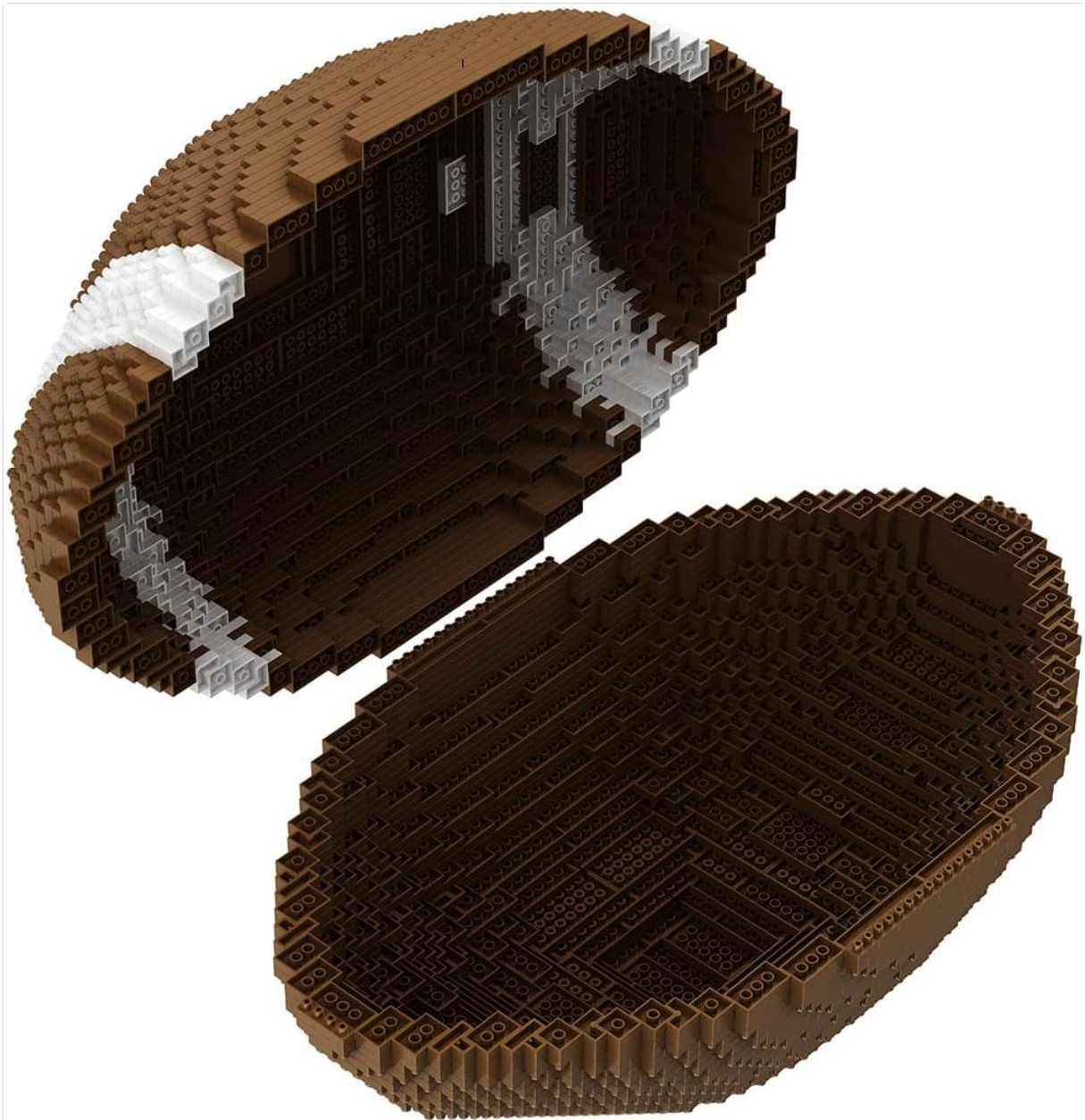
Image 3: Exploded view of the football, illustrating the two main sections that will be assembled separately and then combined.