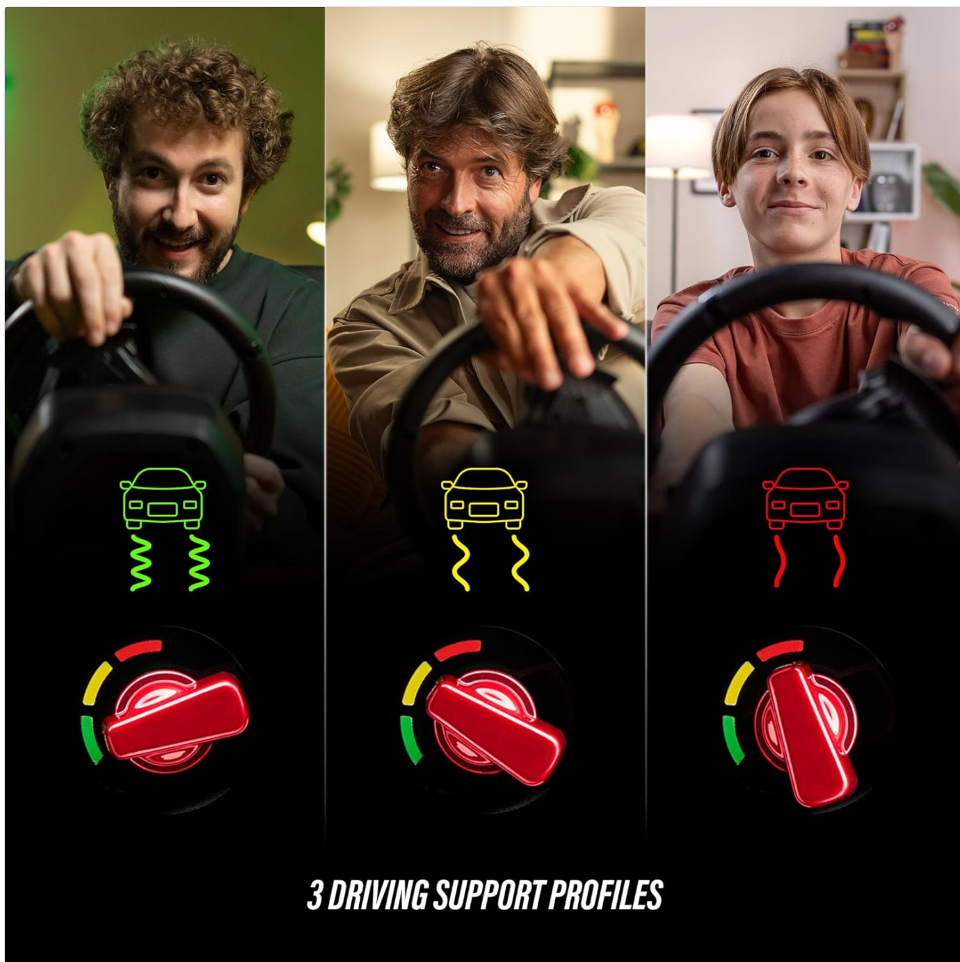
The Manettino dial on the racing wheel, illustrating the three selectable driving support profiles.