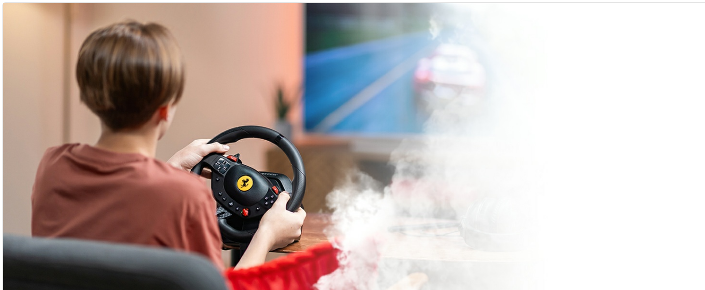
Image showing the racing wheel, pedal set, and clamping system.