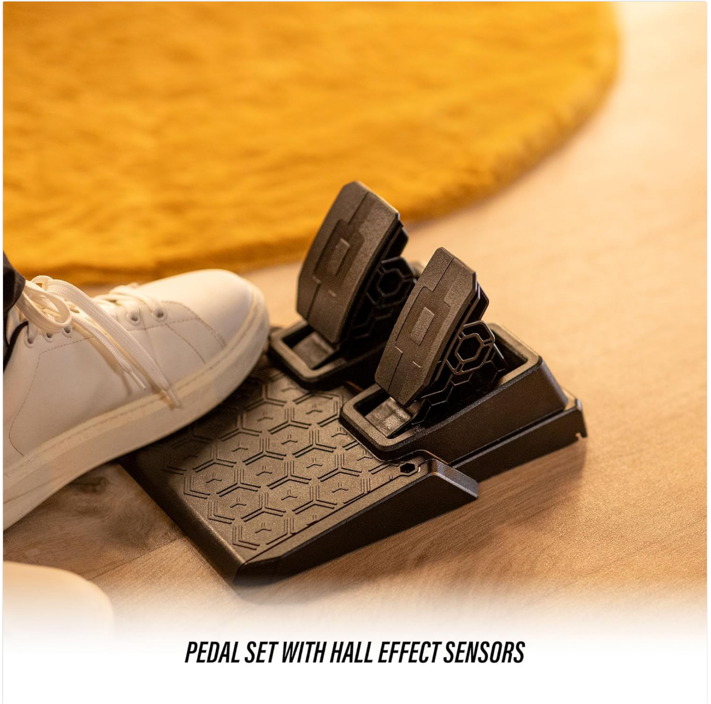
PEDAL SET WITH HALL EFFECT SENSORS

The racing wheel can be easily attached to a desk or table using the integrated clamping system. Ensure the surface is stable and the clamp is securely tightened for optimal performance.