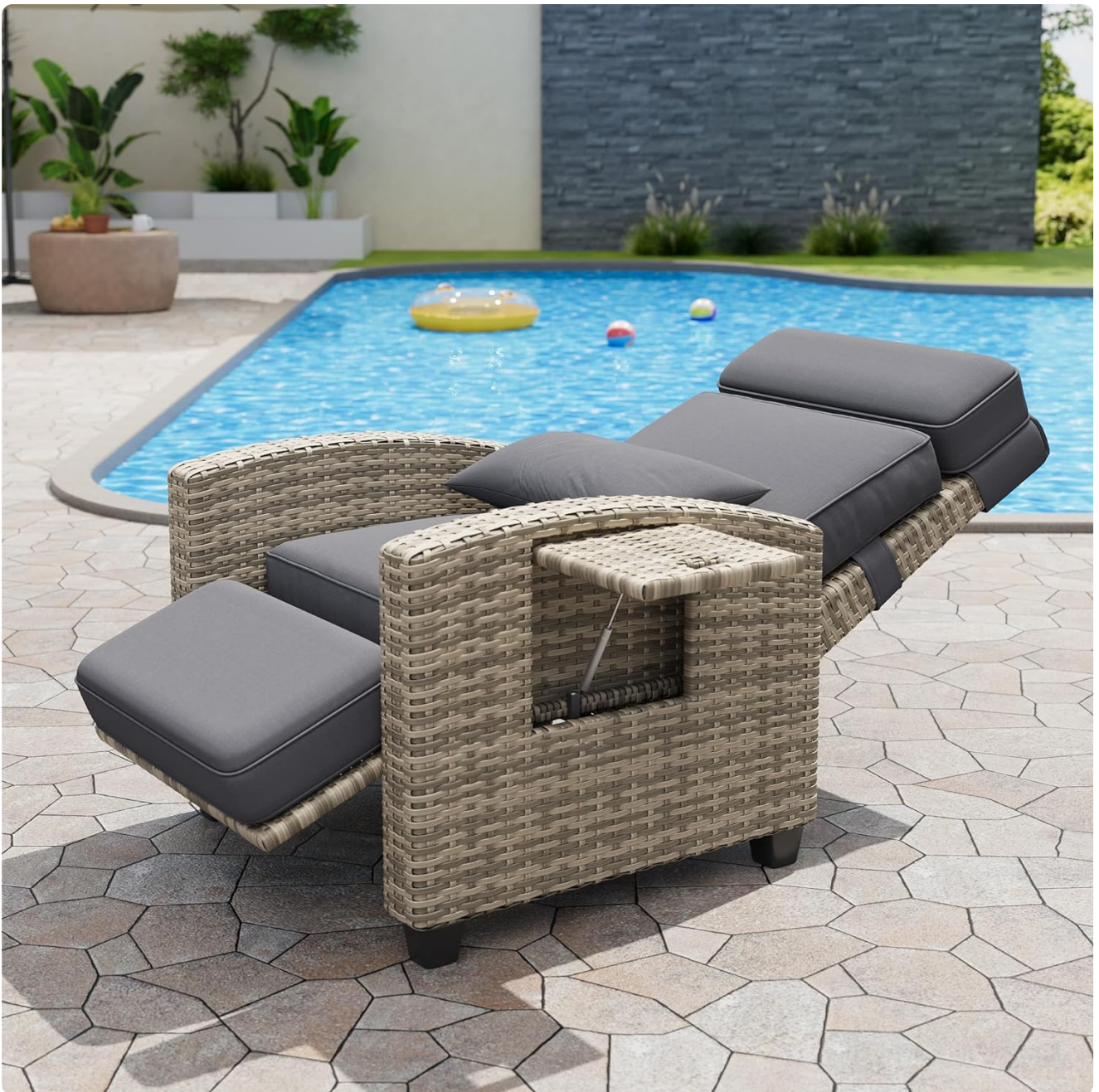
Image 5.1: Chair in reclined position with flip-up table extended.