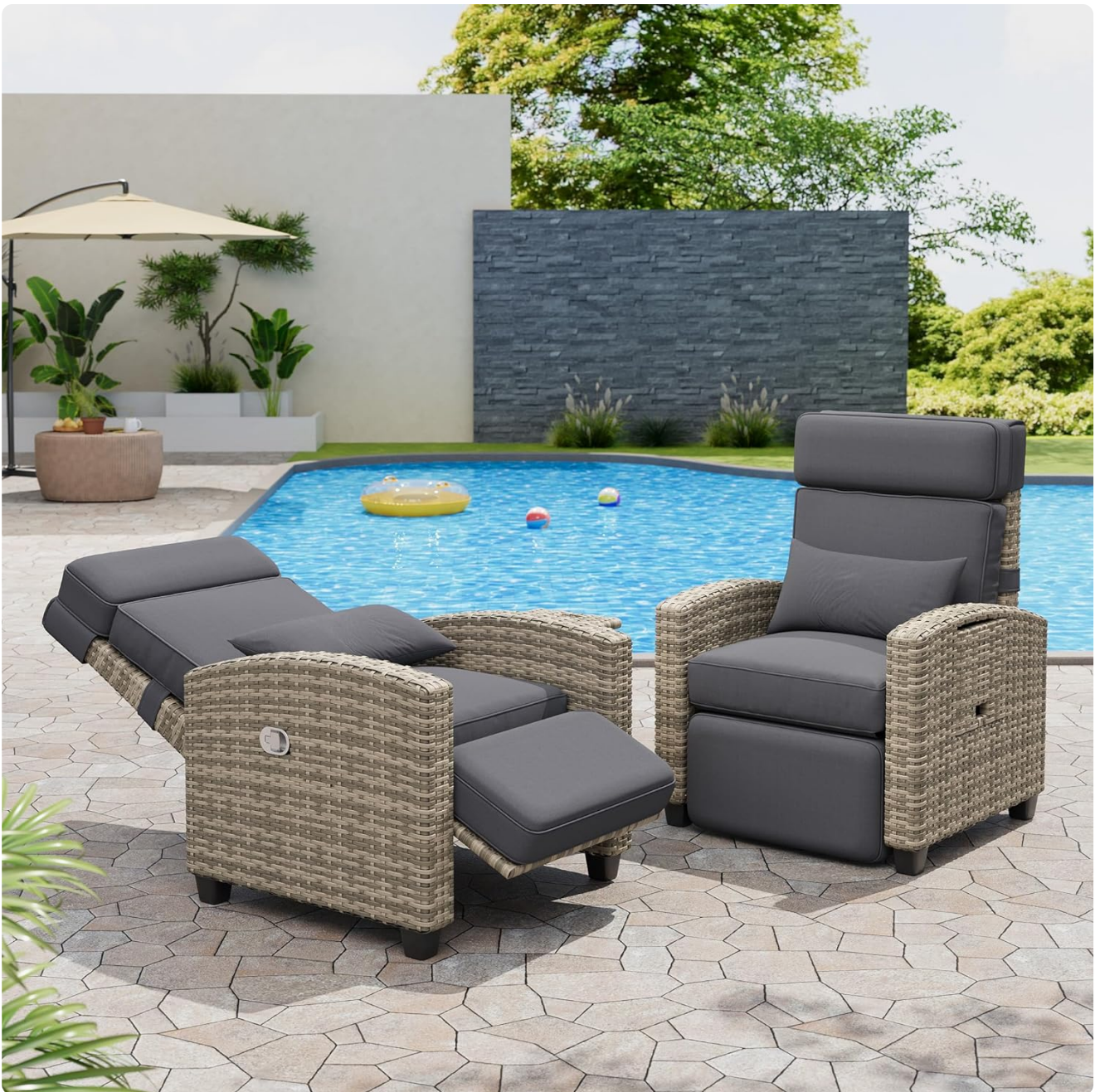
Image 1.1: GAOMON Outdoor Recliner Chair in upright and reclined positions.