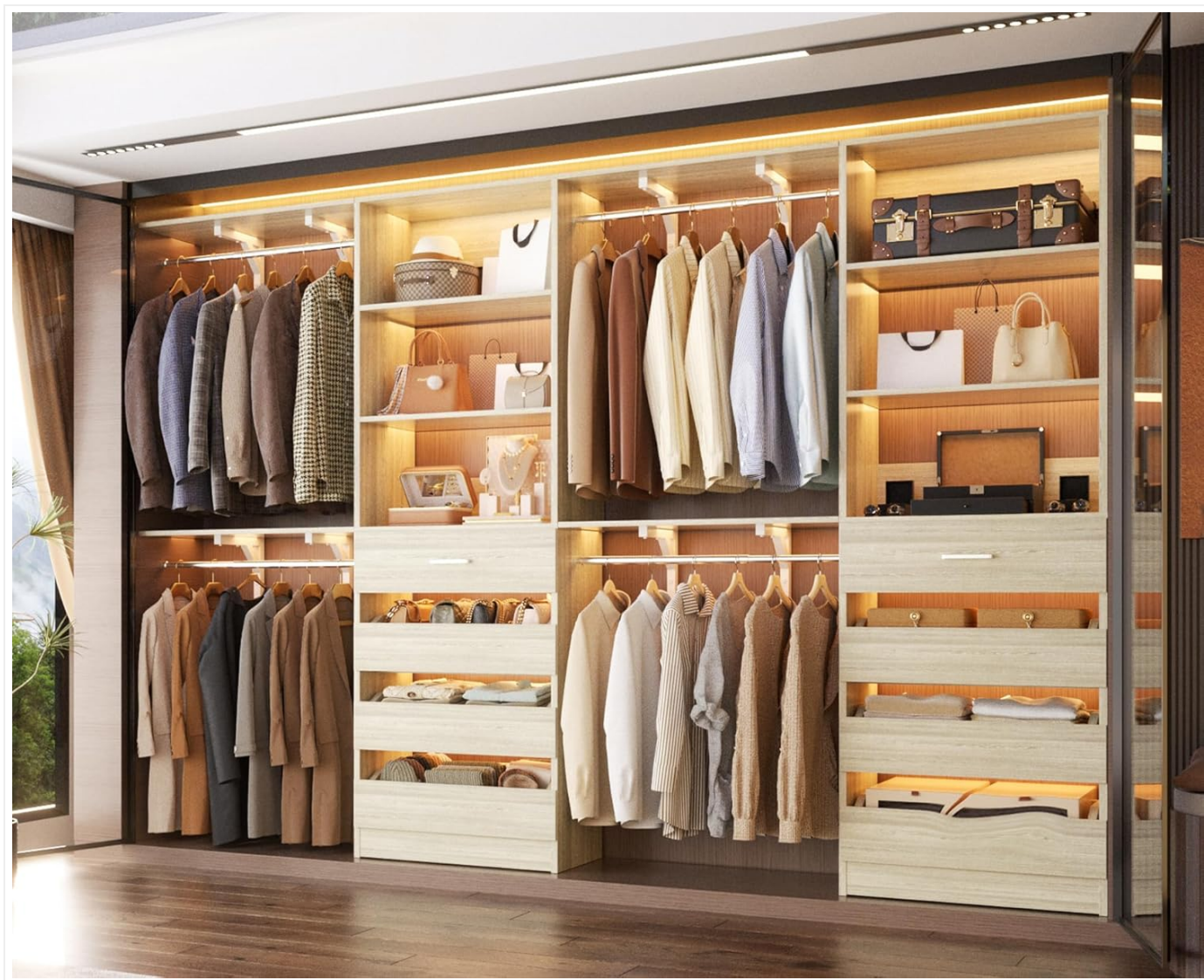
Figure 1: Overview of the Aheaplus YHCC-20A Closet System.