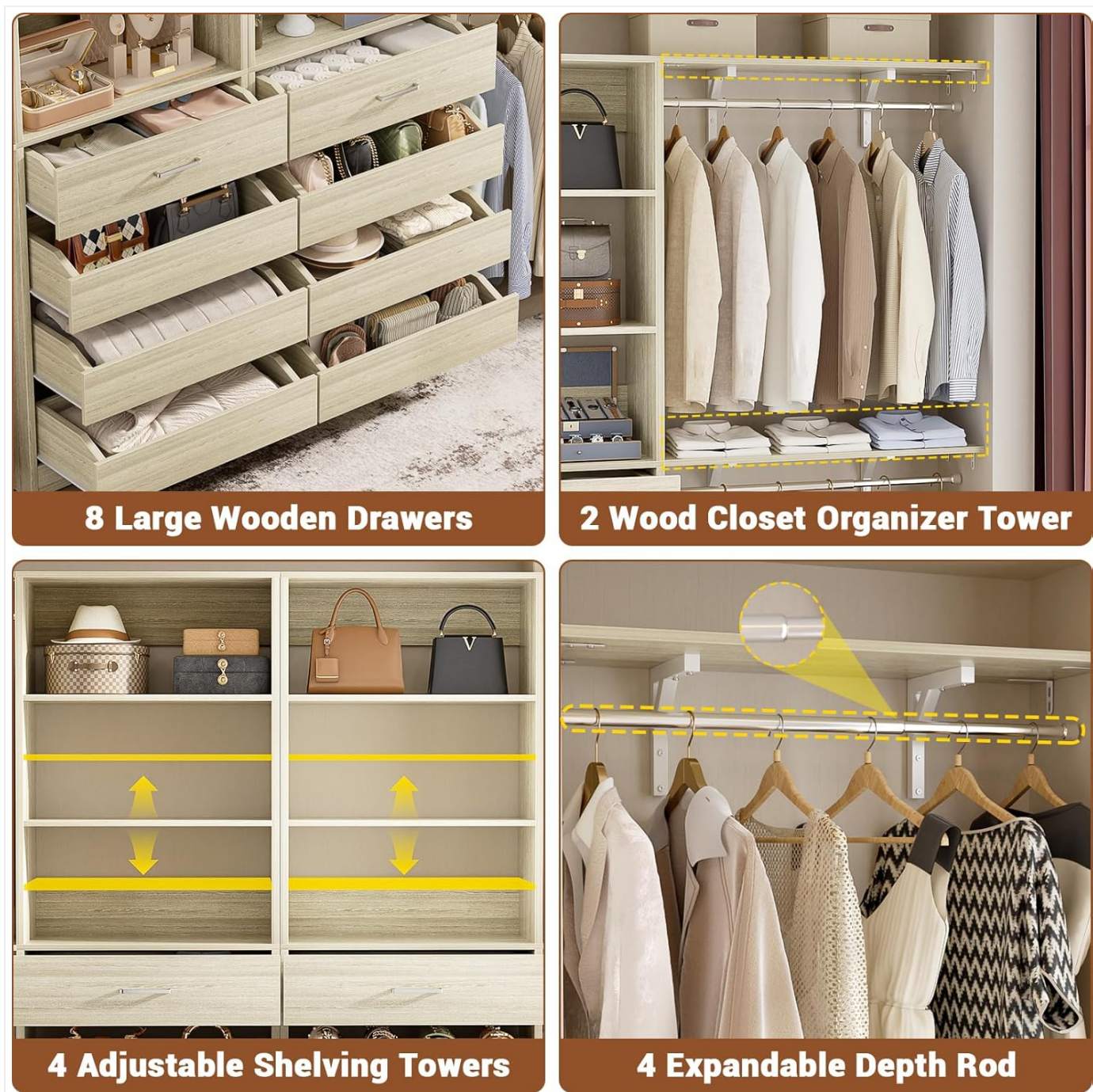
Figure 3: Detailed view of key components: drawers, towers, adjustable shelves, and expandable rods.