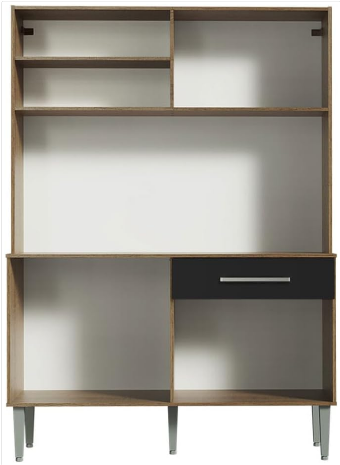
Image 3.2: Internal view of the Madesa Life Compact Kitchen Cabinet without doors. This image highlights the shelving and compartment layout, useful for understanding the assembly of the main structure.