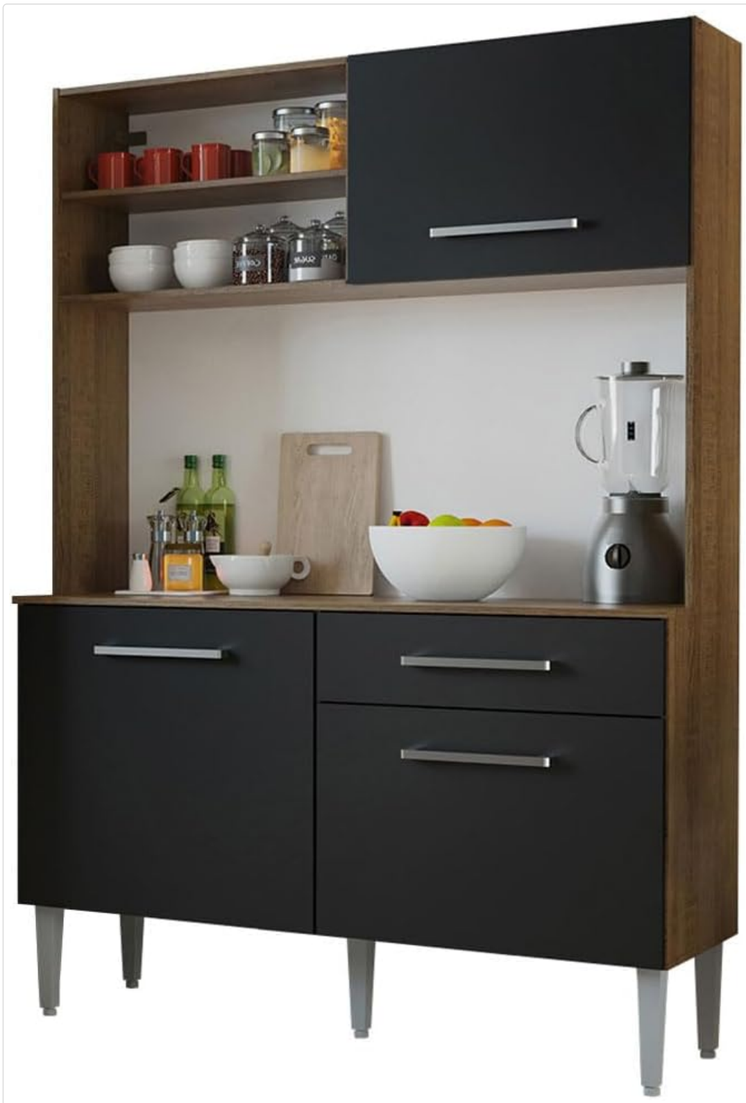
Image 4.2: Madesa Life Compact Kitchen Cabinet integrated into a kitchen environment. This perspective shows the cabinet's overall appearance and how it fits within a typical kitchen layout.