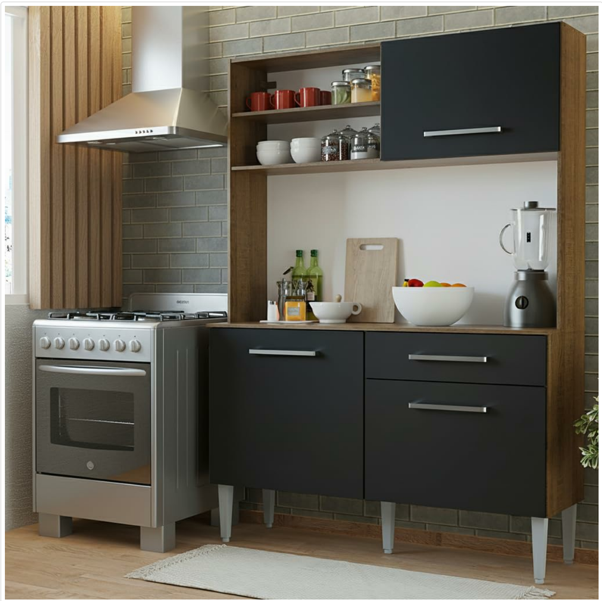
Image 1.1: Assembled Madesa Life Compact Kitchen Cabinet 120cm. This image shows the complete cabinet with its brown and black finish, featuring upper and lower storage compartments.