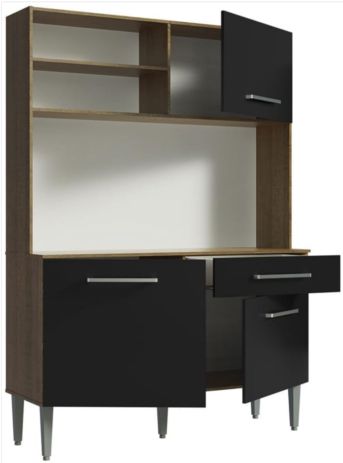
Image 3.3: Madesa Life Compact Kitchen Cabinet with doors and drawers open. This view demonstrates the functionality of the storage compartments and the chrome and aluminum finish handles.