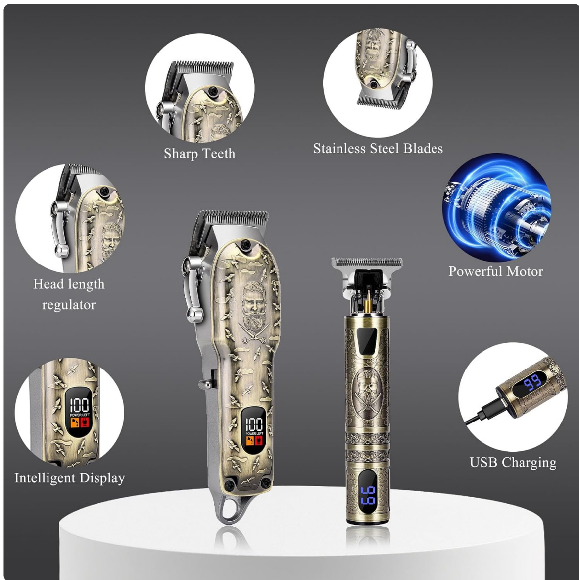
Image: Overview of the LQT Hair Clipper and Trimmer Set components, including the main clipper, detail trimmer, guide combs, charging cables, and cleaning tools.

Your browser does not support the video tag.