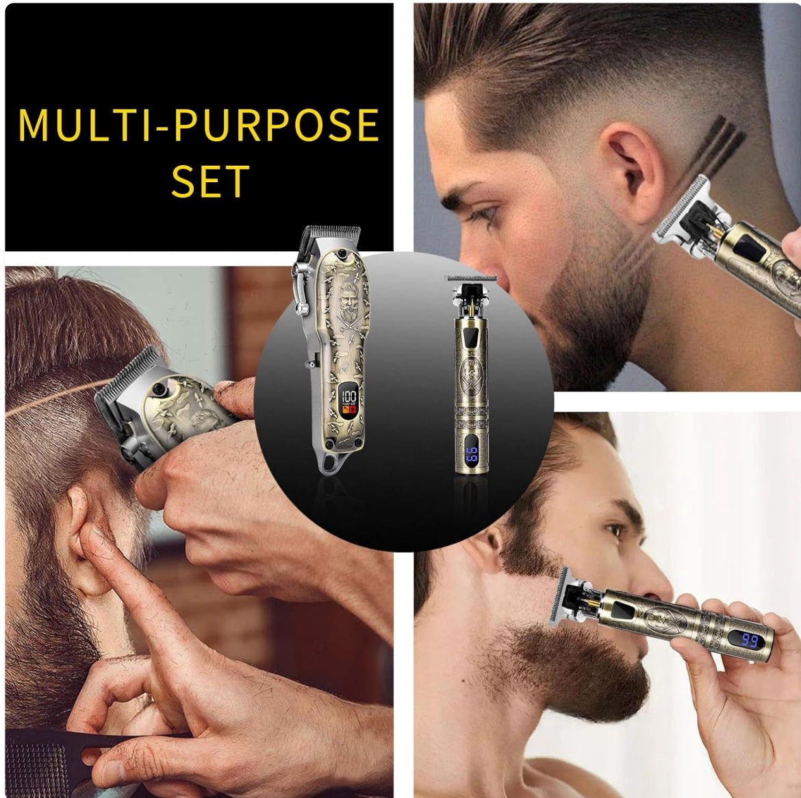
Image: Demonstrates the multi-purpose functionality of the LQT set, showing the main clipper used for haircuts and the detail trimmer for beard shaping and body hair removal.