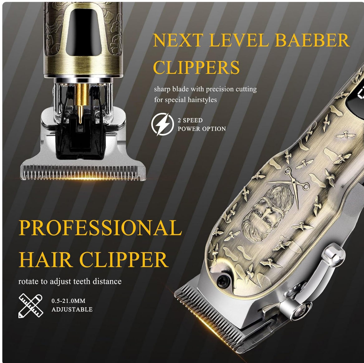
Image: Close-up view of the main hair clipper, highlighting its digital power display and the adjustable blade lever for precise cutting lengths.