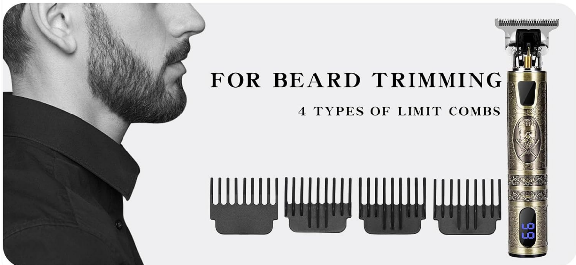
Image: The main hair clipper and detail trimmer displayed with their respective sets of guide combs, illustrating how to select and attach them for different cutting lengths.