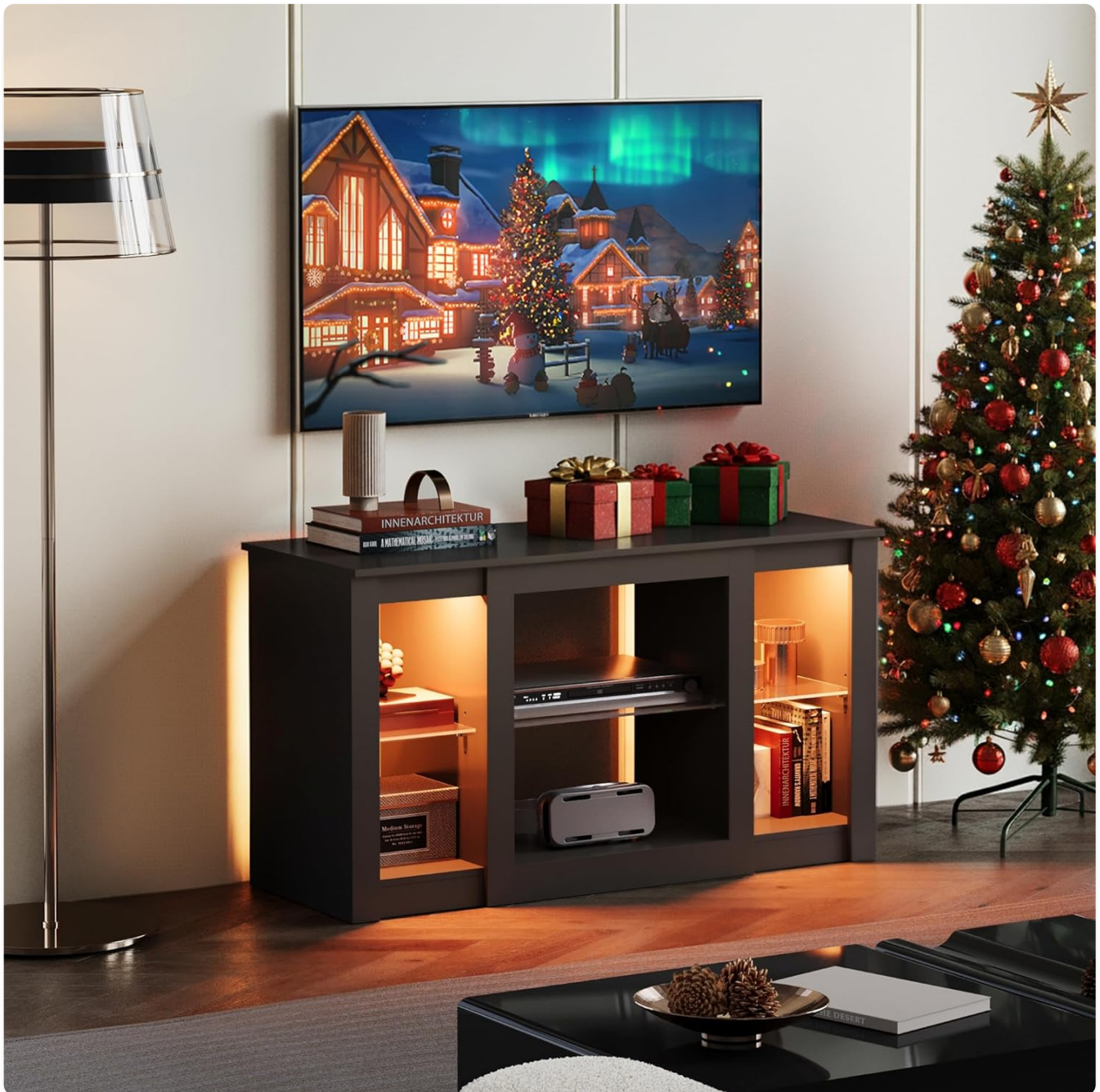
Image: The WLIVE TV Stand, Model ADSG064BL, showcasing its design with integrated LED lighting and storage compartments.