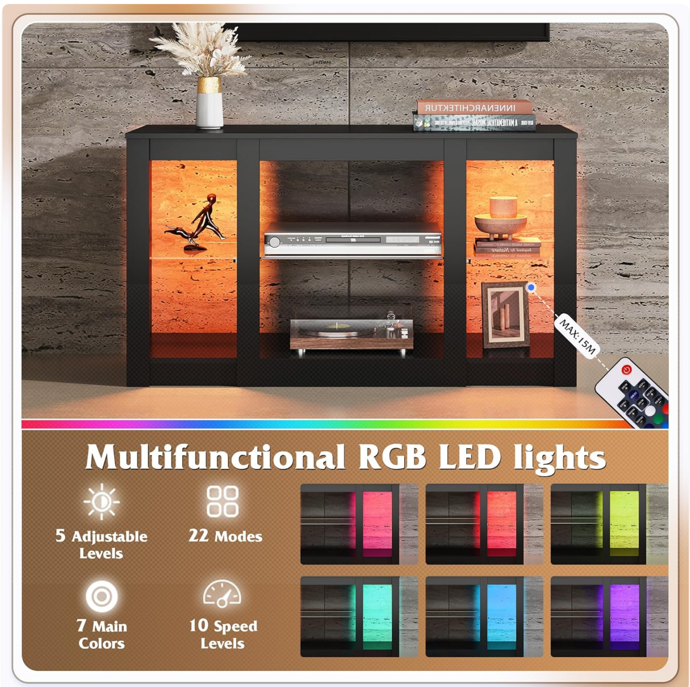
Image: The TV stand with its multifunctional RGB LED lights, illustrating 5 adjustable levels, 22 modes, 7 main colors, and 10 speed levels, controlled by a remote.