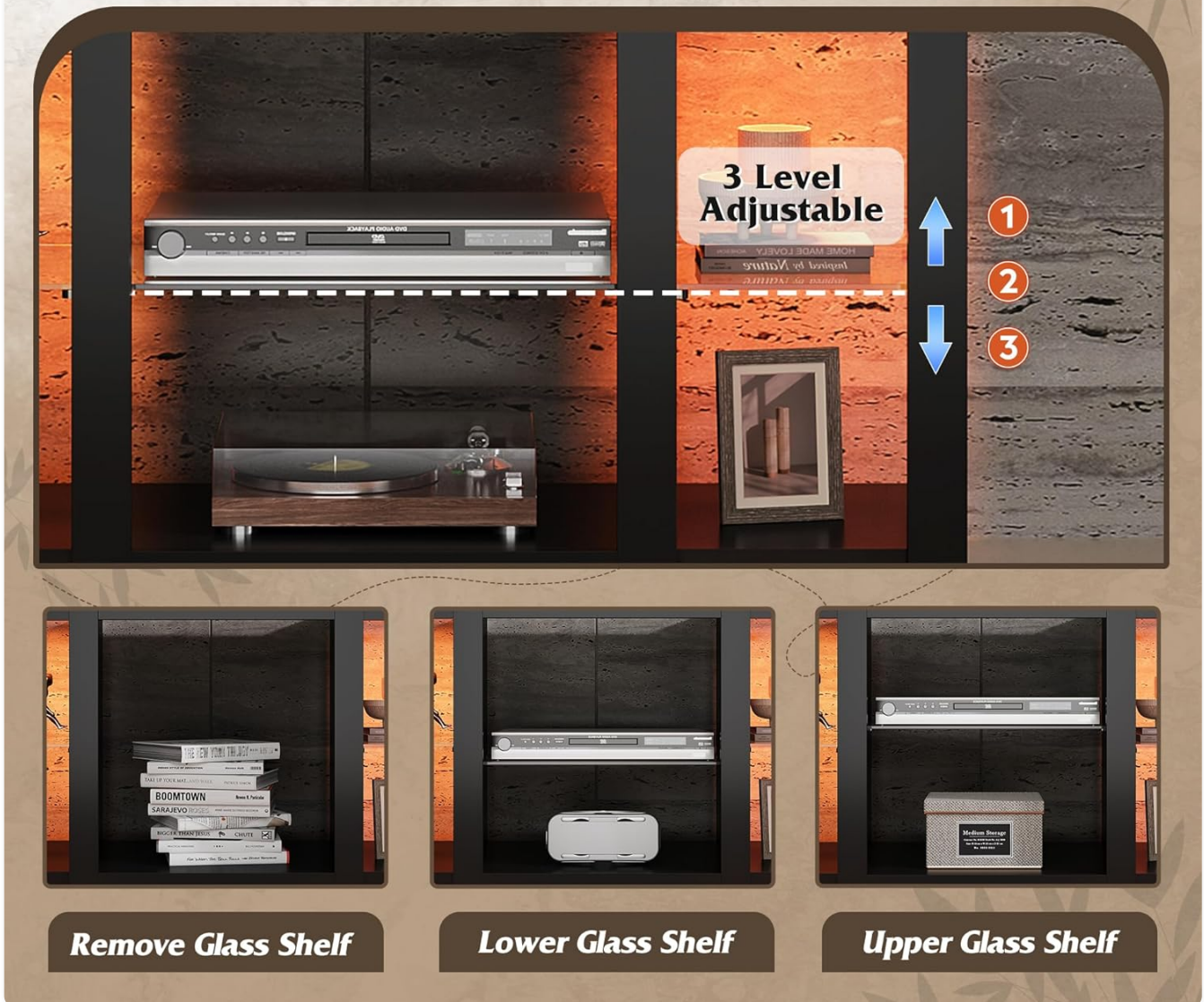
Image: Illustration demonstrating how to adjust or remove the tempered glass shelves, showing upper, lower, and removed positions.