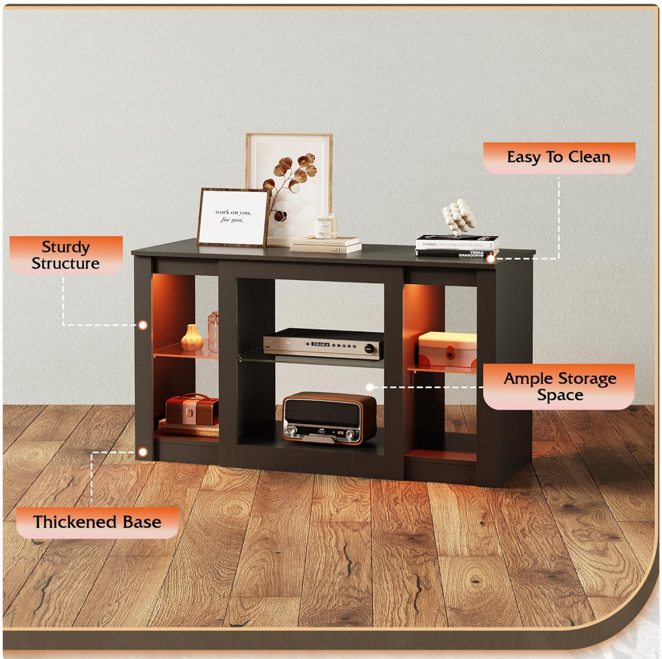
Image: Visual representation of the TV stand's sturdy structure, thickened base, and easy-to-clean surface.