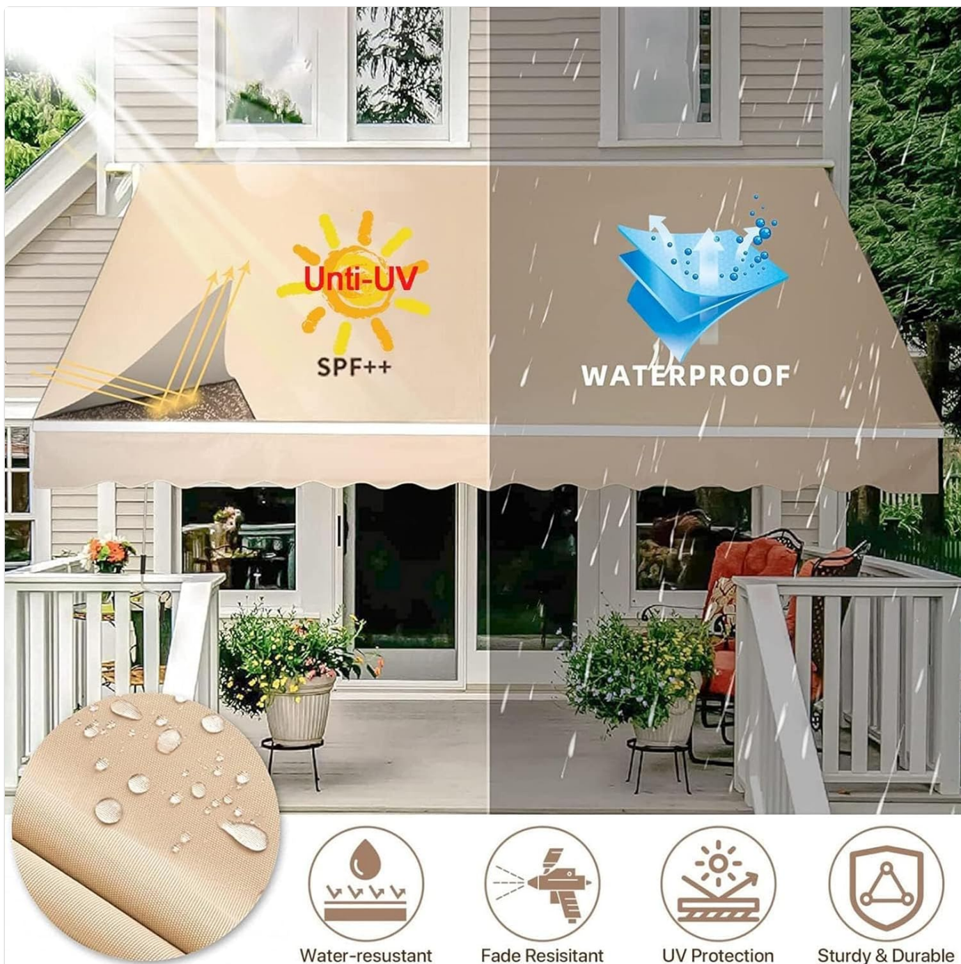
Image: A split image demonstrating the fabric's anti-UV and waterproof properties. The left side shows sun rays being blocked by the fabric, labeled "Anti-UV SPF++". The right side shows water droplets beading on the fabric, labeled "WATERPROOF". Below are icons for water-resistant, fade resistant, UV protection, and sturdy & durable. This highlights the key protective features of the fabric.