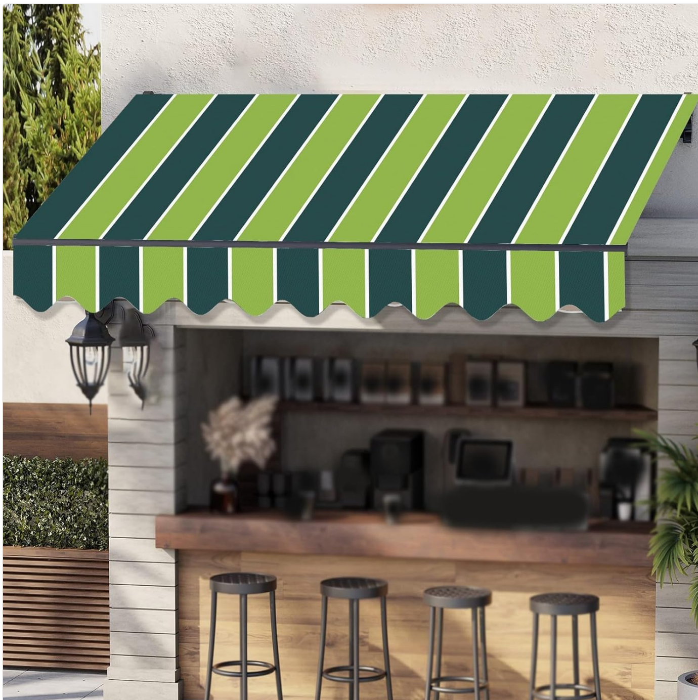
Image: Awning Replacement Fabric in light-green stripes, installed on a building, providing shade over an outdoor bar area. This image illustrates the product in its intended use environment.