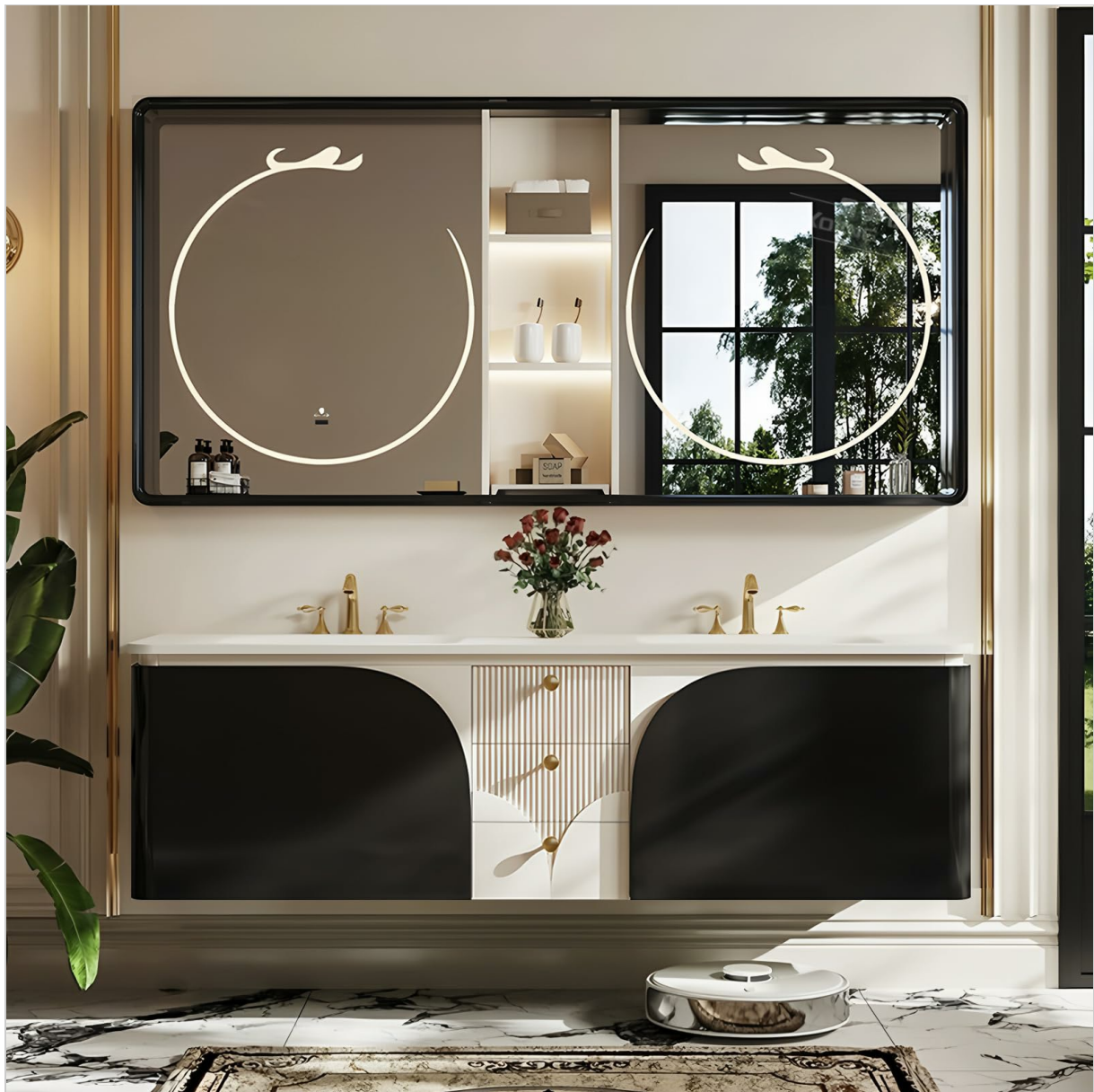
Figure 1.1: LUTHXAY 60-Inch Double Sink Bathroom Vanity Set.