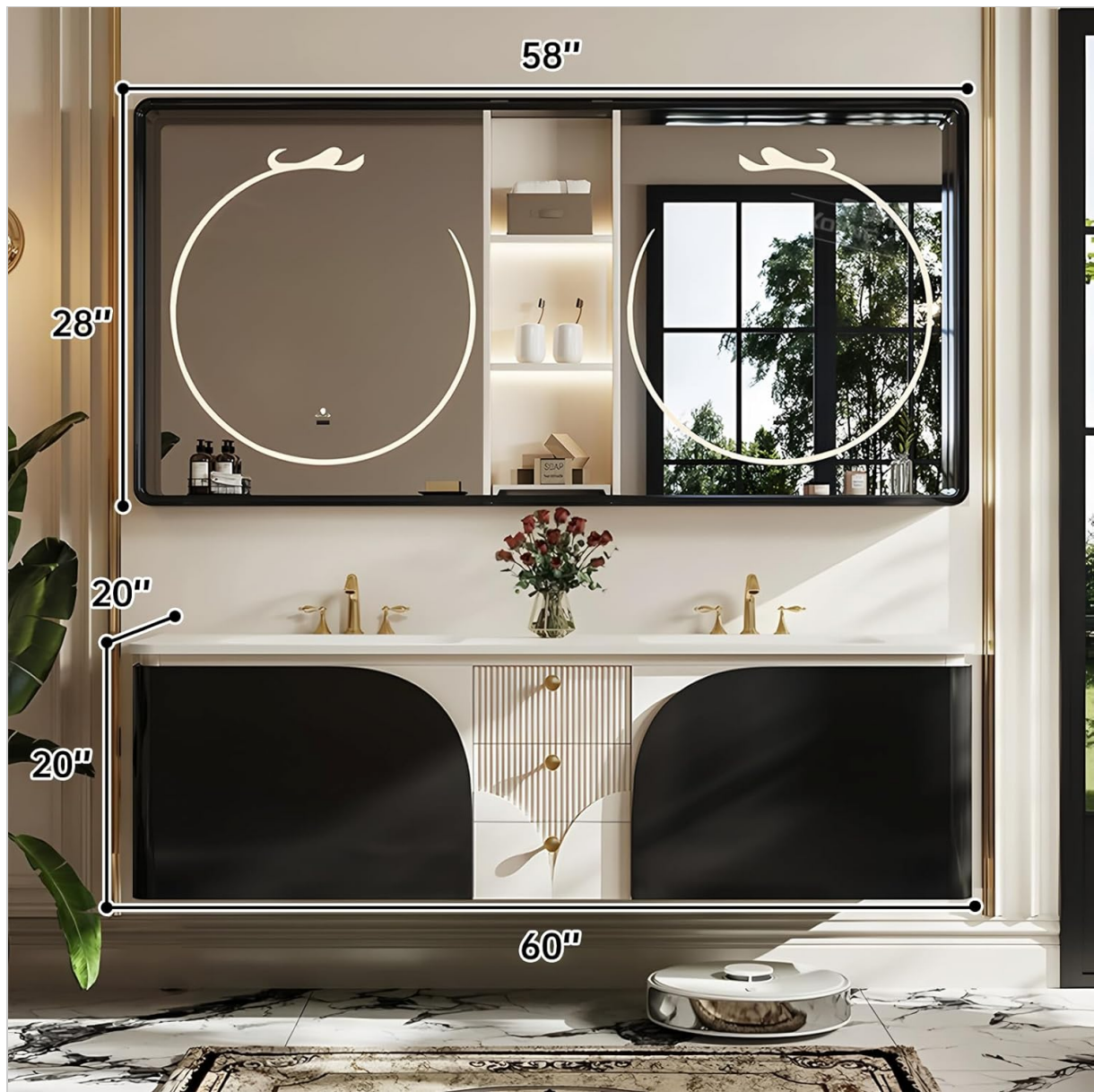
Figure 4.1: Product dimensions for planning installation space.