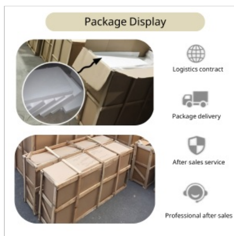
Figure 3.1: Example of package display, showing multiple boxes for safe delivery.