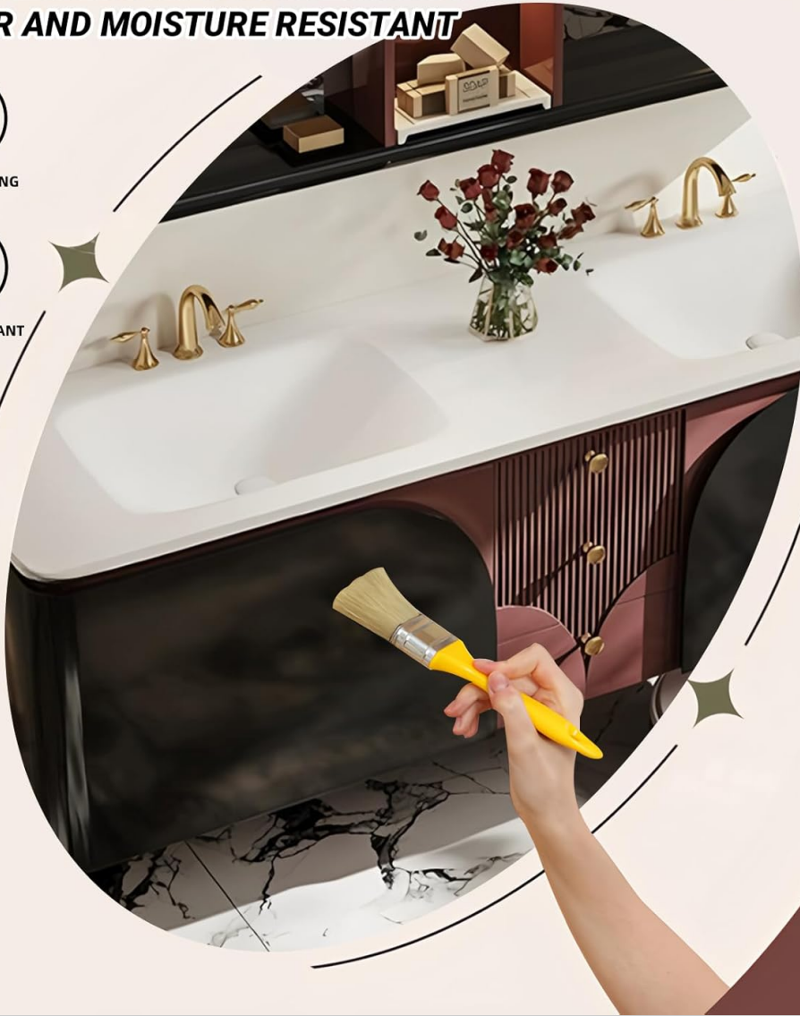
Figure 6.1: Multi-layer paint protection sheet for water and moisture resistance, ensuring easy cleaning and stain resistance.