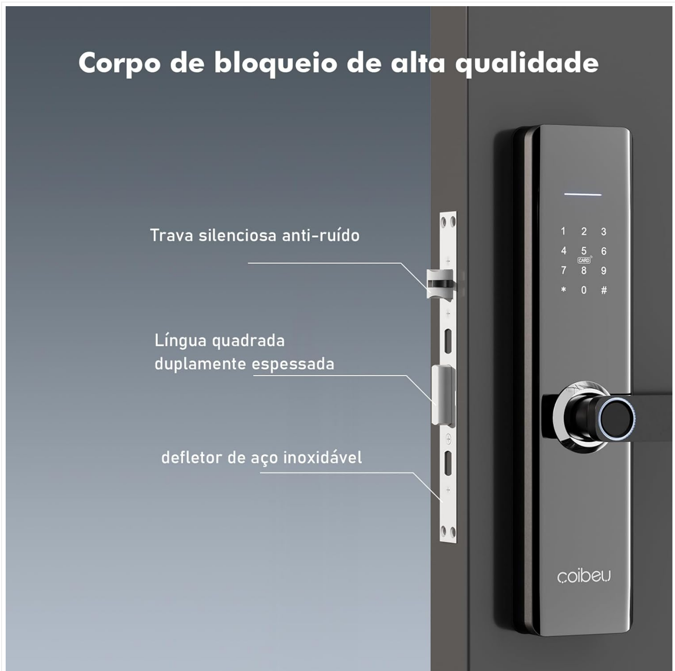
Figure 4.2: High-quality lock body components and internal mechanism.