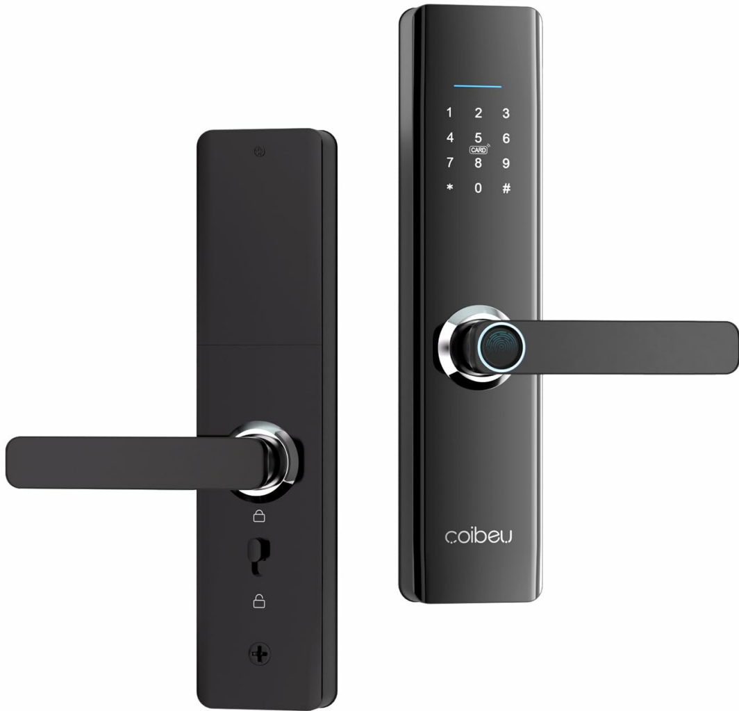
Figure 8.1: Product dimensions and key specifications.