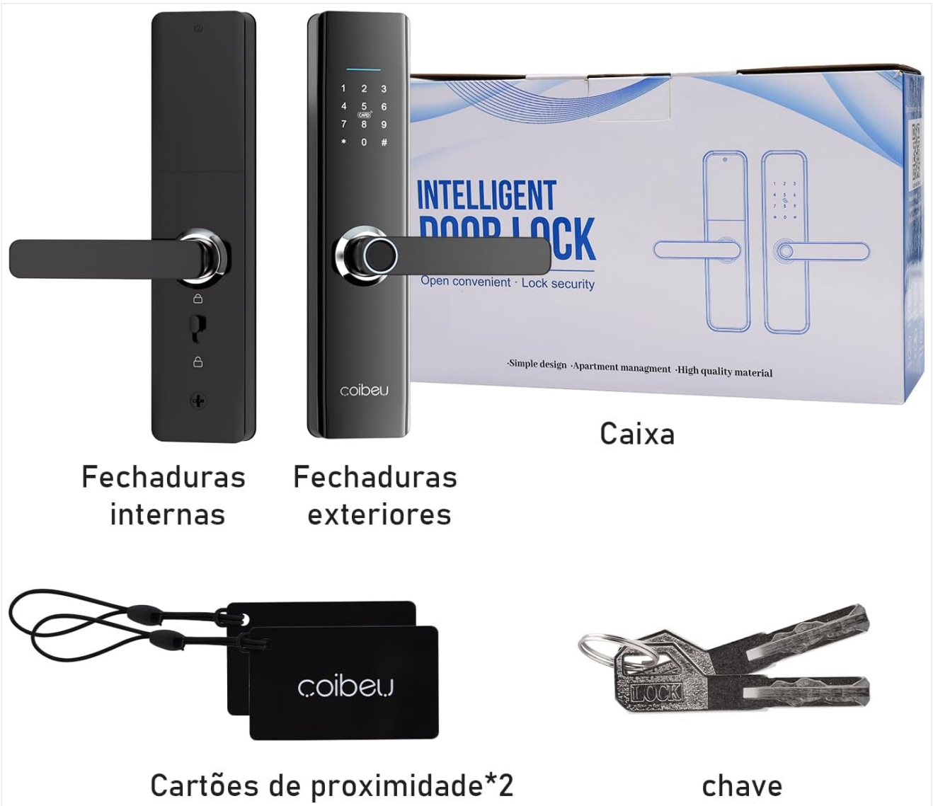
Figure 3.1: Overview of included components: internal and external lock units, proximity cards, mechanical keys, and packaging.