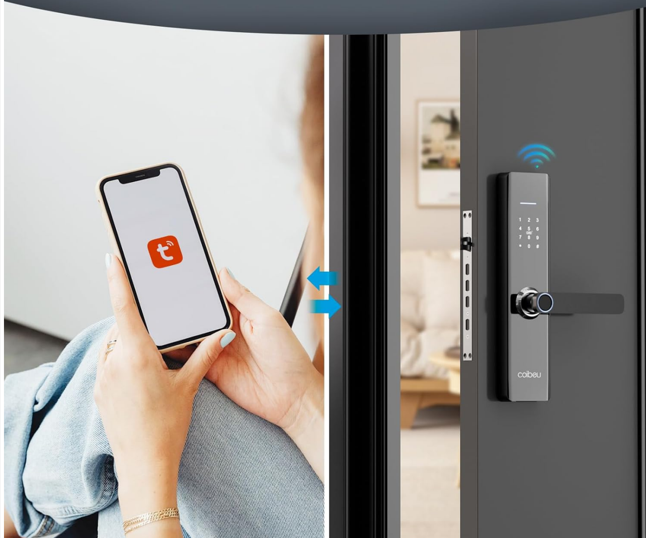
Figure 5.3: Remote unlocking using the Tuya Smart App.

Use o Tuya Smart App para controlar facilmente a fechadura inteligente de sua porta a qualquer hora e em qualquer lugar