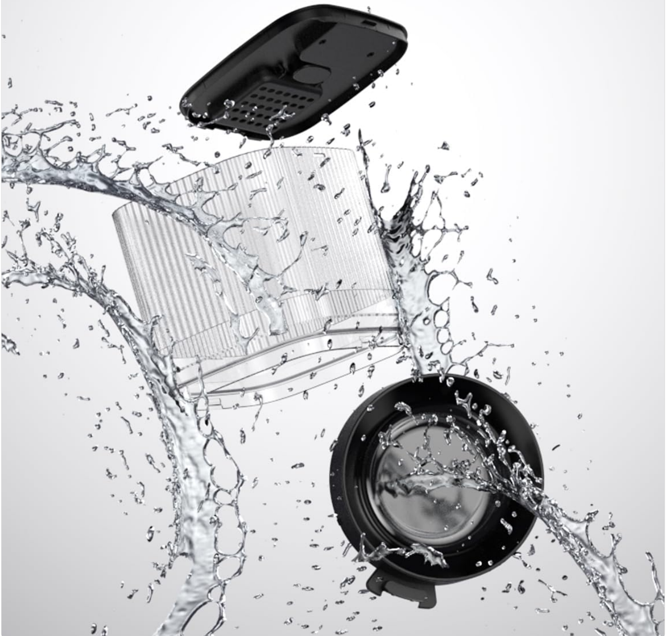
Figure 3: Detachable Components for Easy Cleaning