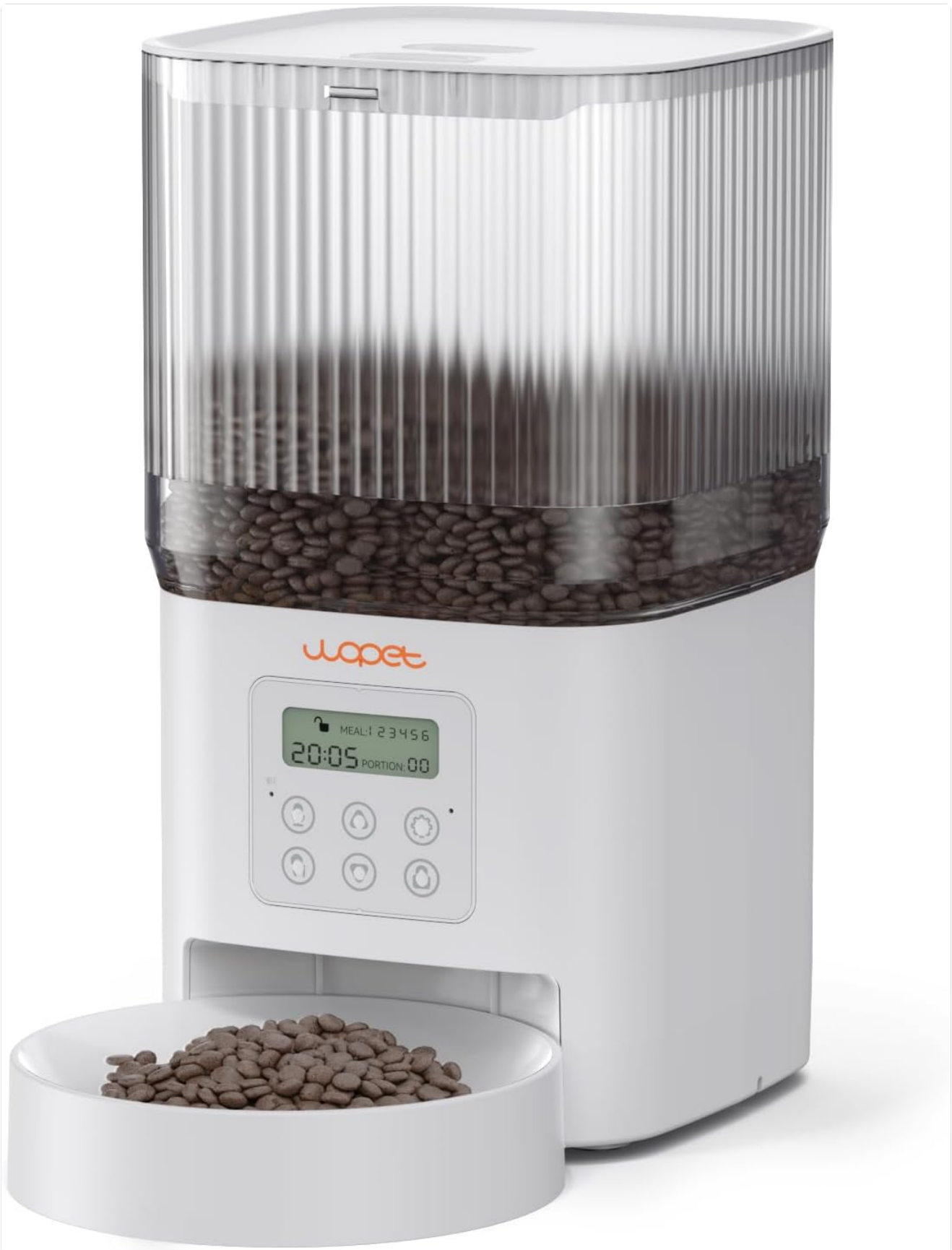
Figure 1: WOPET Automatic Pet Feeder (Model CL11)