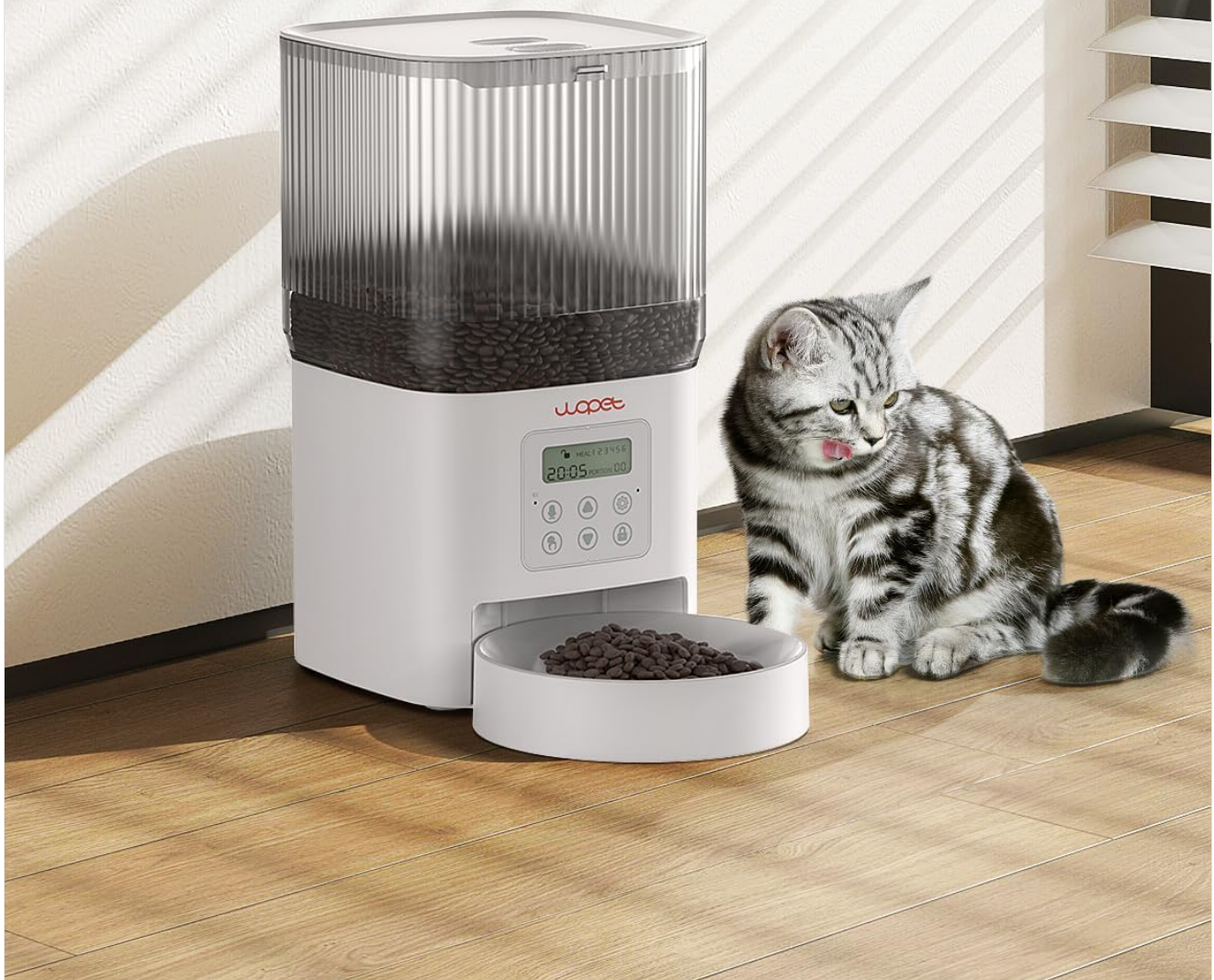
Figure 5: Control Panel and Feeding Schedule Display