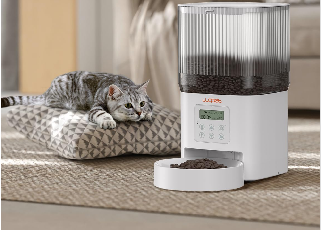
Figure 2: Voice Recording Feature