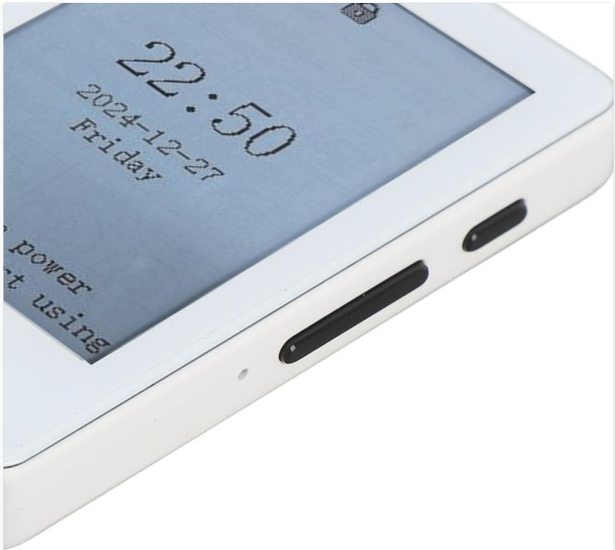
Side view of the device highlighting the power and volume buttons for control.