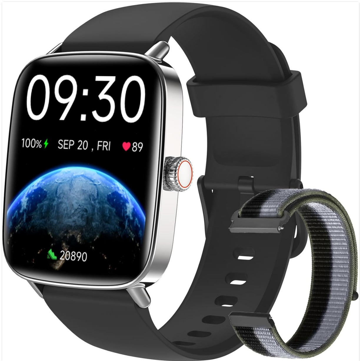
Image: The Fitpolo IDW28 Smart Watch with its charging cable, illustrating the charging process.