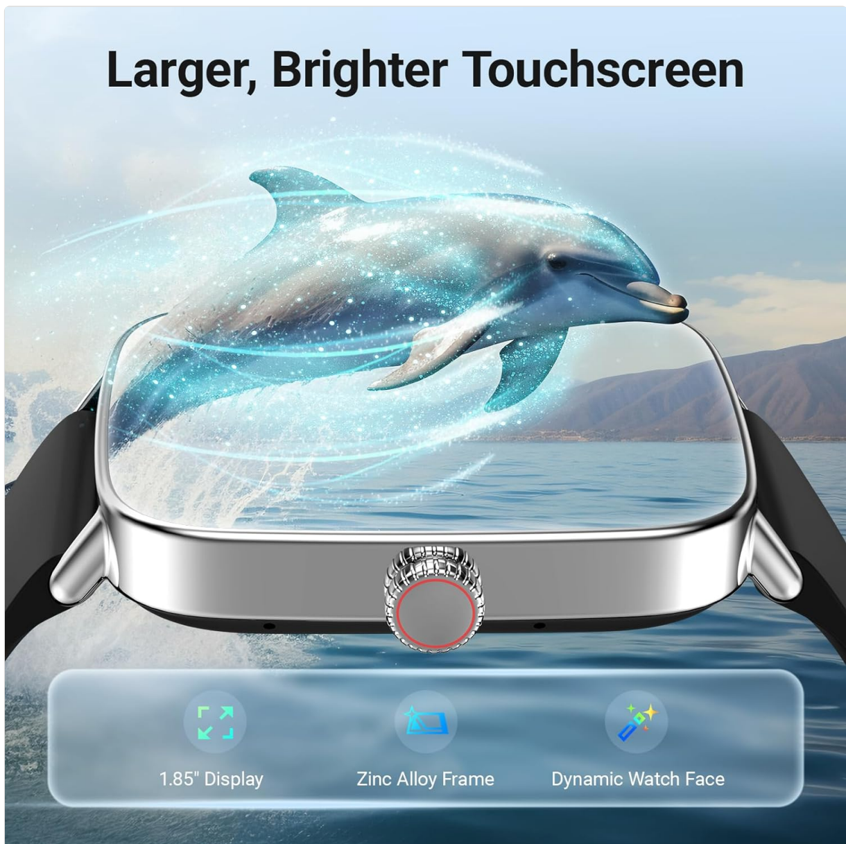
Image: The Fitpolo IDW28 Smart Watch displaying time, date, battery, heart rate, and step count on its bright touchscreen.

The Fitpolo IDW28 Smart Watch features a 1.85-inch full-touch HD screen. Swipe across the screen to navigate through menus and functions. Press the side button to return to the home screen or access the app list.