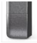
Figure 2.4: Side view of the Lenovo Tab M9 TB310XU tablet, showing the USB-C port and speaker grille.