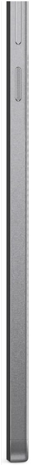
Figure 2.3: Side view of the Lenovo Tab M9 TB310XU tablet, highlighting the power and volume buttons.