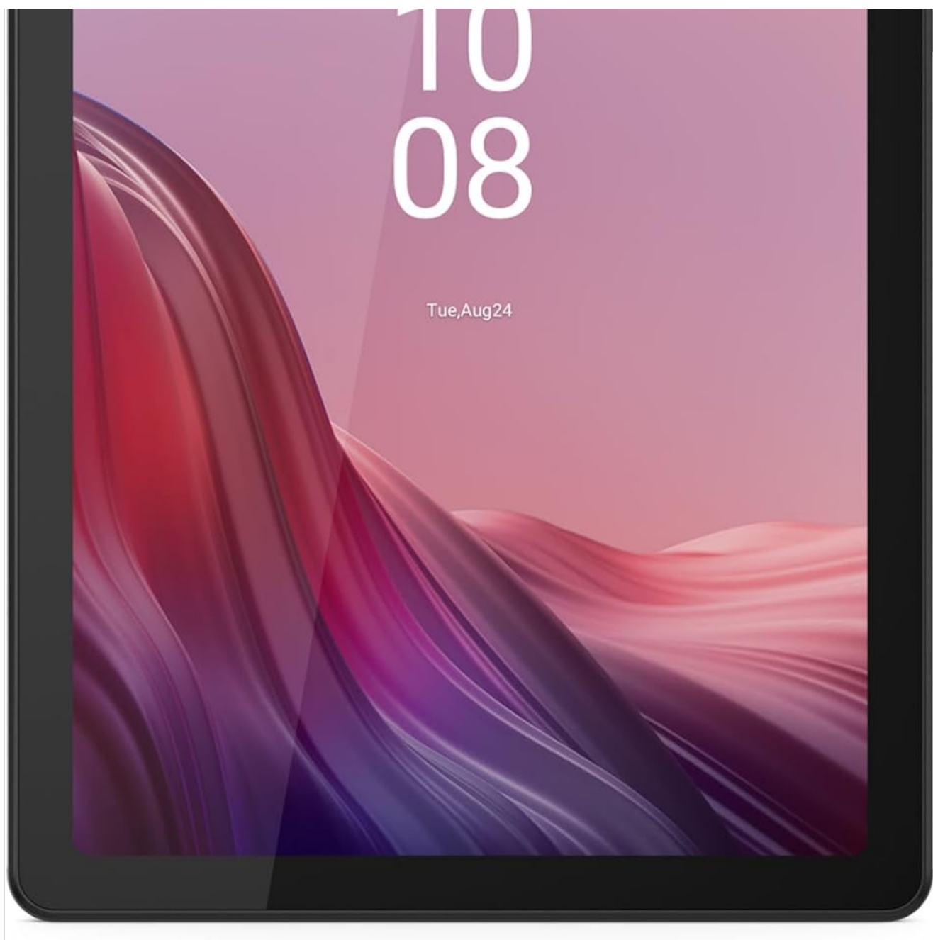
Figure 2.1: Front view of the Lenovo Tab M9 TB310XU tablet, displaying the screen and front camera.