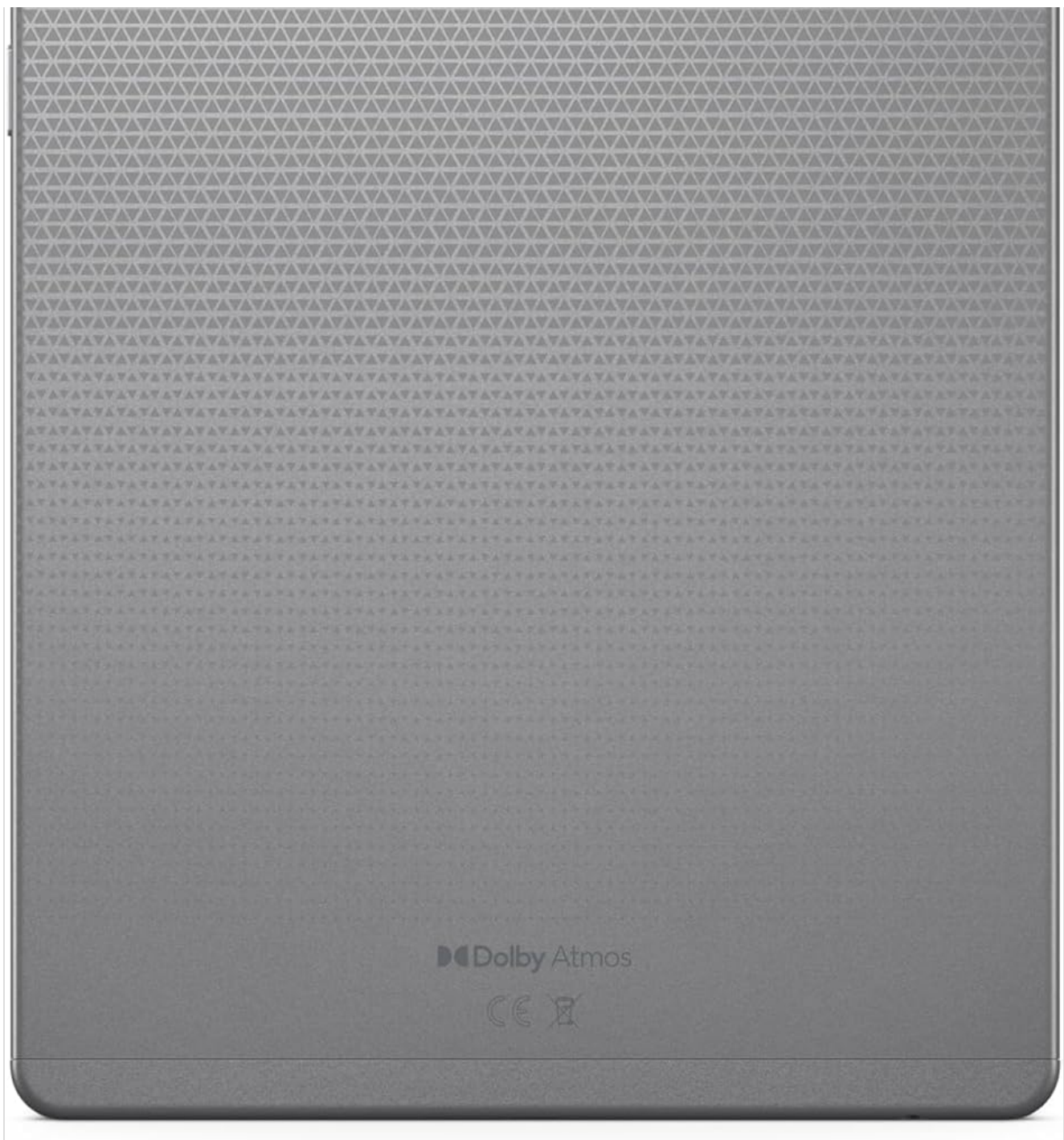
Figure 2.2: Rear view of the Lenovo Tab M9 TB310XU tablet, showing the main camera and Lenovo branding.