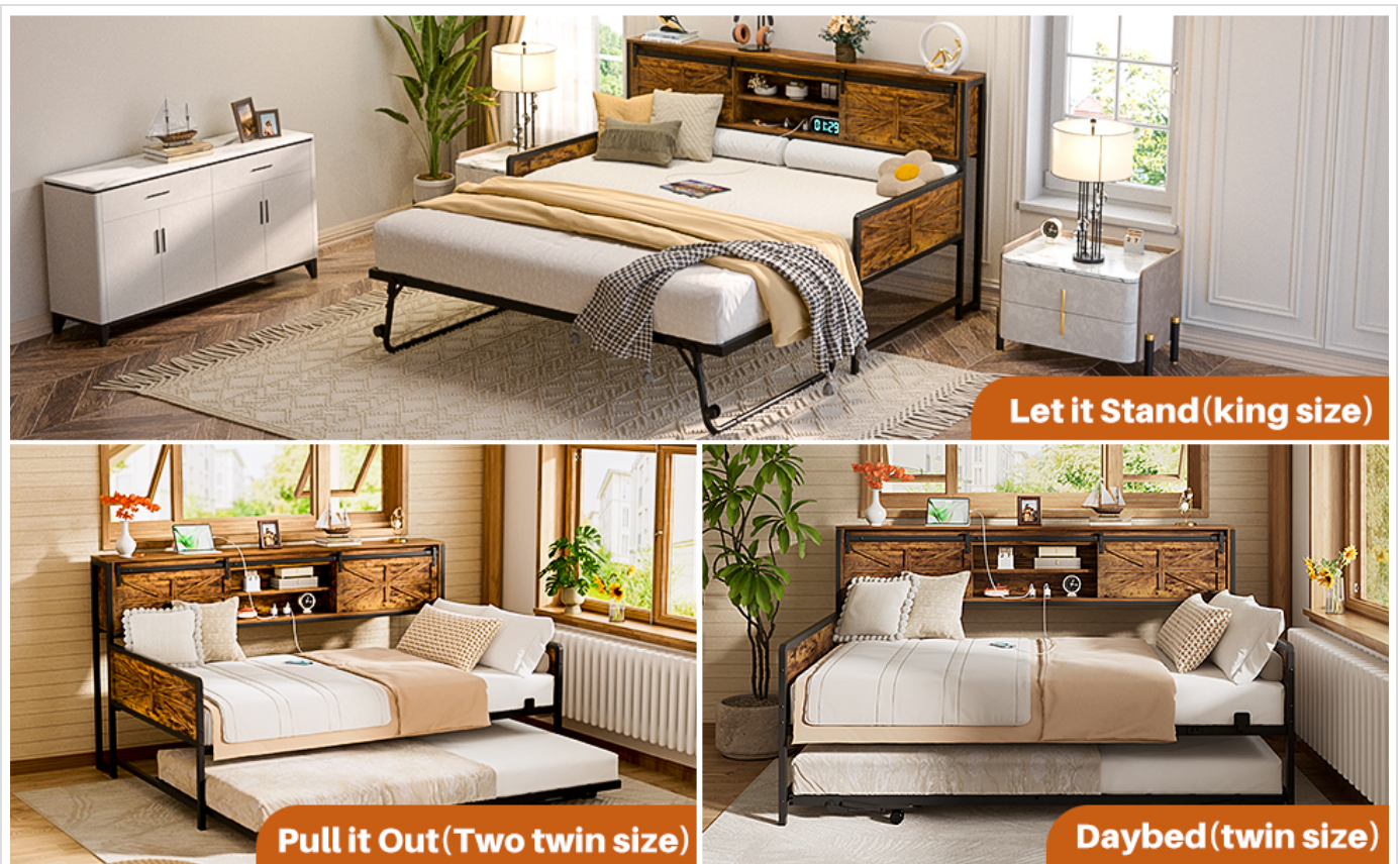
Image: Demonstrates the daybed's versatility, showing it configured as a king-size bed, two twin beds (with trundle pulled out), and a standard twin daybed.