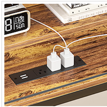
Image: Close-up of the integrated power outlet and USB ports within the headboard.