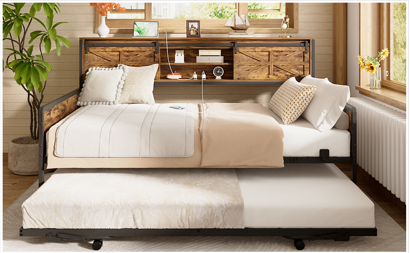
Image: Fully assembled Homieasy Daybed with Trundle, showcasing its design and functionality.