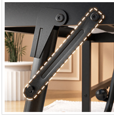
Image: Detail of a support bar for the trundle mechanism.

Image: Detail of an anti-slip pad for stability.