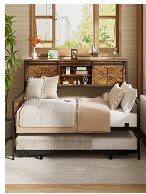
Image: Side view of the Homieasy Daybed with Trundle, highlighting its compact design.