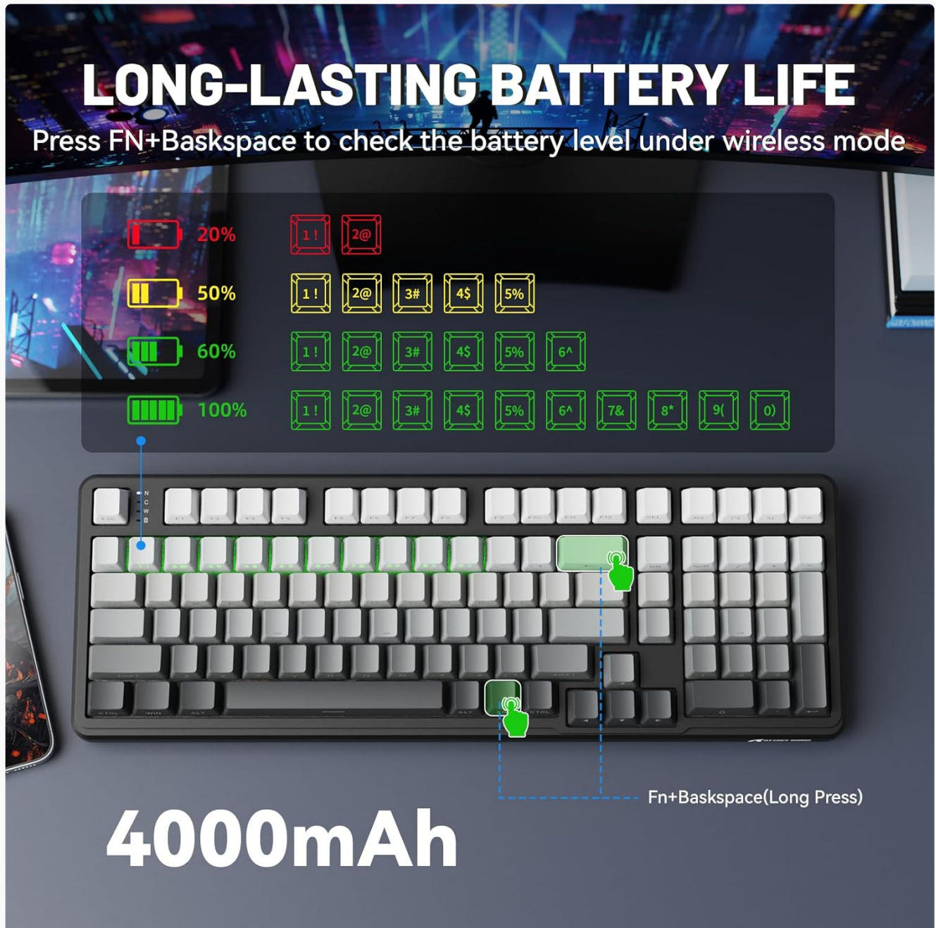
Image 4.2: Visual guide for checking the keyboard's battery level.

To check the current battery level in wireless mode, press and hold Fn + Backspace . The indicator lights on the keyboard will display the approximate battery percentage.