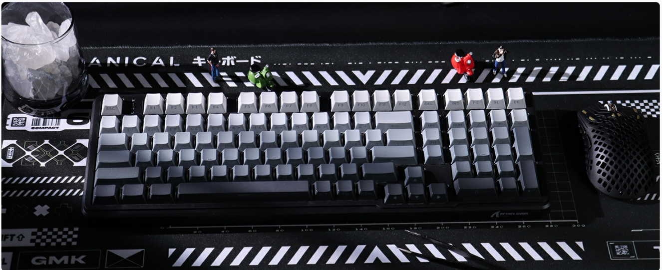
Image 1.1: Overview of the ATTACK SHARK X98 keyboard features, including its 102-key layout, 3/5 pin switch compatibility, triple connection modes, driver software, gasket structure, RGB backlighting, and 4000mAh battery.

The ATTACK SHARK X98 is a versatile wireless mechanical keyboard designed for various computing environments, including PC, tablet, PS5, and Xbox. It features a 98-key compact layout, gasket-mounted structure, hot-swappable switches, and RGB backlighting. This manual provides instructions for setup, operation, maintenance, and troubleshooting.