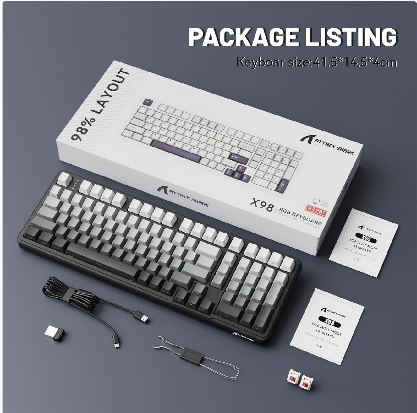
Image 2.1: The complete package contents for the ATTACK SHARK X98 keyboard, including accessories.