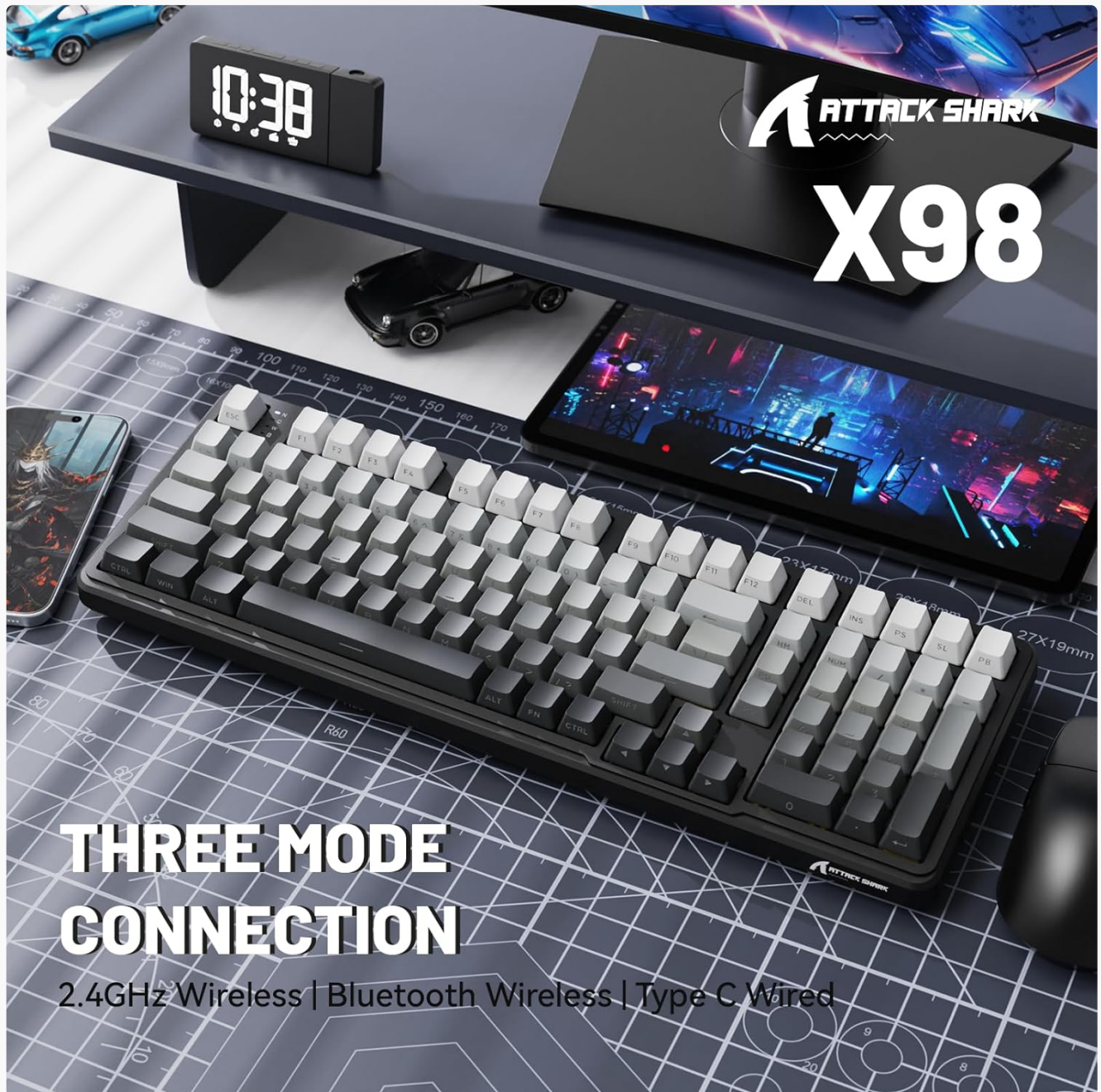
Image 3.1: The ATTACK SHARK X98 keyboard demonstrating its triple connection capabilities.

The X98 keyboard supports three connection modes: 2.4GHz Wireless, Bluetooth 5.0, and Wired (USB Type-C).