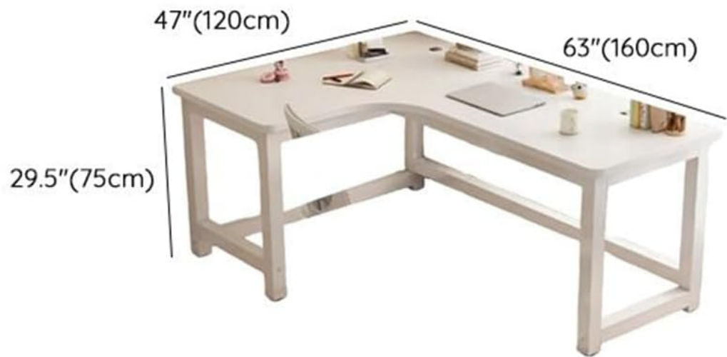
Image 4: Dimensional diagram of the KWOKING L-Shape Office Desk, illustrating its length, width, and height.