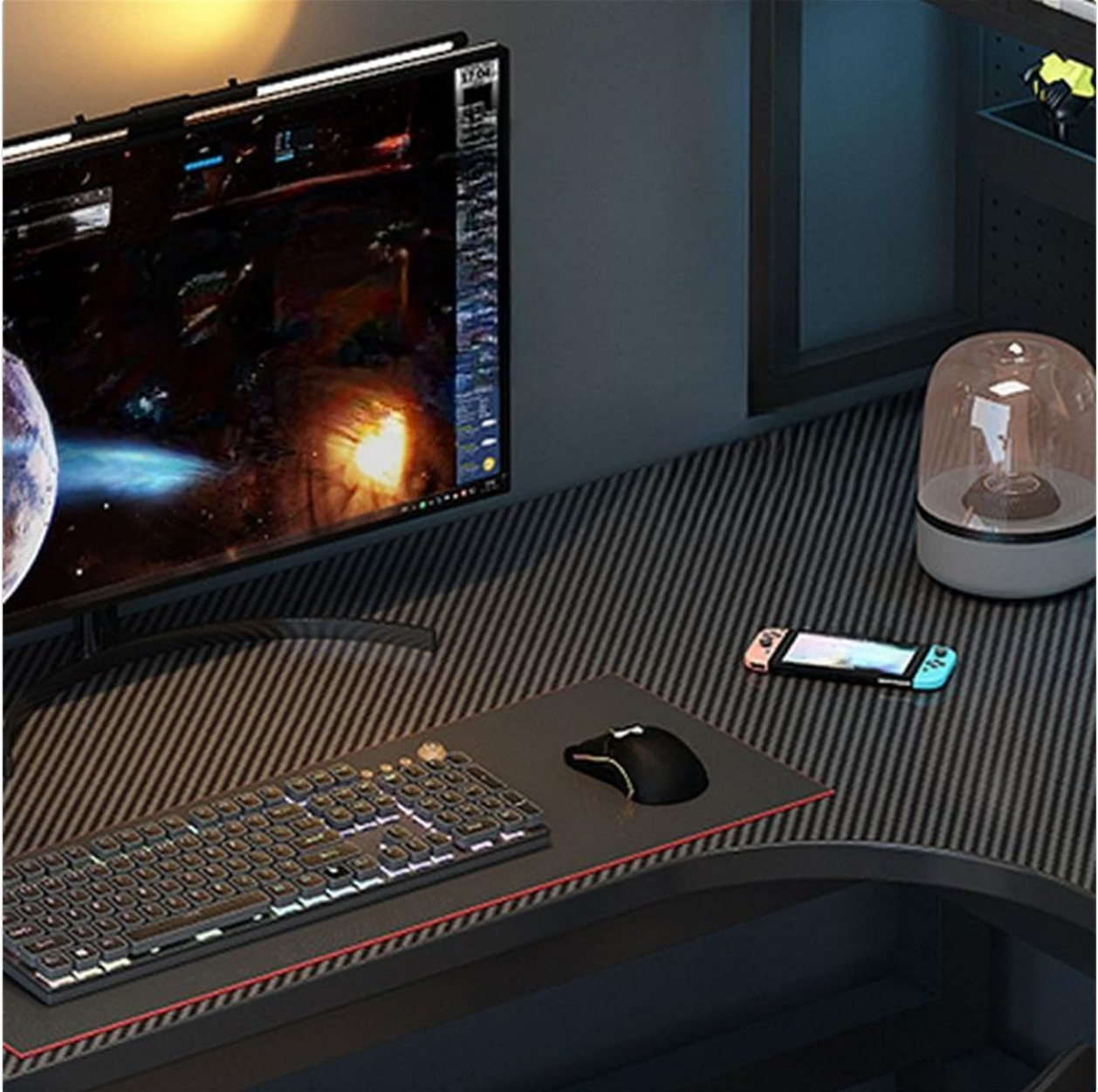
Image 3: The L-Shape desk configured for a gaming setup, showcasing ample space for a monitor, keyboard, mouse, and other peripherals.