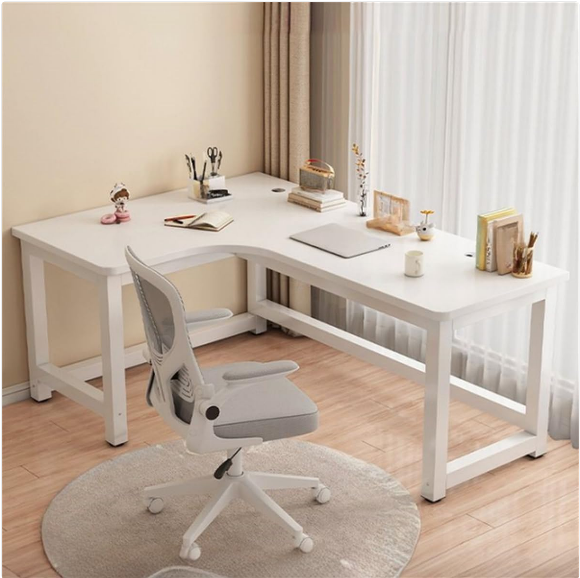
Image 1: Fully assembled KWOKING L-Shape Office Desk. This image provides an overview of the final product.