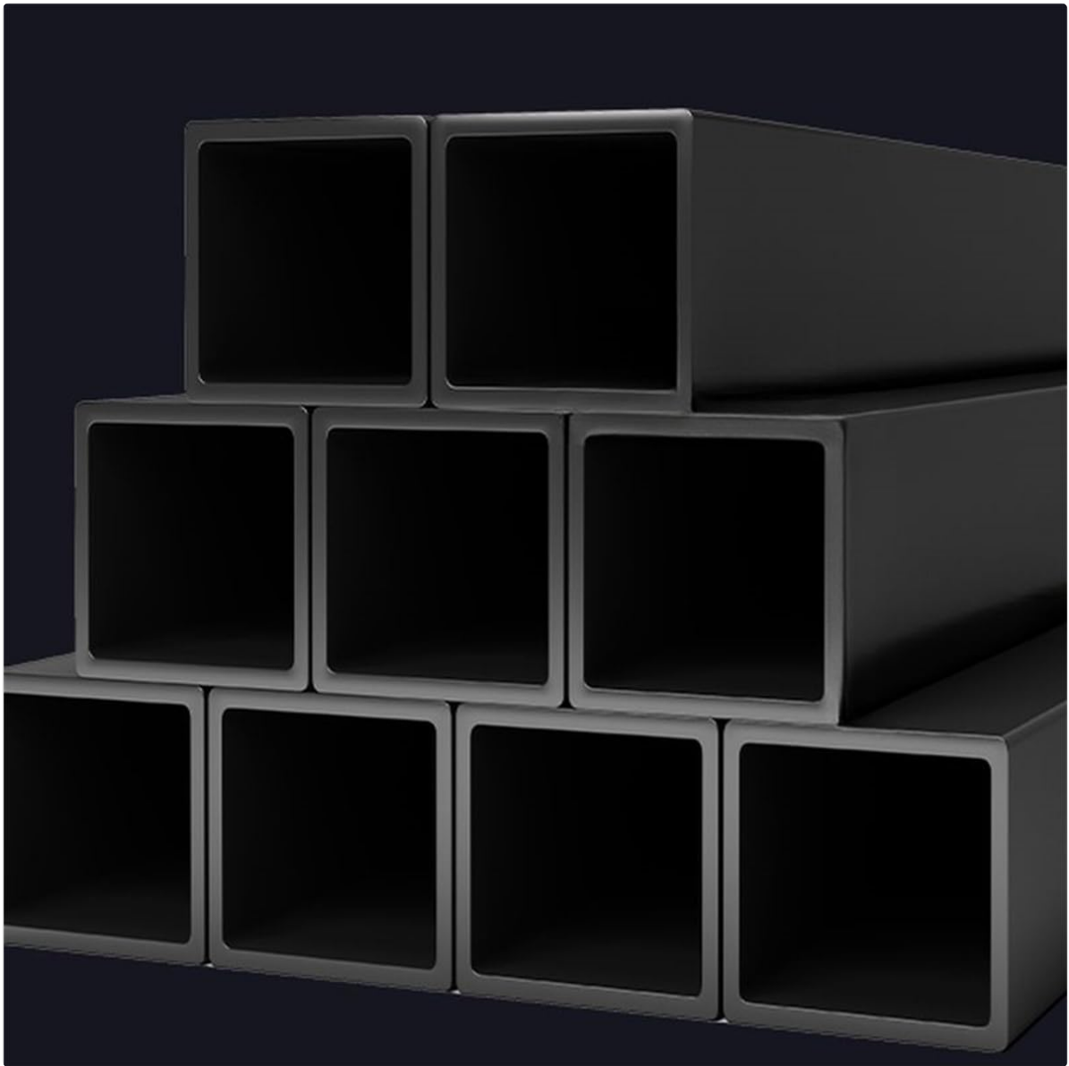
Image 2: Detail of the robust square metal tubing used for the H-shape base, highlighting the durable construction.