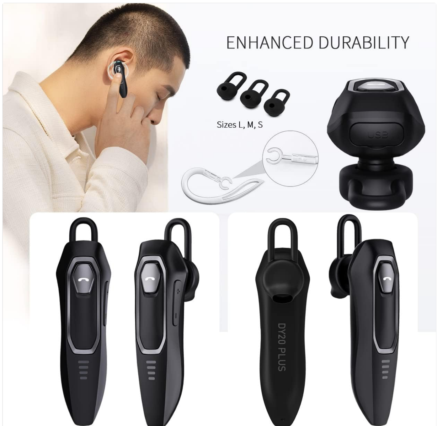
Image 4: Ear Tips and Durability. This image shows the included ear tips in different sizes (L, M, S) and highlights the enhanced durability features of the headset.