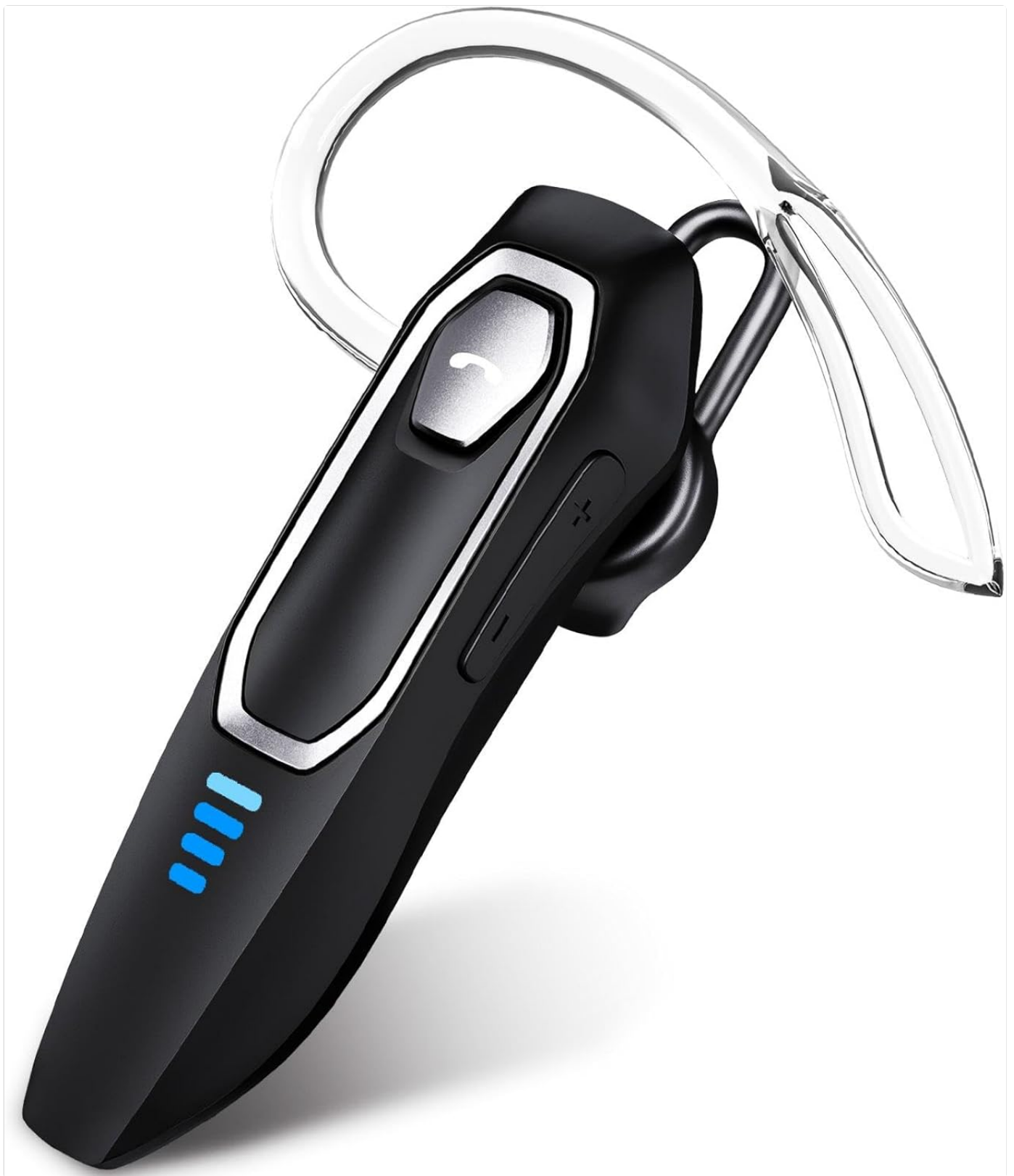
Image 1: Micool DY20PLUS Bluetooth Headset. This image displays the main headset unit, highlighting the call button, volume controls, and LED power indicators.