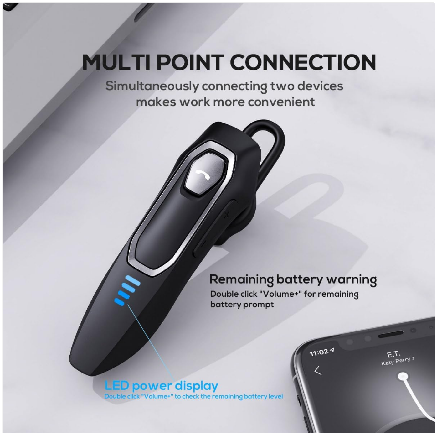
Image 3: Multi-Point Connection and LED Display. This image illustrates the headset's ability to connect to two devices simultaneously

Multipoint Connection: The DY20PLUS headset can connect to two devices simultaneously. After pairing with the first device, disable Bluetooth on that device. Then, put the headset back into pairing mode and connect to the second device. Re-enable Bluetooth on the first device, and the headset should automatically connect to both.