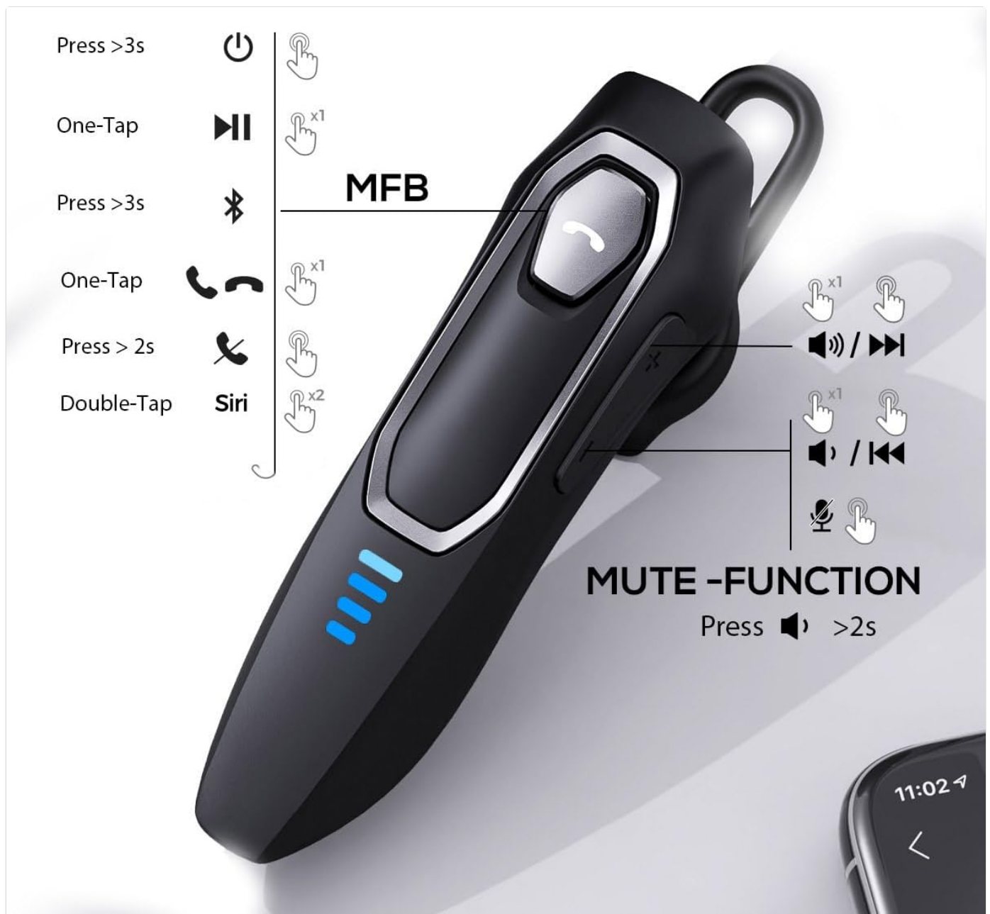
Image 2: Headset Controls Diagram. This diagram illustrates the Multi-Function Button (MFB) for power, play/pause, and Bluetooth pairing, along with volume controls and mute function.