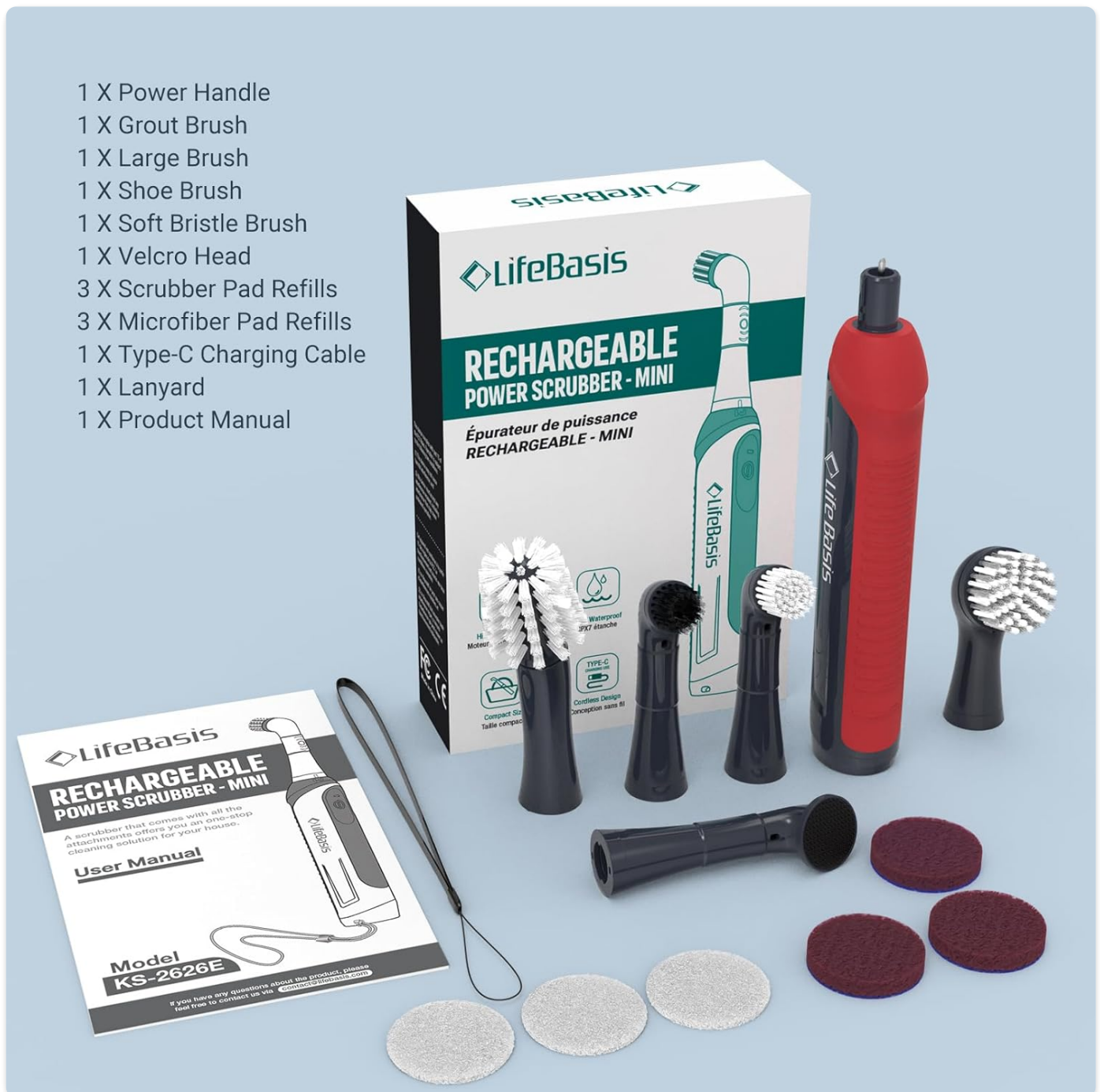
Image: All components of the LifeBasis Rechargeable Power Scrubber 11-piece kit laid out, including the red and gray power handle, various brush heads, scrubber pads, microfiber pads, Type-C charging cable, lanyard, and user manual.