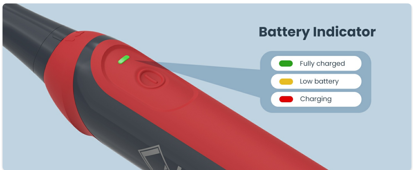
Image: The LifeBasis Power Scrubber handle showing the Type-C charging port and the LED battery indicator with green, yellow, and red states.

Your browser does not support the video tag.