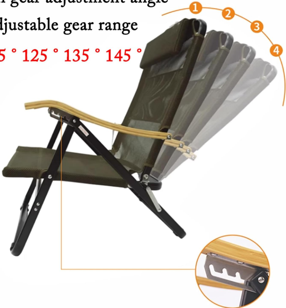
Figure 4.1: Visual guide to the 4-gear backrest adjustment, illustrating the range of recline angles.

The back mesh pocket can be used to store lightweight items such as a book, phone, or small water bottle. Avoid overloading the pocket to prevent damage or instability.