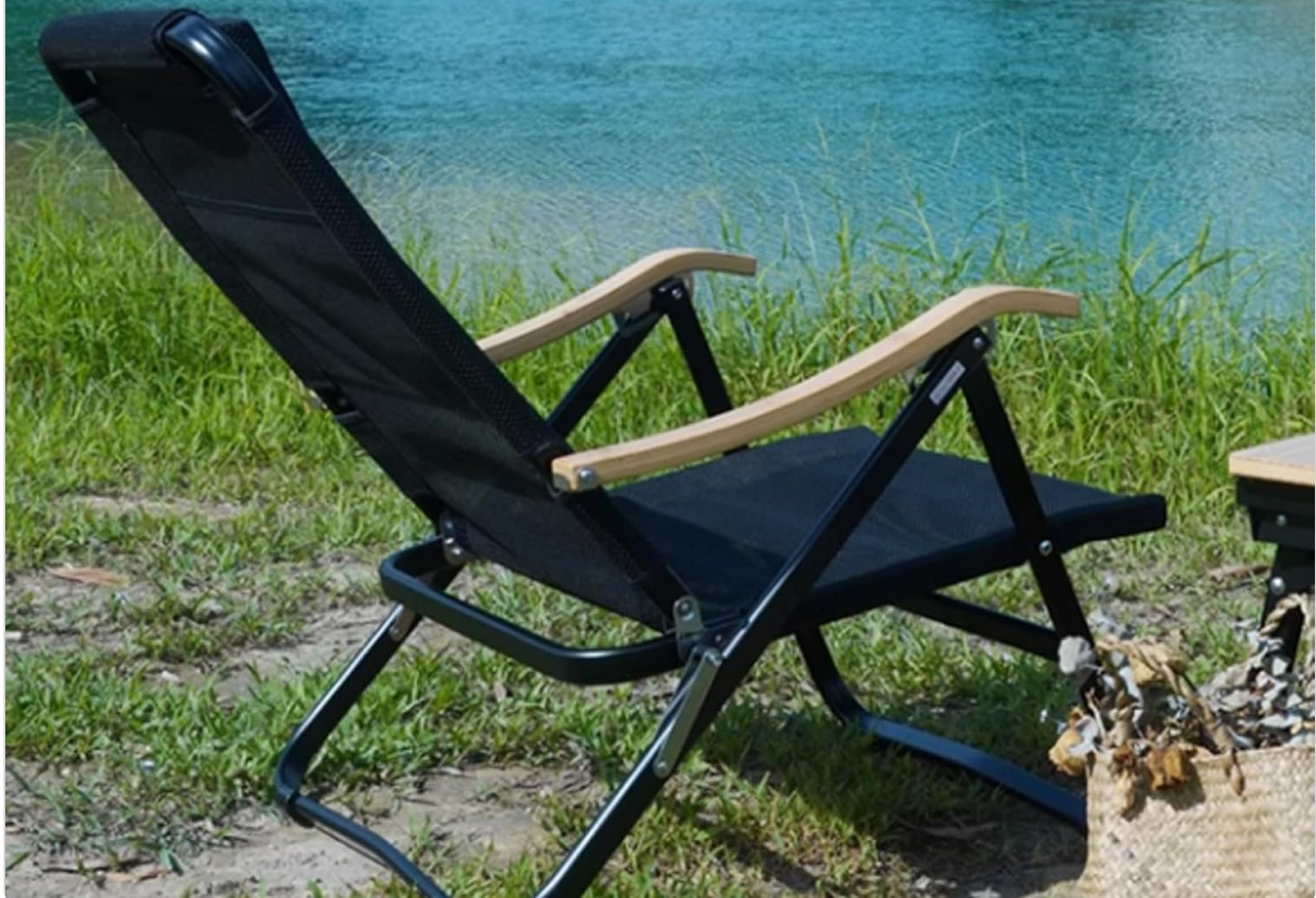
Figure 4.2: Close-up of the convenient mesh storage pocket located on the back of the chair.

Four adjustable gears can sit or lie down Comes with a comfortable pillow and supports without pressure