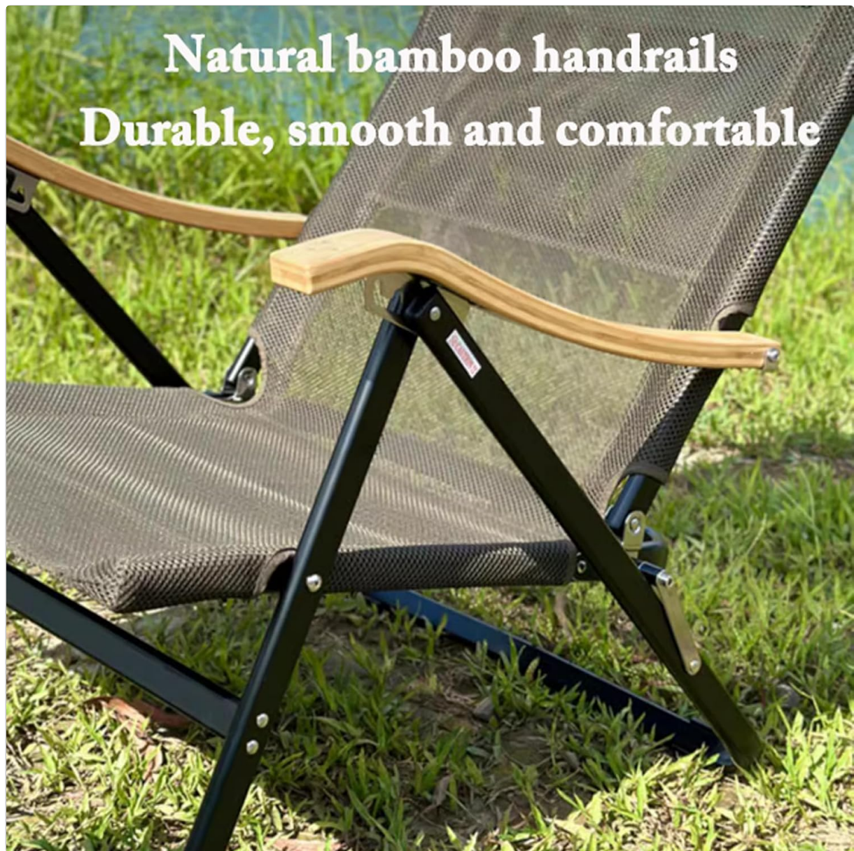
Figure 5.3: Natural bamboo handrails, which should be kept dry and clean.