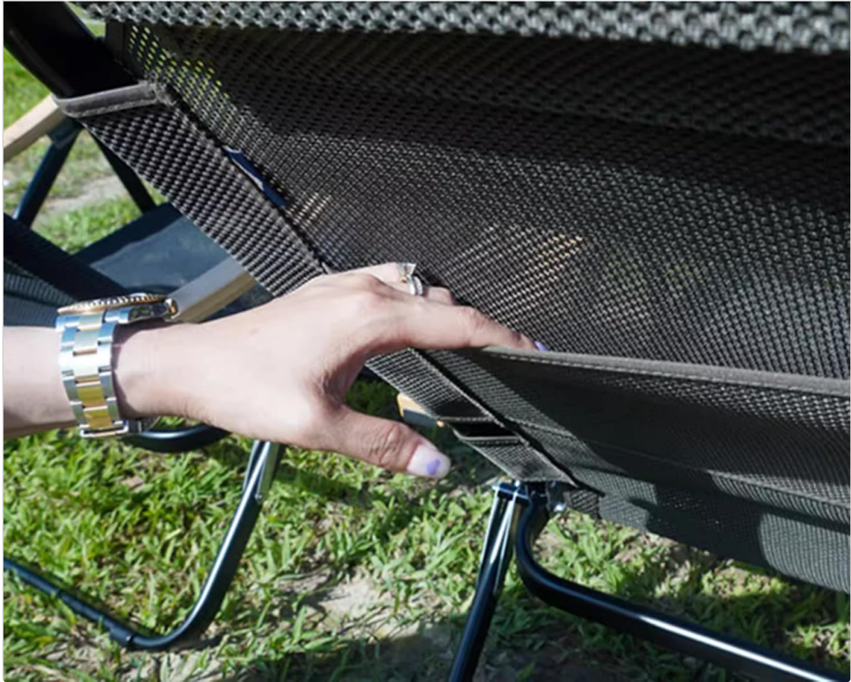
Figure 5.1: Detail of the breathable mesh fabric, which is easy to clean and maintain.

Can hold small items such as cups and magazines