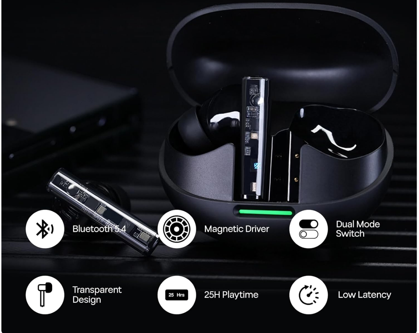
Image: Linsoul KZ Sora TWS Earbuds showcasing Bluetooth 5.4, Magnetic Driver, Dual Mode Switch, Transparent Design, 25H Playtime, and Low Latency features.