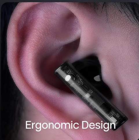
Image: Ergonomic Cavity Contour of the KZ Sora earbuds, illustrating the secure and gentle fit with various eartip sizes (S, M, L).