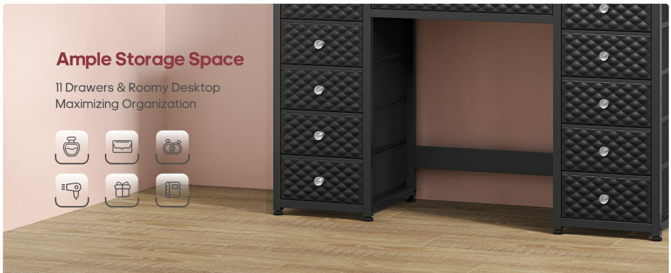
Image: An overhead view illustrating the vanity's desktop and the arrangement of its 11 drawers, highlighting ample and organized storage space.

Assemble the 11 drawers according to the instructions. The drawers feature a 4-layer construction for durability. Insert the assembled drawers into their designated slots. Attach the 6 open shelves to the mirror frame as shown in the diagrams.