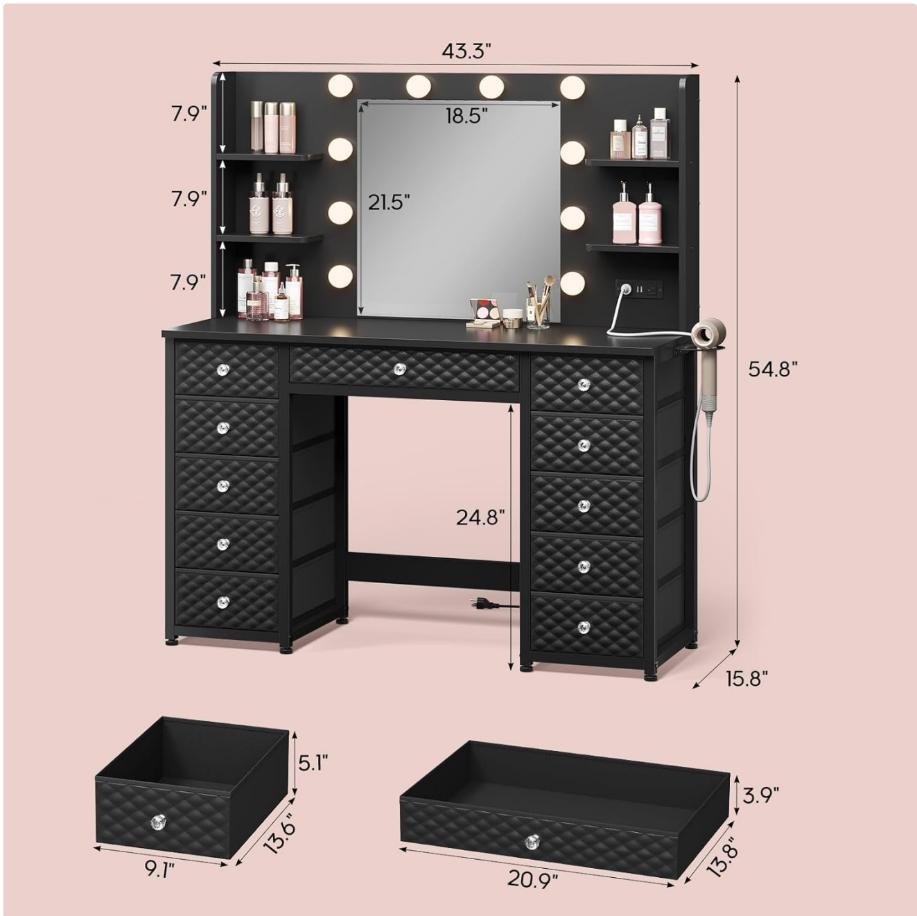
Image: Overview of vanity dimensions and key components.