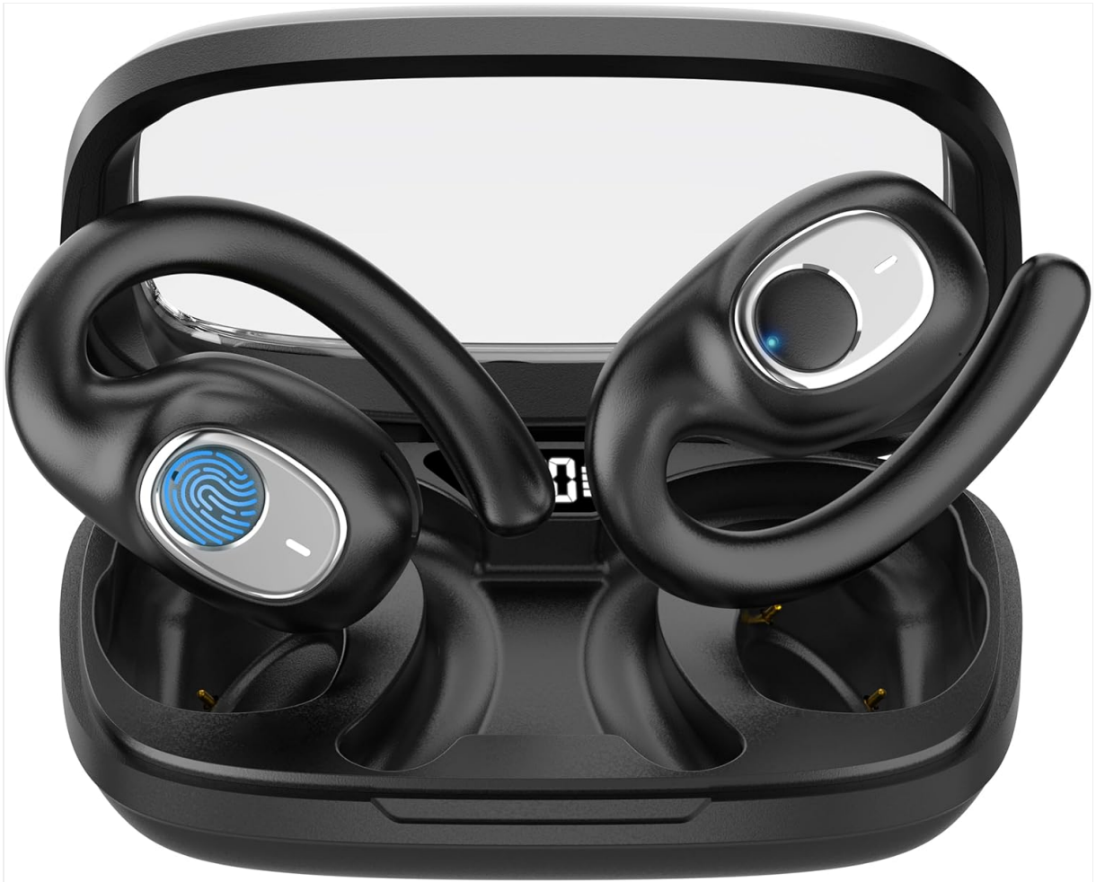
A pair of black Merryking AI Language Translation Earbuds, featuring an ear-hook design, resting in their open charging case. The case displays a digital battery percentage.