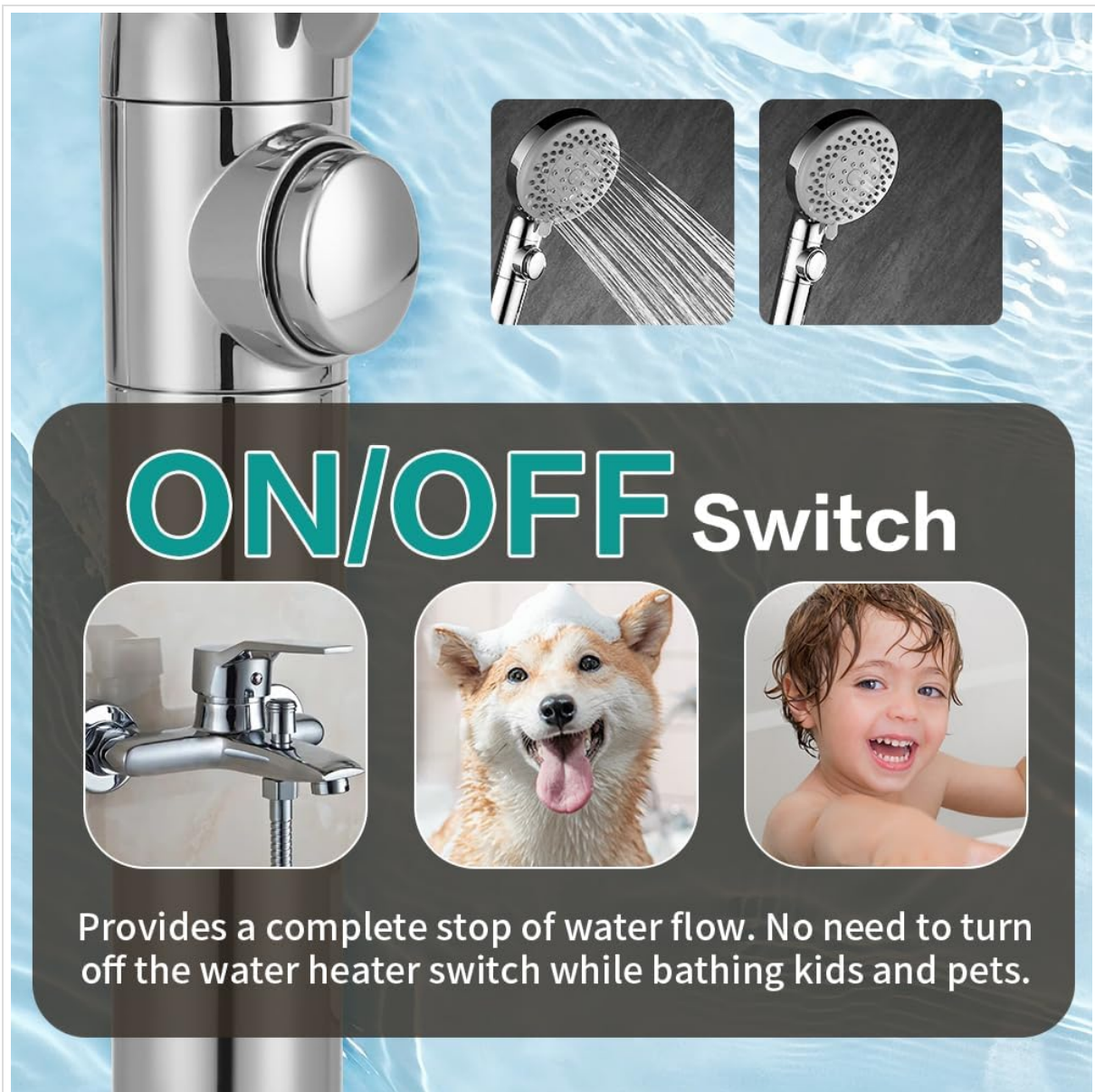
Figure 4: On/Off Pause Switch. This image highlights the button on the shower head handle that provides a complete stop of water flow, useful for tasks like bathing pets or children without adjusting the main water controls.