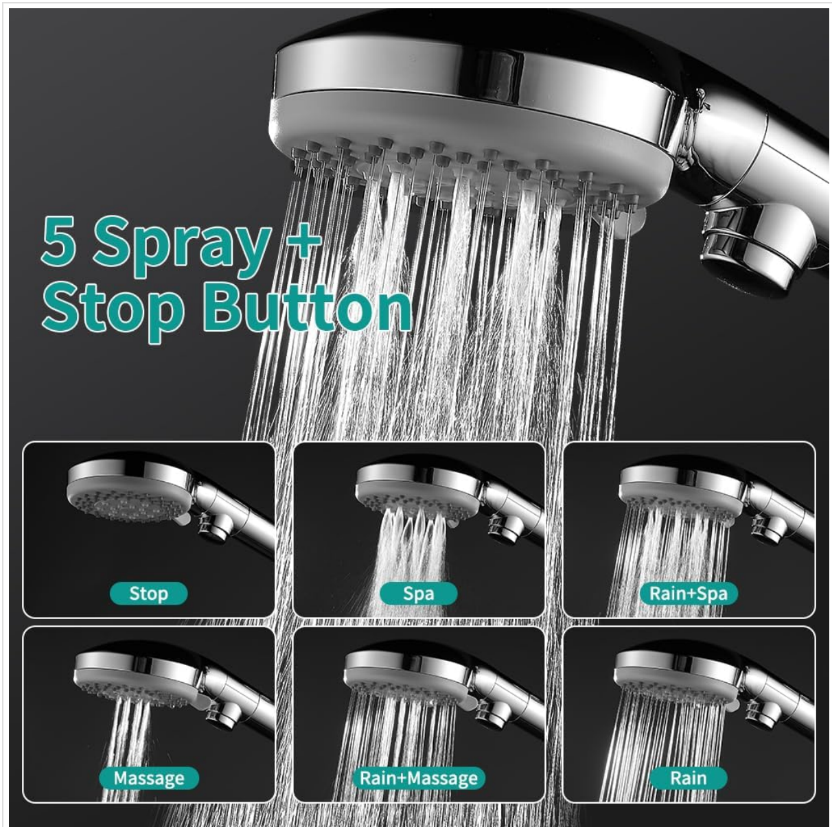
Figure 3: Spray Mode Selection. This image illustrates the various spray patterns available by rotating the shower head's dial, including Spa, Rain+Spa, Massage, Rain+Massage, Rain, and a Stop function.