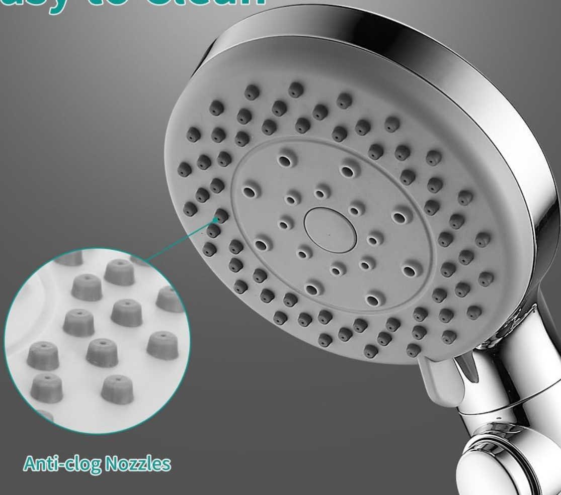
Figure 6: Anti-Clog Nozzles. This image provides a close-up view of the shower head's grey silicone nozzles, emphasizing their anti-clog design for easy cleaning and maintenance.