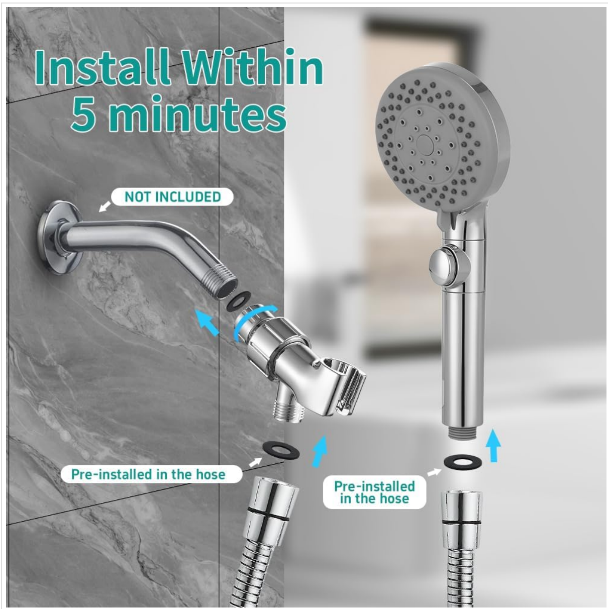
Figure 2: Easy Installation Steps. This visual guide illustrates the process of connecting the overhead bracket to the shower arm, then attaching the hose to both the bracket and the handheld shower head. Washers are shown pre-installed in the hose connections.