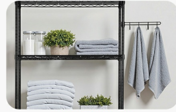
Rotatable Side Hooks Convenient for hanging washed blankets, hats, towels, scarves, and more

Image Description: An animated diagram showing the sequential steps of attaching the L-shaped crossbars and sidebars to the lower poles, forming the initial base structure of the shelf unit.