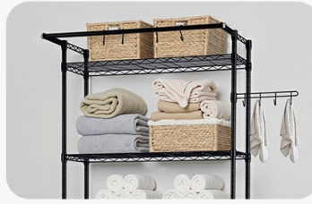
Heavy-Duty Carbon Steel Material Durable and long-lasting, with a rust-resistant coating to avoid corrosion