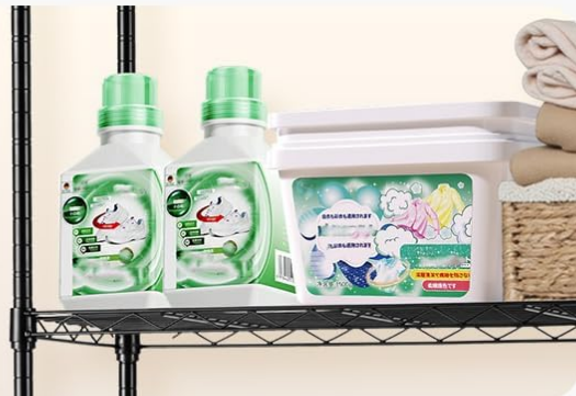
Image Description: A lifestyle image of the black 3-tier storage shelf positioned over a washing machine, showcasing organized laundry detergents, folded towels, and items hanging from the side hooks.

Store towels, laundry detergent, and more