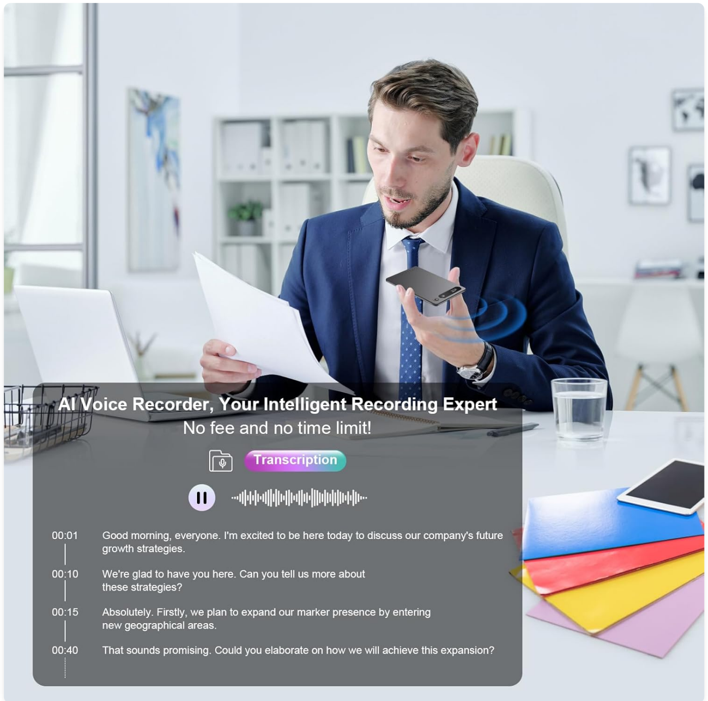
Figure 6.2: Transcription feature in the DOWAY app.