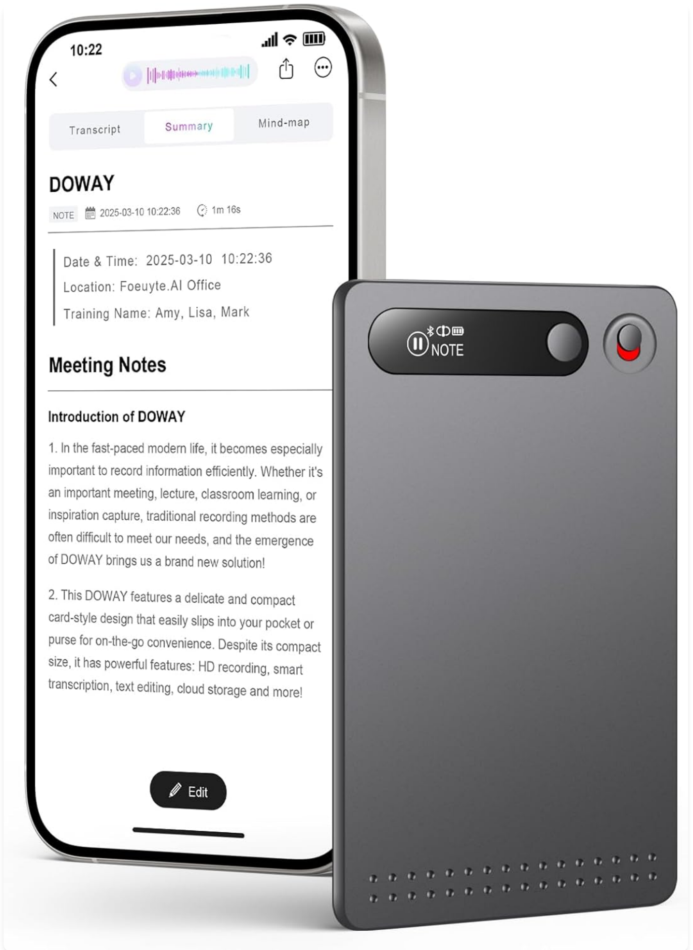
Figure 1.1: YOPHOON AI Voice Recorder Model A2 with companion app.