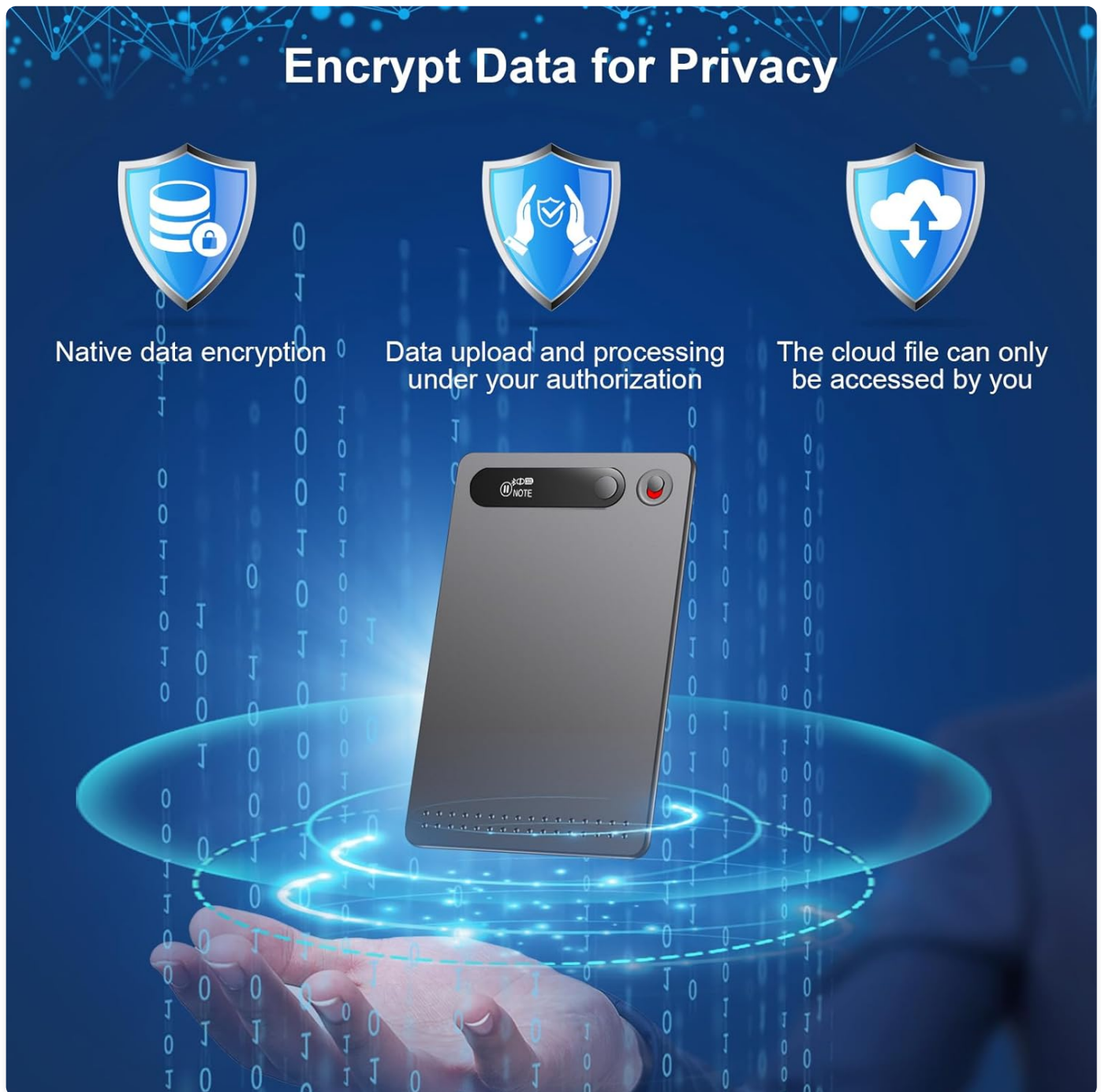
Figure 6.1: Using the AI Voice Recorder for general recording.