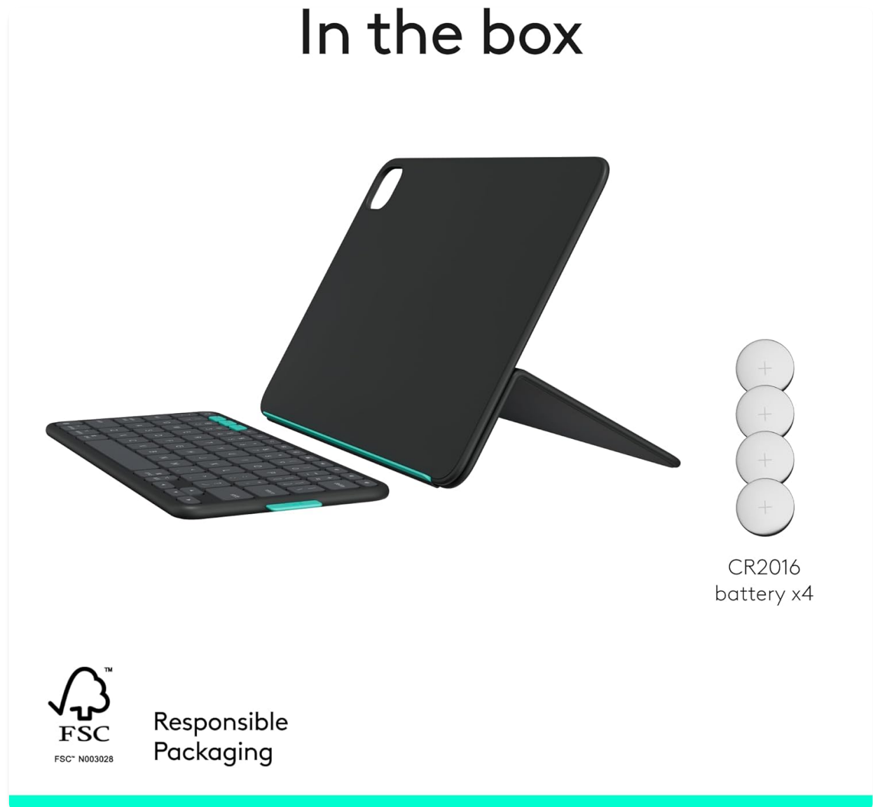
Figure 2: Package contents of the Flip Folio.