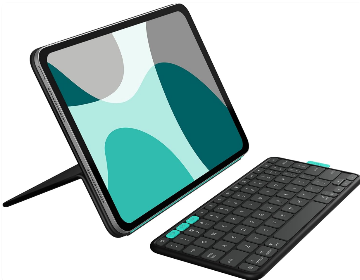
Figure 1: Logitech Flip Folio Keyboard Case with iPad and detachable keyboard.

The Logitech Flip Folio is a versatile keyboard case designed to enhance your iPad experience. It provides front-and-back protection for your device and features a stowable Bluetooth keyboard, offering flexibility for typing, viewing, and portability. This manual provides instructions for setting up, operating, and maintaining your Flip Folio.