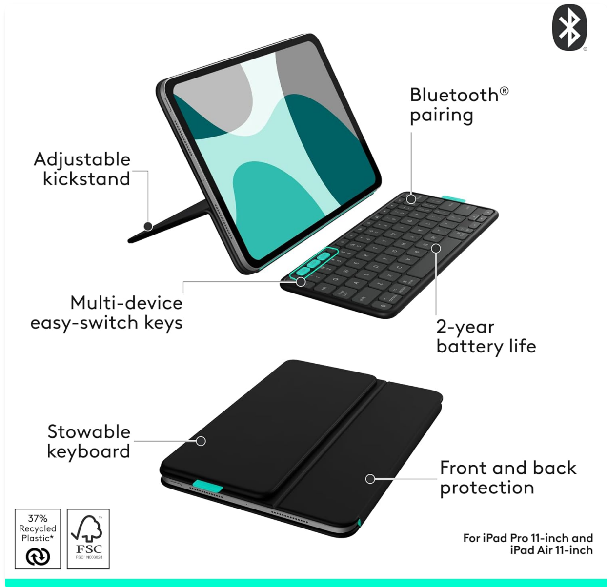
Figure 3: Overview of Flip Folio features including adjustable kickstand and stowable keyboard.

Video 1: Official Logitech Flip Folio Unboxing and Setup Guide. This video demonstrates how to attach your iPad to the folio, set up the stand, and pair the Bluetooth keyboard.