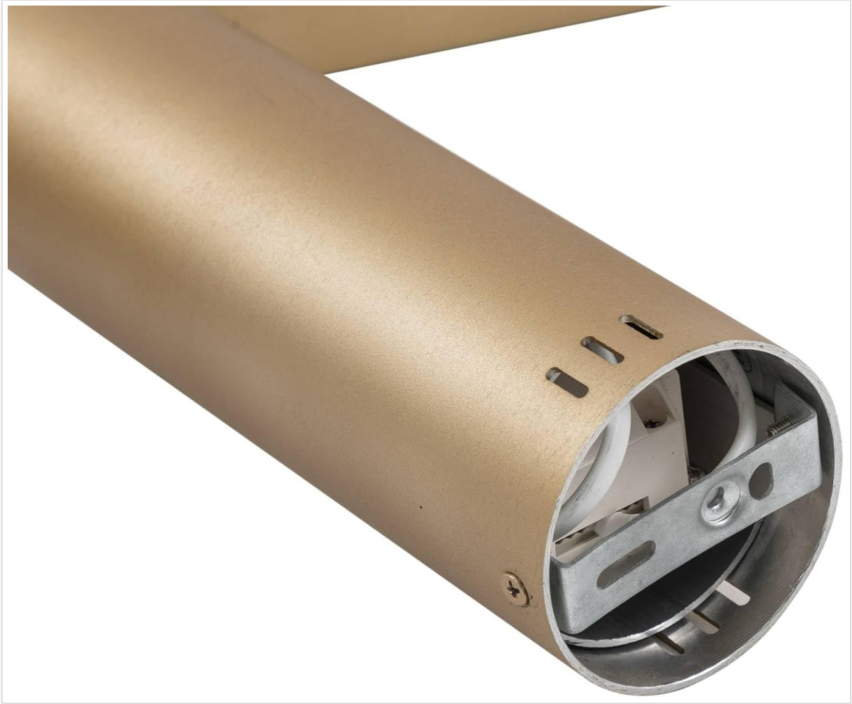
Image 2: Components of the Lucande 10020397 pendant light. This image displays the main light body, suspension wires, and the ceiling mount component.