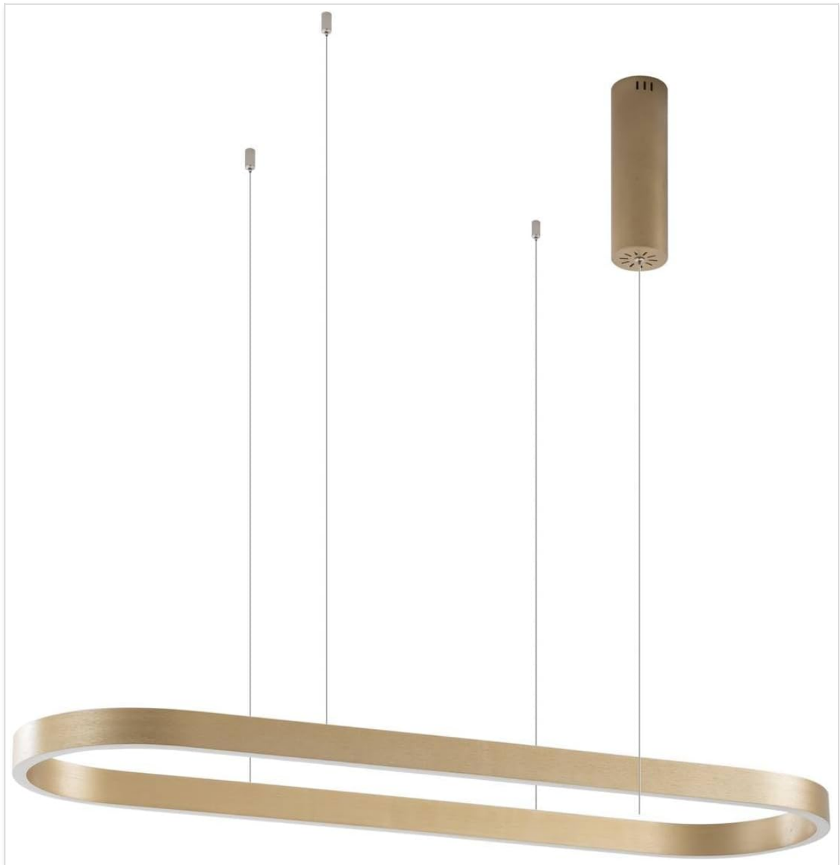
Image 1: Lucande 10020397 Gold Aluminum Pendant Light. This image shows the complete pendant light fixture, highlighting its oval shape and gold finish.