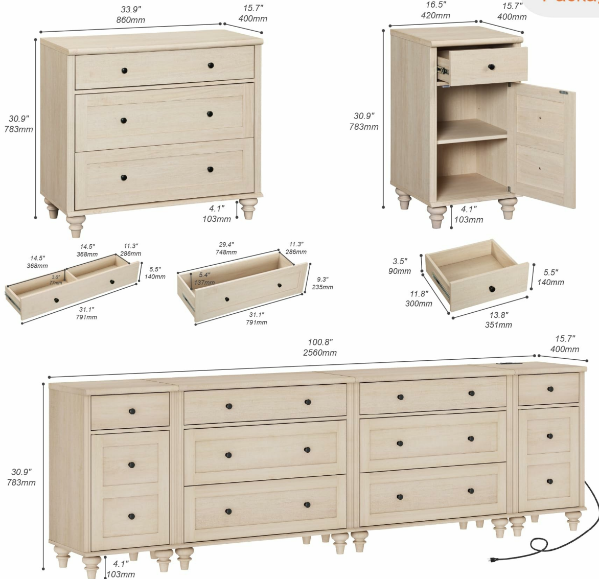
Image: The integrated charging station with AC outlets and USB ports for convenient device charging.