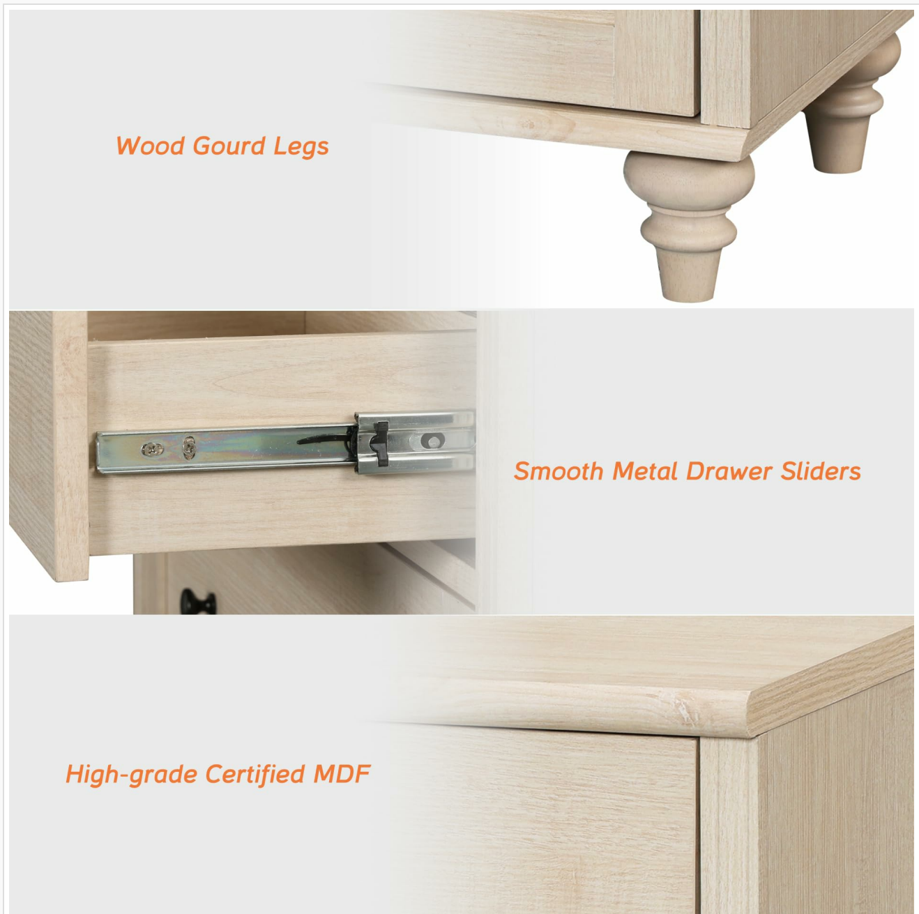
Image: Detail of the smooth metal drawer slides for easy operation and the quality MDF construction.

The dresser features eight drawers and two storage cabinets. The drawers are equipped with smooth metal slides for effortless opening and closing. The cabinet shelves are height-adjustable, allowing you to customize storage space as needed. To adjust shelves, remove the shelf, reposition the support pins to the desired height, and reinsert the shelf.