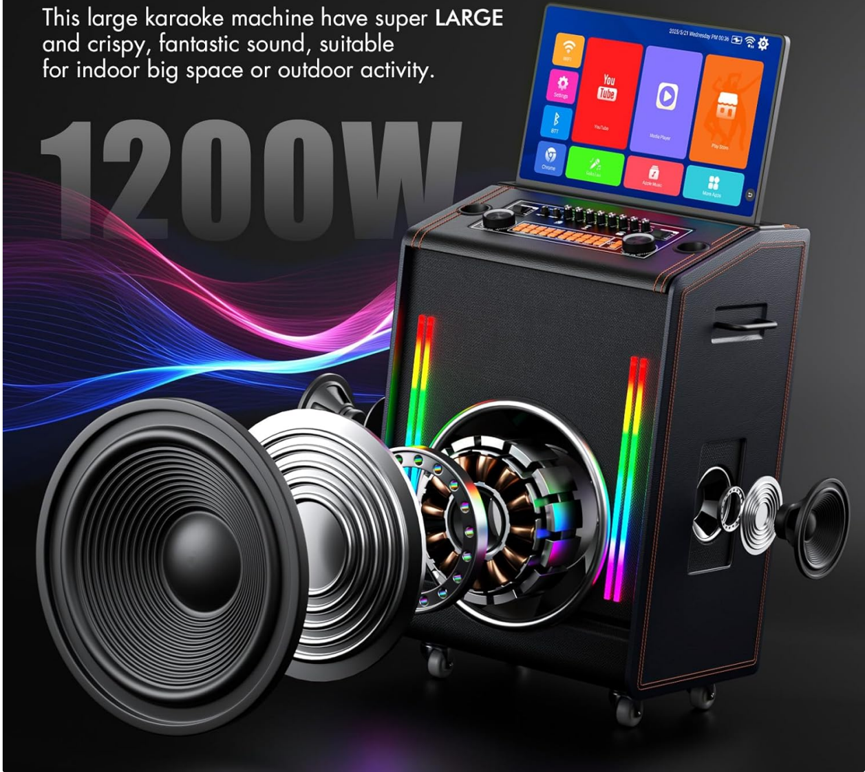
Image: An exploded view of the speaker components within the BENPAL D70, illustrating the powerful 12-inch bass speaker and other sound elements.