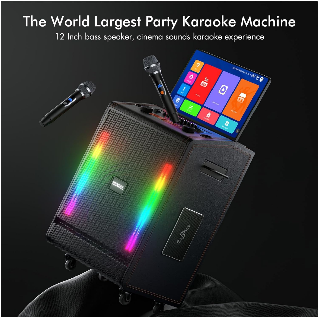
Image: The BENPAL D70 Smart Karaoke Machine showcasing its main features, including the large touch screen and wireless microphones.