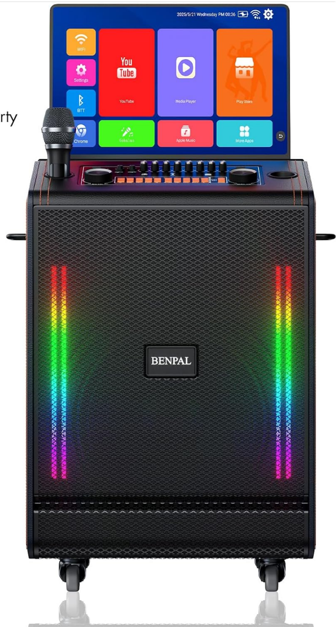
Image: A visual representation of the BENPAL D70's various connectivity features and power source, including Wi-Fi, Bluetooth, HDMI, USB, built-in battery, and LED lighting.