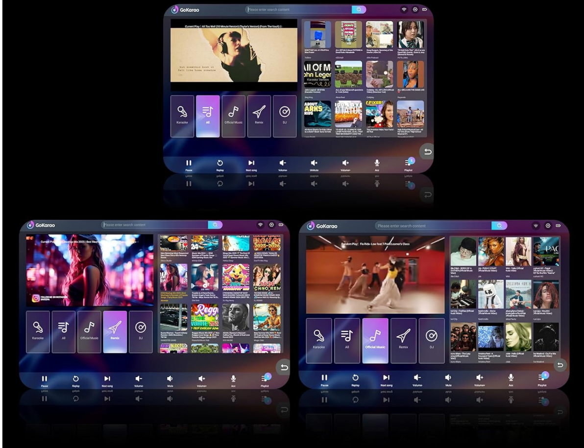
Image: Multiple views of the BENPAL D70's karaoke application, demonstrating song search, selection, and language support for English, Japanese, and Korean tracks.

Preinstall karaoke app for millions of songs, support English, Japanese, Korea language songs.