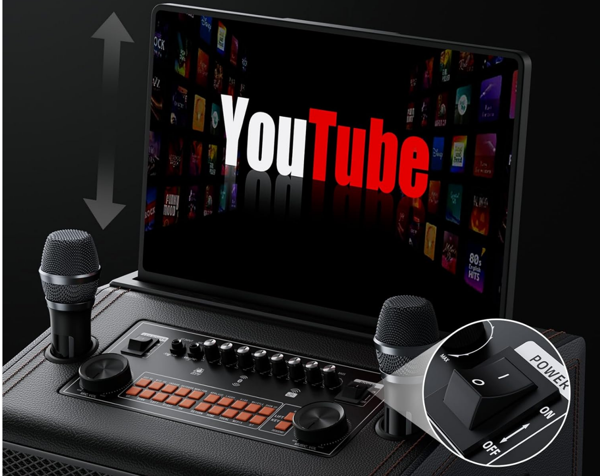
Image: The control panel of the BENPAL D70, highlighting the buttons used to adjust the height of the integrated touch screen.

17.3 Inch Large High Sensitive Touch Screen, preinstall karaoke app for easy singing.