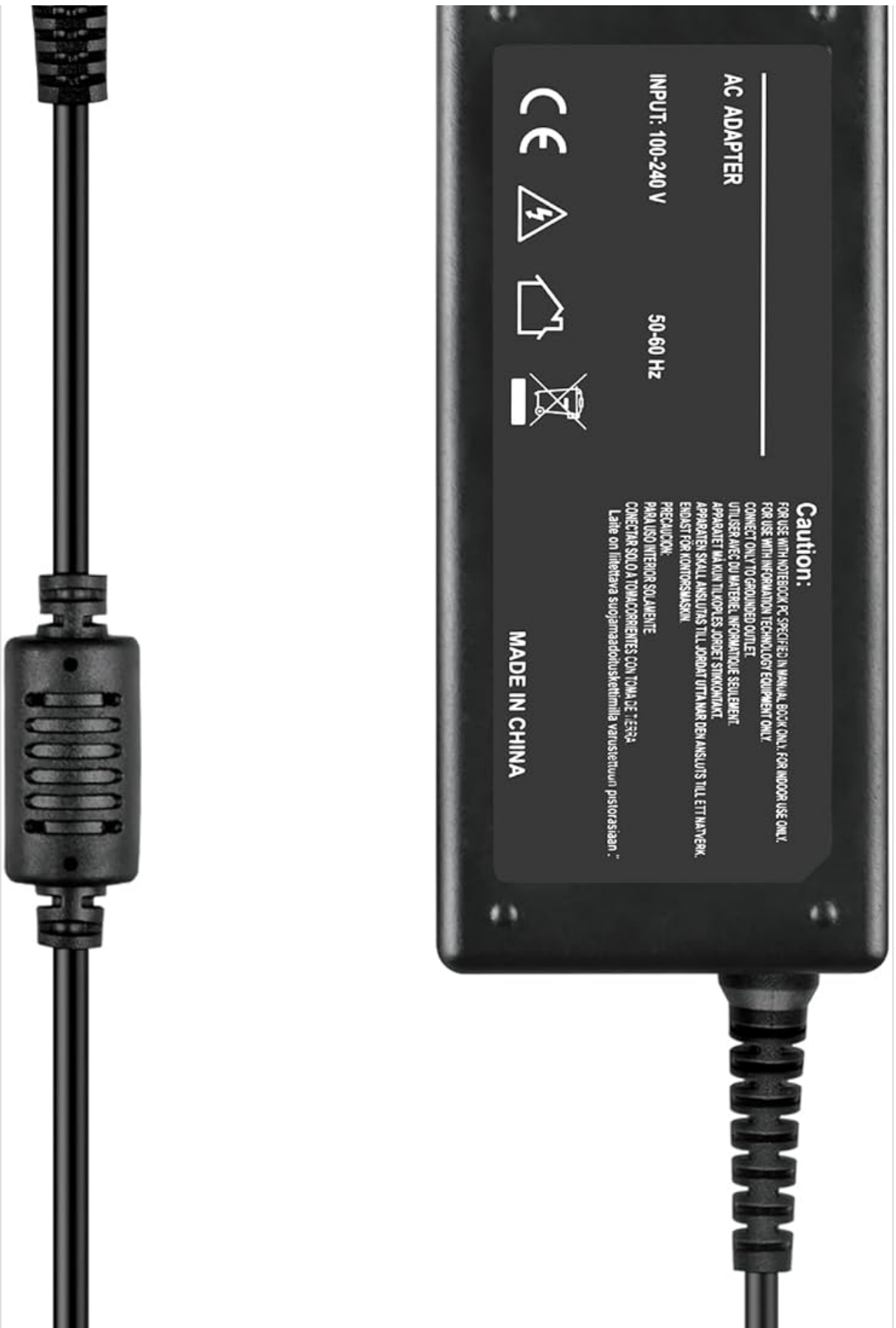
Figure 3.2: Top view of the adapter unit, showing input voltage (100-240V), frequency (50-60Hz), and safety warnings.