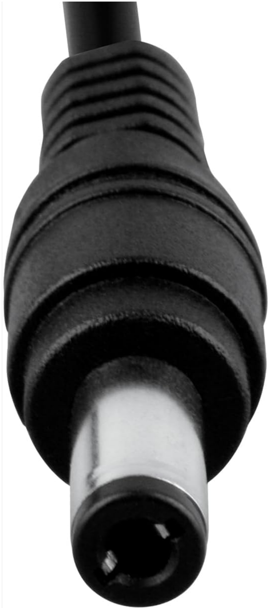
Figure 3.3: Close-up of the round DC output connector, which plugs into your compatible device.