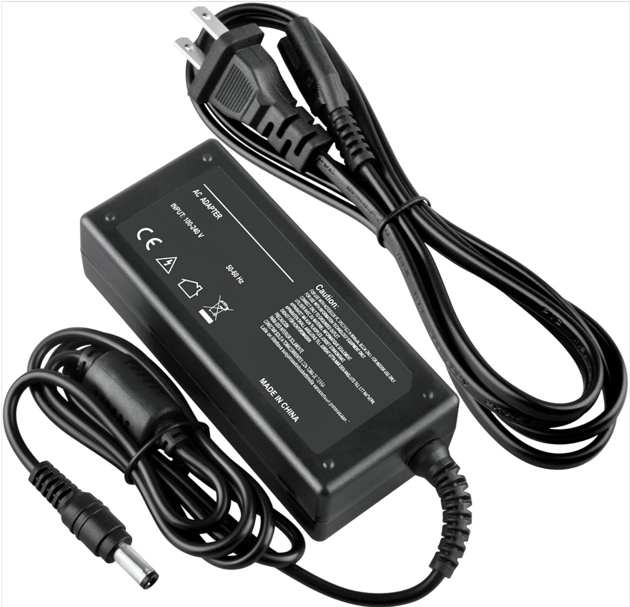
Figure 3.1: Complete view of the Acctest AC/DC Adapter, including the main unit, AC input cable with a US plug, and DC output cable with a round connector.

cable with a round connector. It converts alternating current (AC) from a wall outlet to direct current (DC) required by your portable power station or similar compatible device.