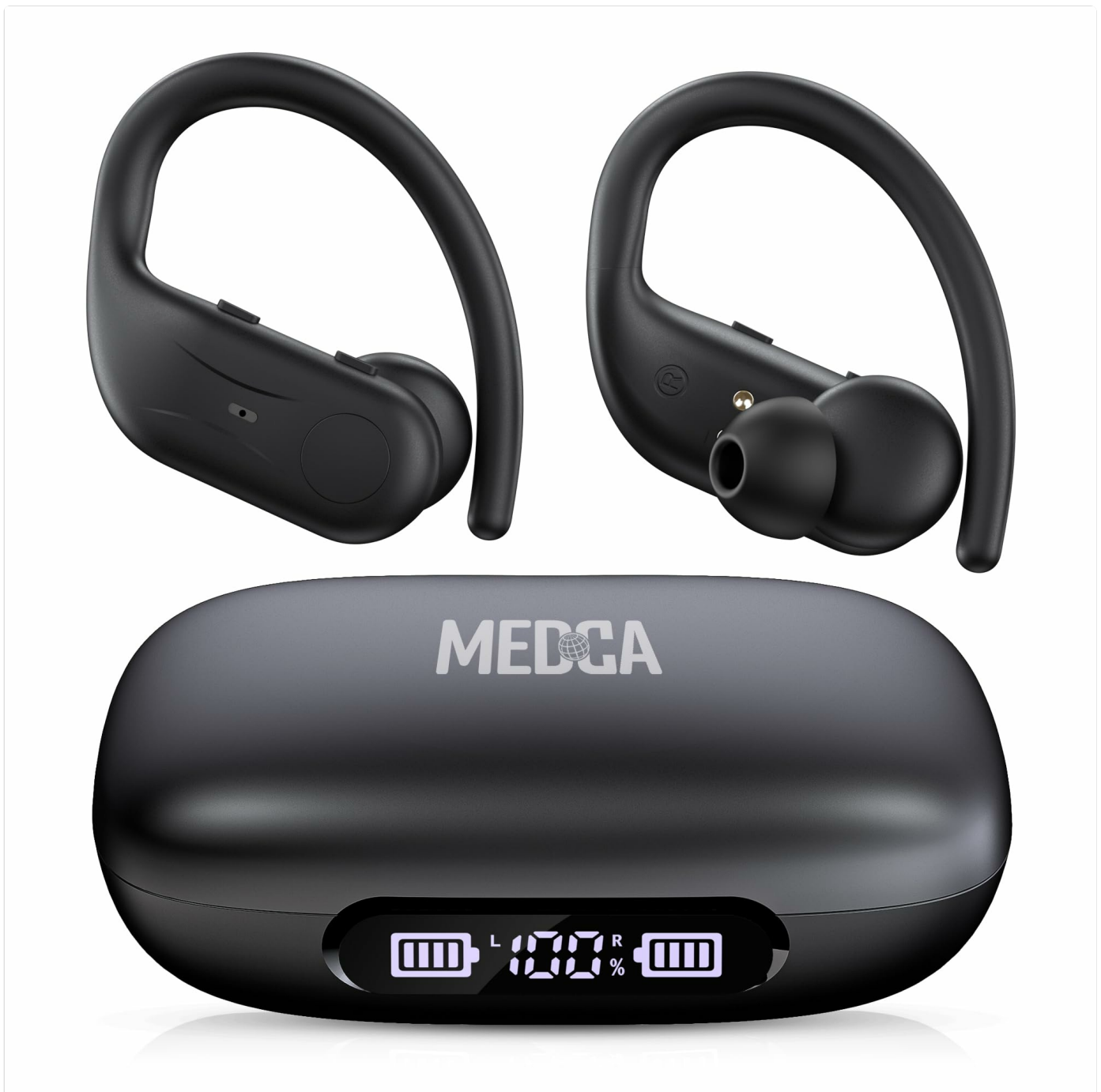
Figure 8: Bluetooth 5.3 connectivity for clear hearing and streaming.