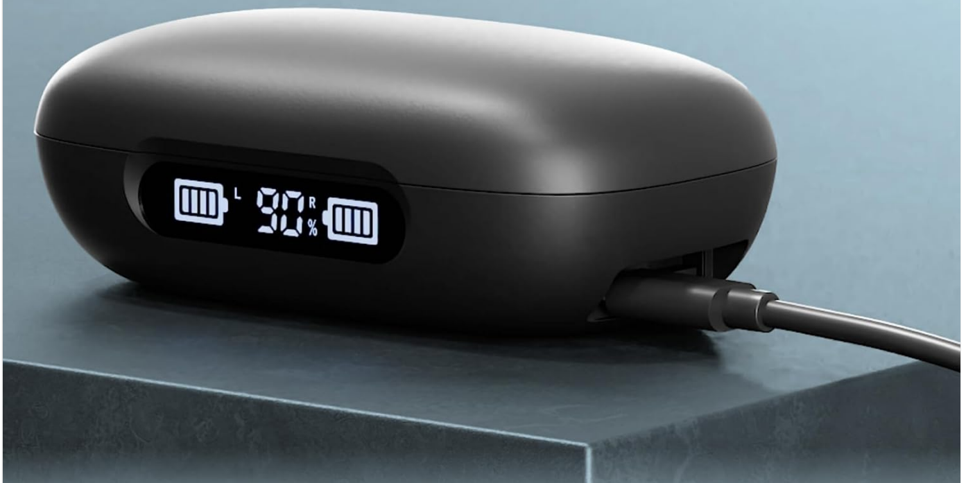
Figure 7: All-day power capabilities of the hearing aids and charging case.