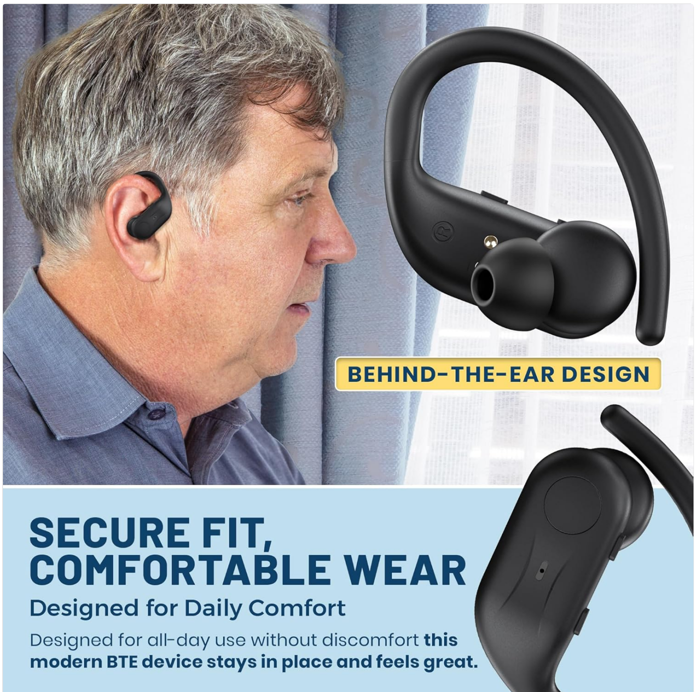
Figure 4: Proper placement of the Behind-The-Ear hearing aid.