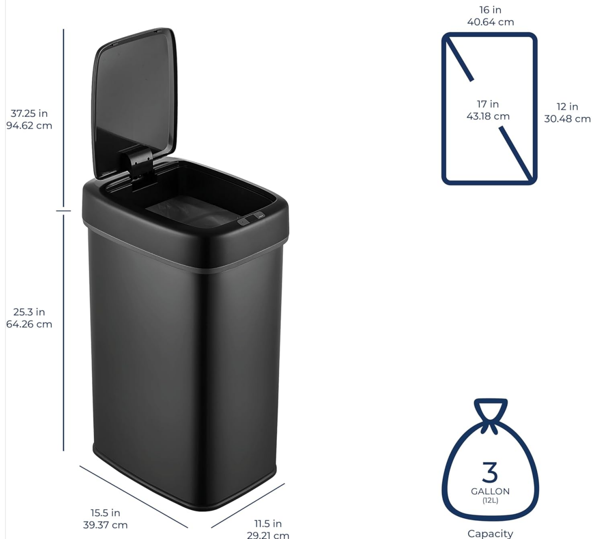
Image: The motion sensor activating the lid to open.