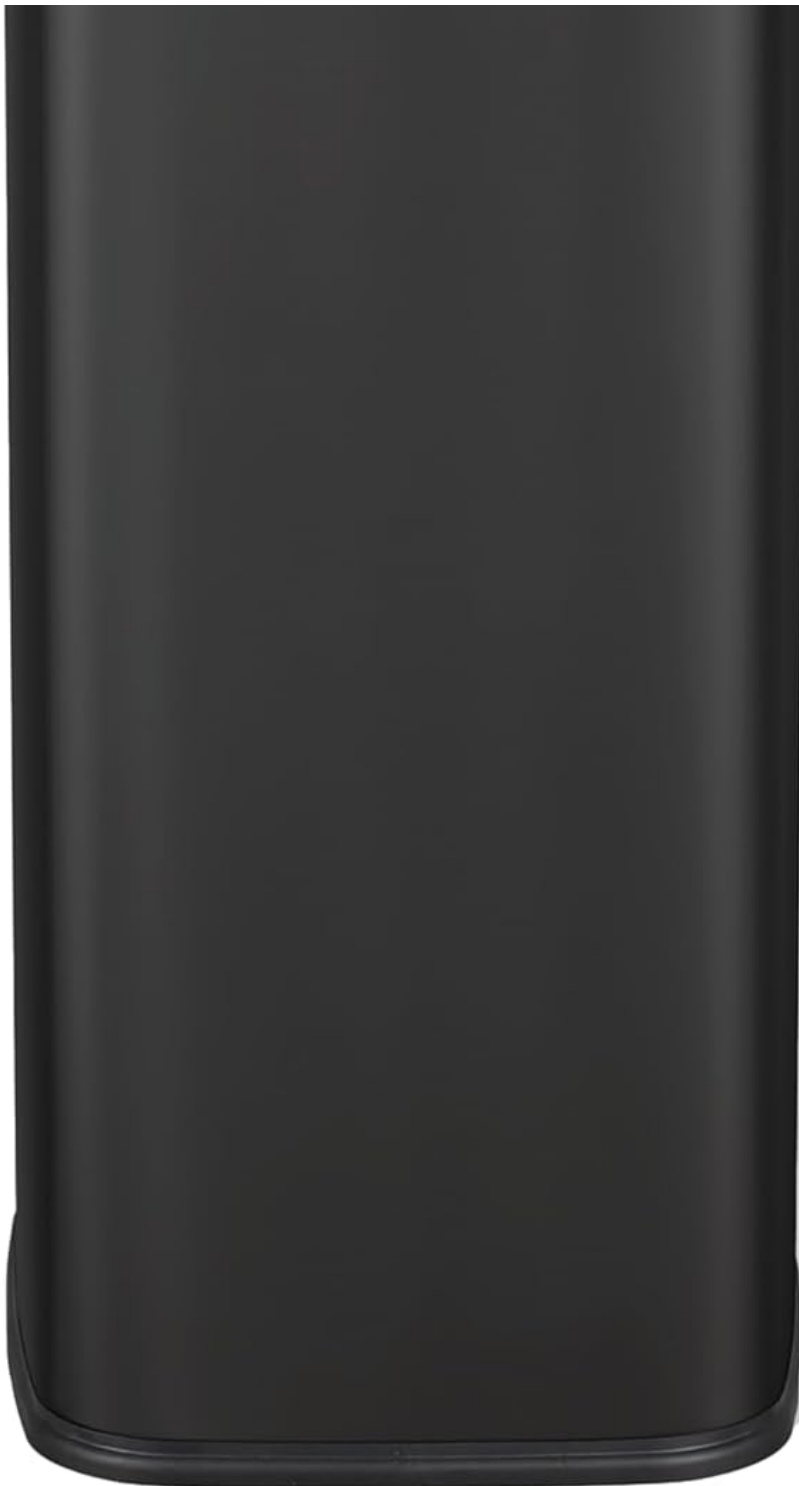
Image: Front view of the NINESTARS DZT-50-16BSS Automatic Touchless Motion Sensor Oval Trash Can.