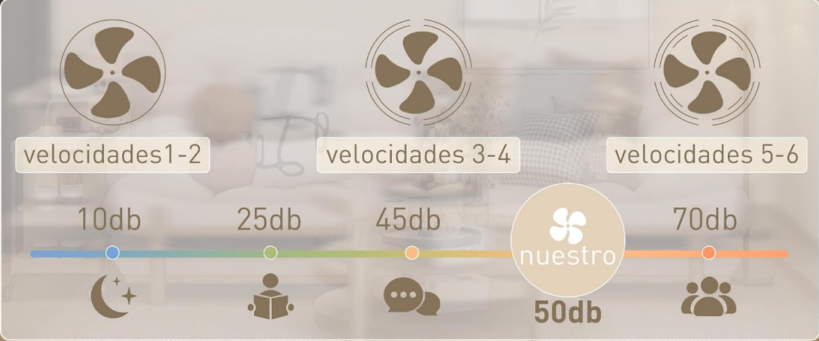
The fan offers 6 speeds and a breeze mode for varied airflow and quiet operation.

Modo brisa: Ofrece viento natural mediante el ciclo de la velocidad del ventilador