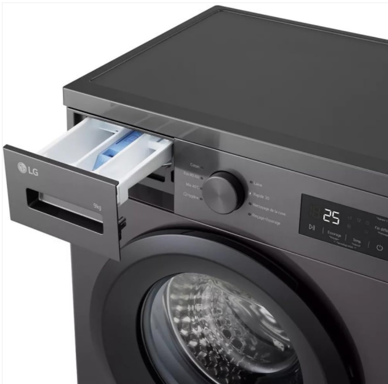
Close-up view of the detergent dispenser drawer of the LG F94N14SLS washing machine, pulled out to show compartments for detergent and fabric softener.