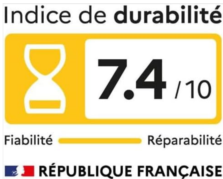
Durability index label for the washing machine, showing a score of 7.4 out of 10 for reliability and reparability, issued by the French Republic.