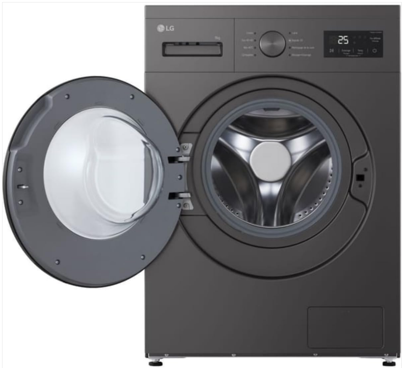
Front view of the LG F94N14SLS washing machine with the door open, showing the stainless steel drum and control panel.