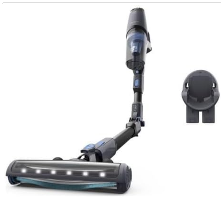
Figure 2: Various components and accessories included with the vacuum cleaner, showing the main unit, extension tube,