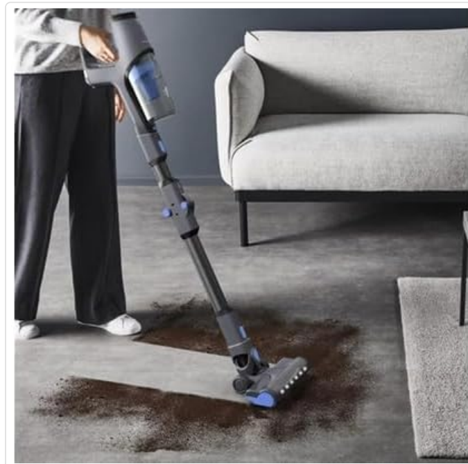
Figure 3: Demonstrates the vacuum cleaner in action, effectively cleaning spilled dirt on a hard surface.

The Rowenta X-Pert 3.60 is designed for efficient dry cleaning on various floor types.