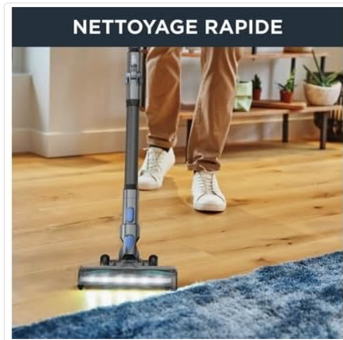
Figure 4: The vacuum cleaner's front LED lights illuminate the cleaning path, enhancing visibility for quick and thorough cleaning.