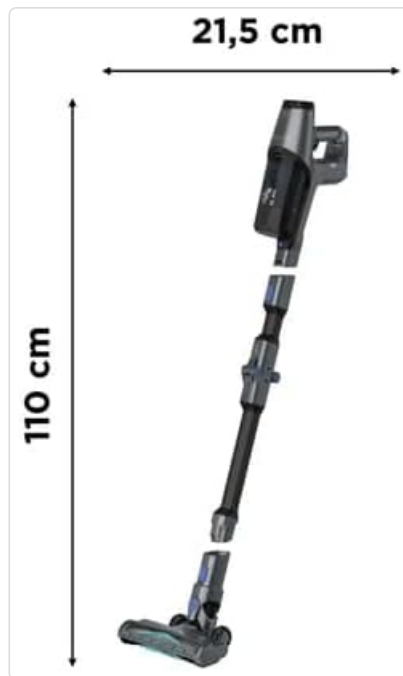
Figure 6: Dimensions of the Rowenta X-Pert 3.60 vacuum cleaner, indicating a height of 110 cm and a width of 21.5 cm.