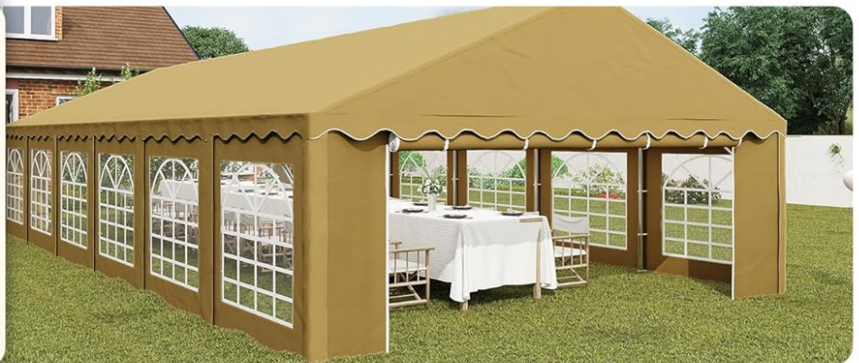
Image: The party tent showcasing its 12 removable window sidewalls, illustrating how they can be configured with 0, 6, or all 12 windows for varying levels of enclosure and light.