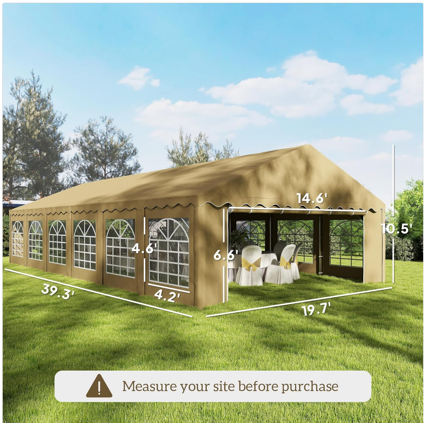
Image: The Outsunny Party Tent fully assembled in a backyard, furnished with tables and chairs, demonstrating its spacious interior suitable for events.

The Outsunny Party Tent is designed for versatile use. The removable sidewalls allow for customization based on weather conditions and privacy needs. The zippered doors can be rolled up and secured with buckles for open access or zipped down for full enclosure.