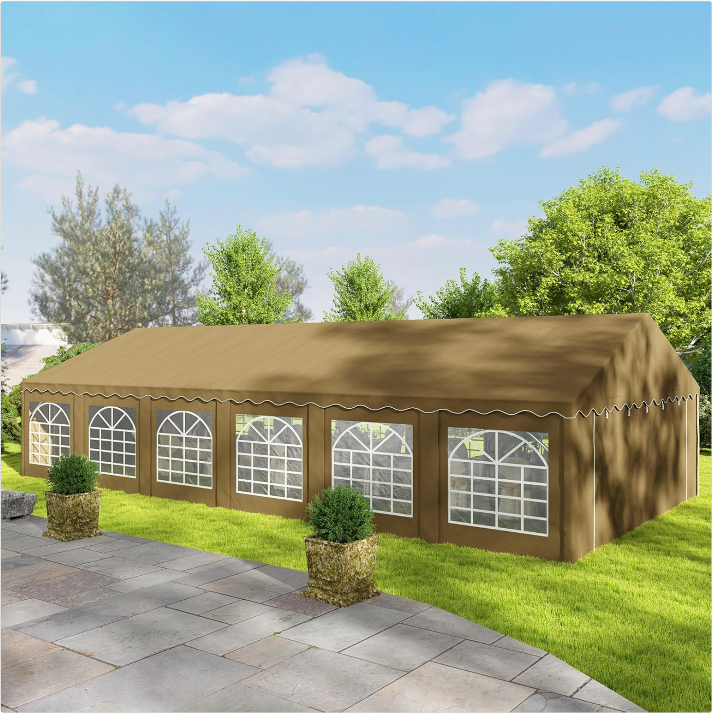
Image: The tent canopy illustrating its water-resistant properties and UPF30+ sun protection, designed to protect against light rain and harmful UV rays.

While the canopy is water-resistant, heavy or prolonged rain may cause minor leakage. Ensure the canopy is stretched tightly to allow water to run off. Check for any tears or punctures in the fabric and repair as necessary.