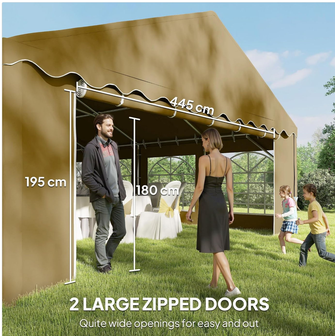
Image: The party tent highlighting its two large zippered doors, with dimensions indicating a height of 195 cm and a width of 445 cm for easy entry and exit.