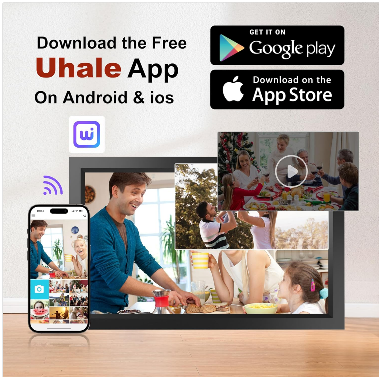
Image: Instructions to download the free Uhale App from Google Play or the App Store, with a visual representation of the app interface and a digital photo frame displaying shared content.

The Uhale App is essential for sharing photos and videos wirelessly to your frame. It is available for both Android and iOS devices.