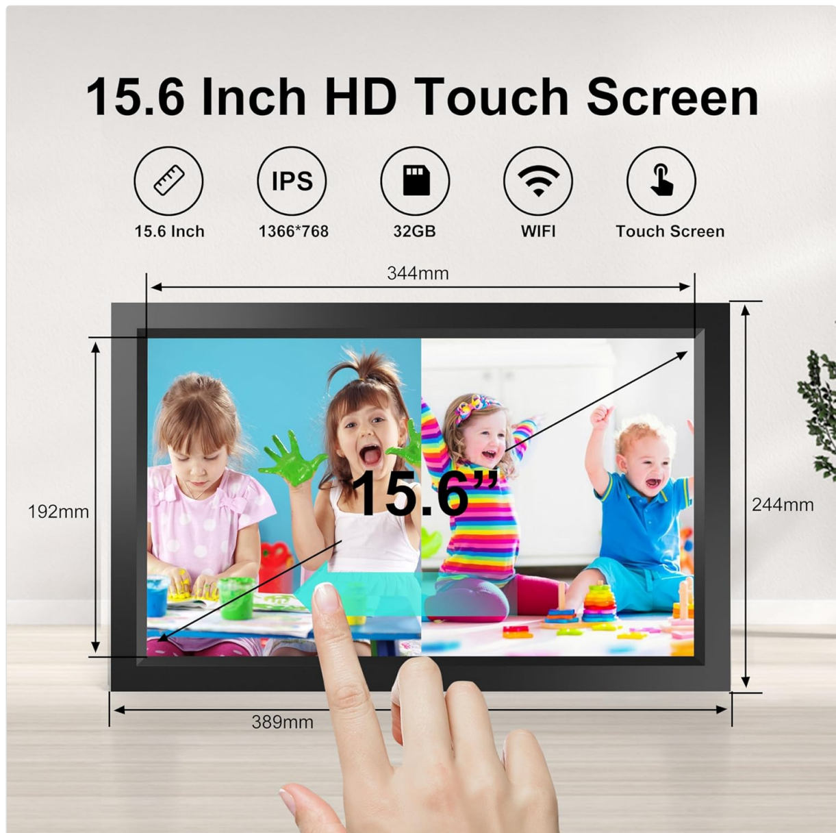
Image: Front view of the Tibuta Digital Photo Frame highlighting the 15.6-inch HD touch screen and its dimensions (389mm x 244mm, 192mm display height, 344mm display width).