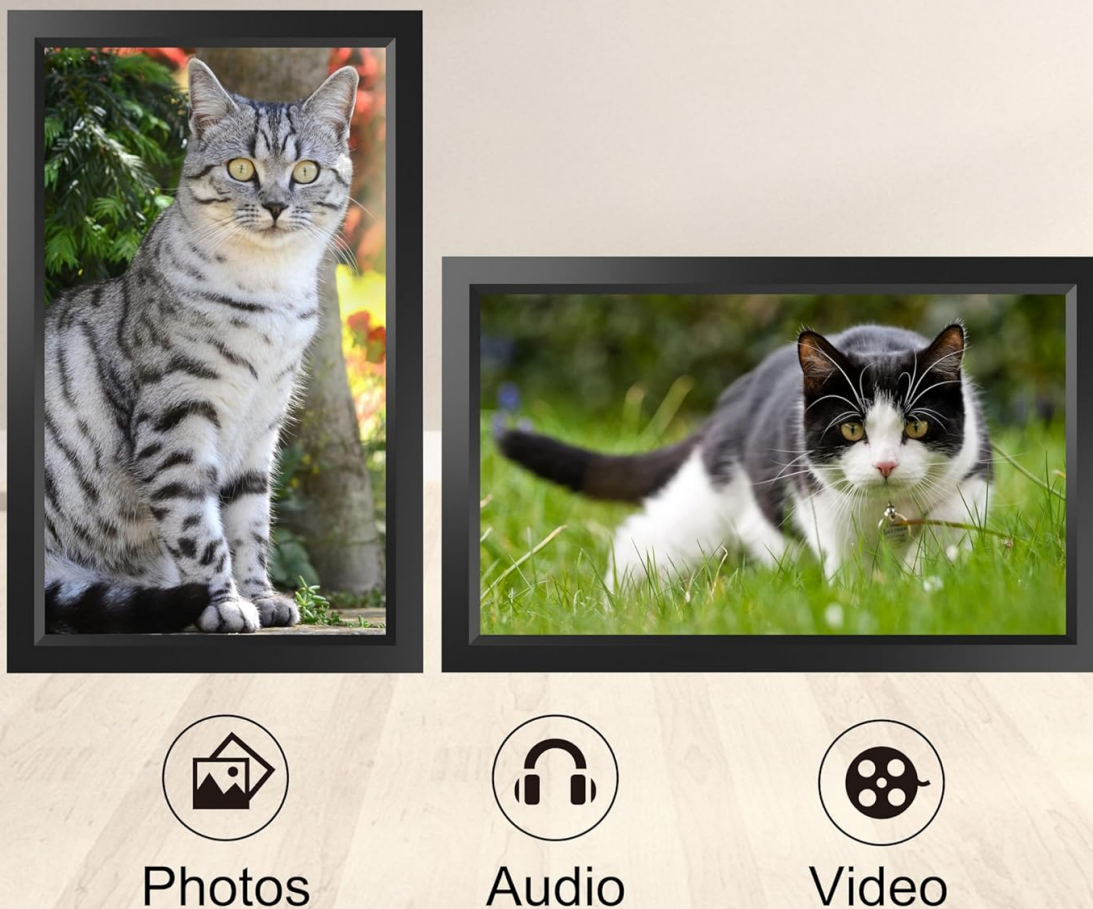
Image: Two digital photo frames demonstrating the auto-rotate feature. One frame is vertical, displaying a cat in portrait orientation. The other frame is horizontal, displaying a cat in landscape orientation. Icons for Photos, Audio, and Video are shown below.