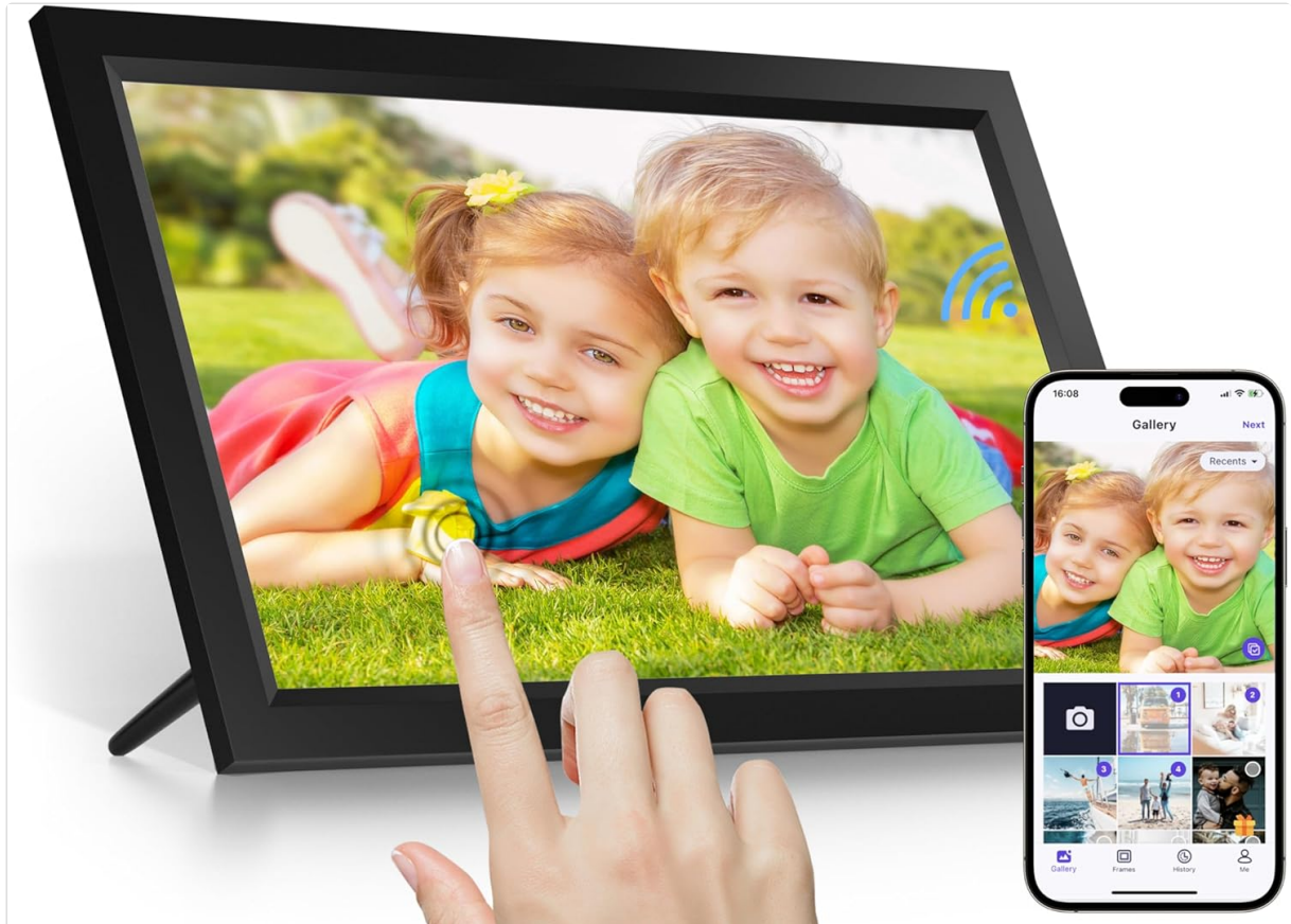
Image: A hand interacting with the touch screen of the Tibuta Digital Photo Frame, which displays two children. A smartphone screen on the right shows the Uhale app interface with a gallery of images.

The frame features a responsive touch screen for easy navigation. Tap, swipe, and pinch to interact with the interface.